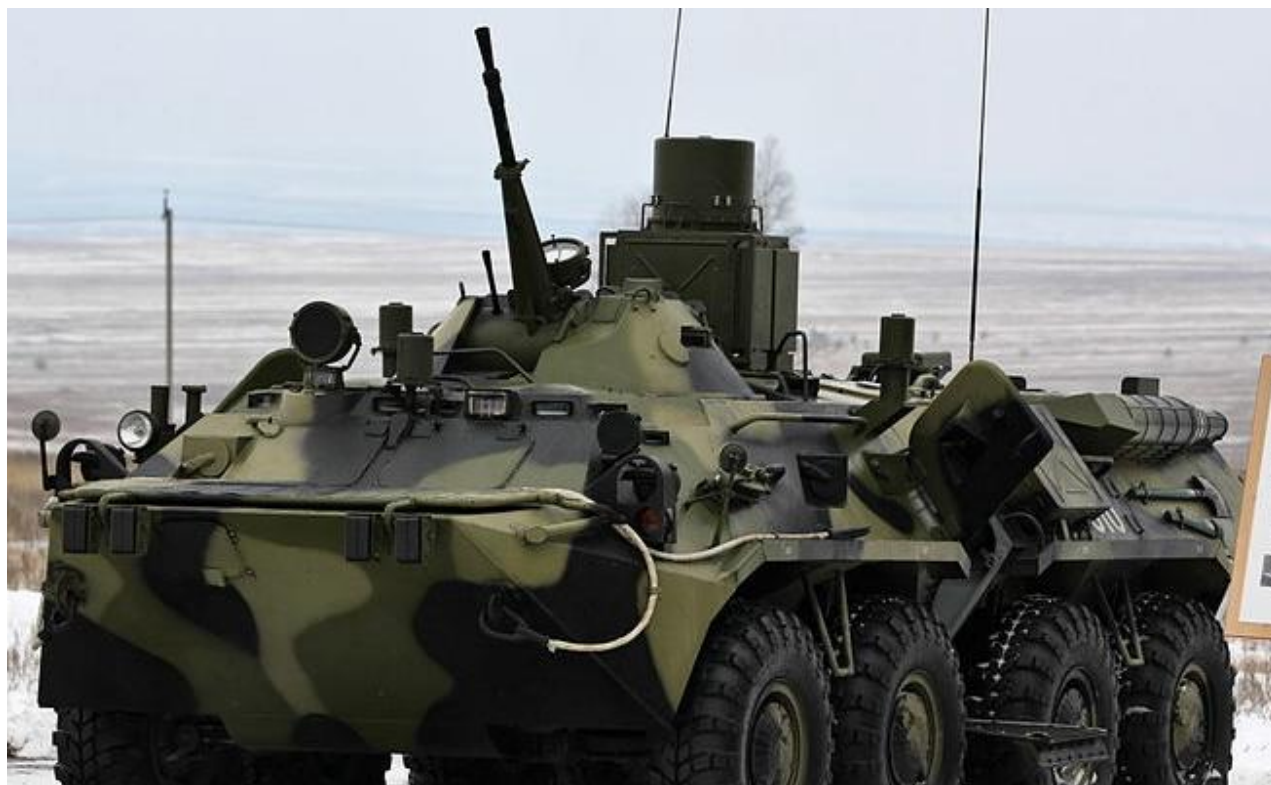
Figure 56. Russian RPM-2

First produced around 2000, the RPM-2 is used for radiological reconnaissance on the battlefield. 170