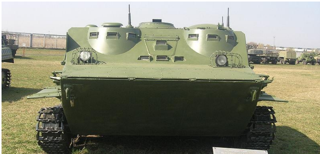
Figure 14. Russian BTR-50PU at the technical museum in Togliatti, Russia

While most BTRs operate on four, six, or eight wheels, the BTR-50 and its variants travel by a tracked system, allowing it to traverse terrain where wheeled vehicles cannot go. In the 1960s and 1970s, the BTR-50 served as the Soviet Union's primary tracked APC before being phased out by the BMP-2