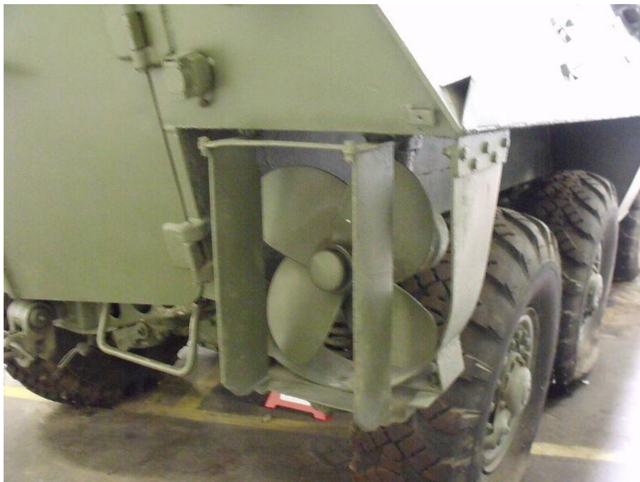
Figure 64. One of the two propellers for amphibious operations on the OT-64

The OT-64-4-3MT/R-4MT variants serve as radio carriers. 200