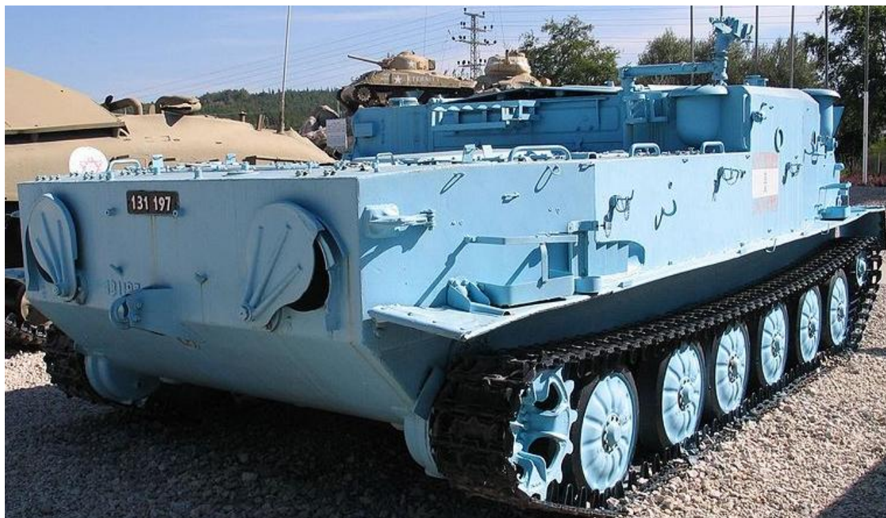
Figure 24. BTR-50 series Medevac vehicle used in South Lebanon on display at the Yad la-Shiryon Museum in Israel

Sometimes the OT-62 is configured as an ambulance to evacuate wounded from the battlefield. 45