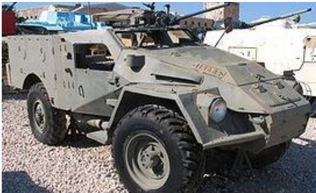
Figure 5. Modified BTR-40 at the Yad la-Shiryon Museum in Israel