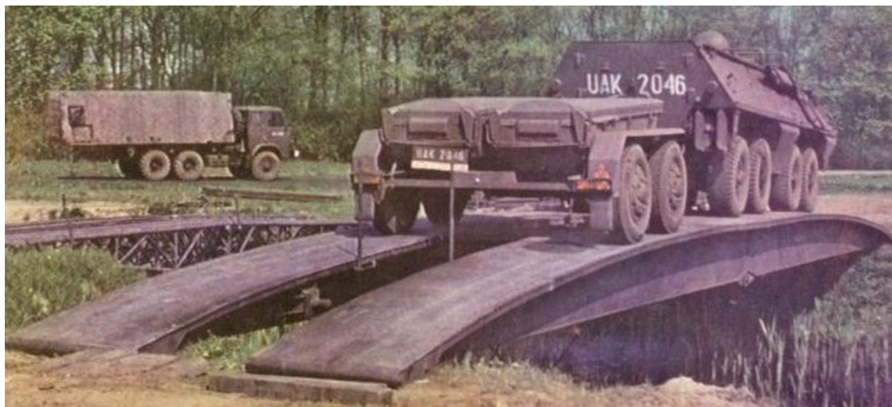
Figure 70. SKOT-WPT crosses a water obstacle on an engineer bridge