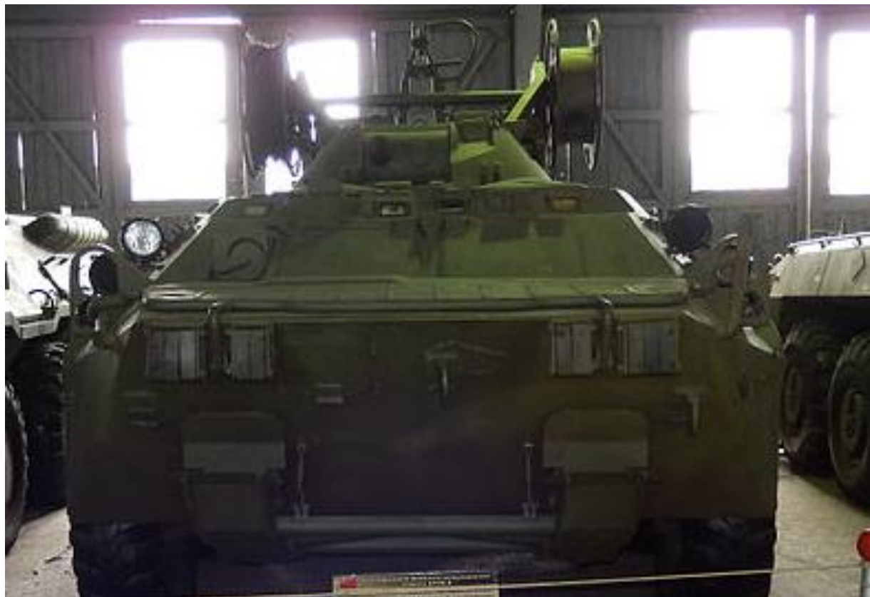
Figure 45. BREM-K Armored Recovery Vehicle

The BREM-K ARV is the name given to BTR-80s used as armored recovery vehicles. The ARV contains a mounted A-frame and tow bars. 125