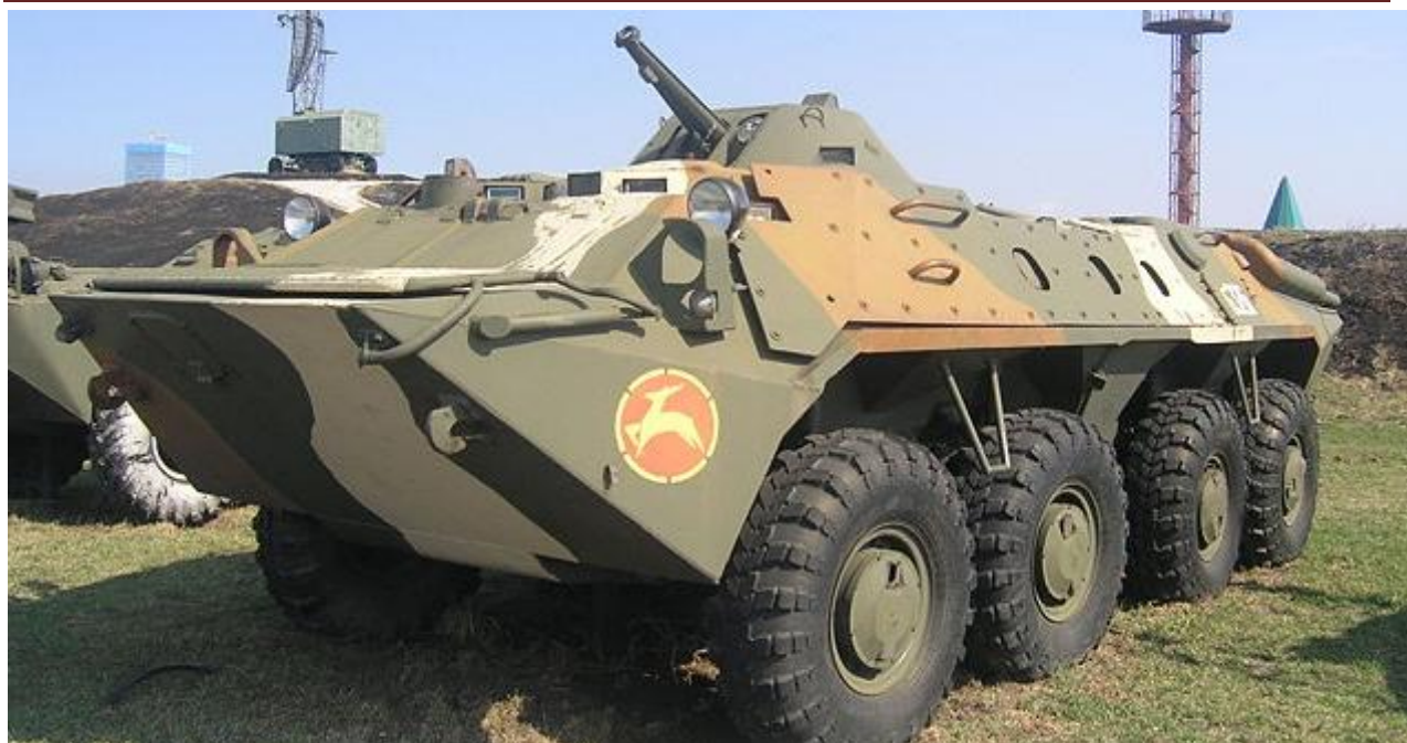
Figure 35. BTR-70 at the technical museum in Togliatti, Russia

The BTR-70 was supposed to have been an improved version of the BTR-60, and was first seen in November 1980. This vehicle possesses the same boat-like shape as the BTR-60, but sports a wider nose and a more powerful engine. There is also a wider gap between the second and third axles, providing space for hatches that allow disembarked troops to enter the vehicle through its sides. The BTR-70 still has a crew of two but can carry up to nine soldiers. 88