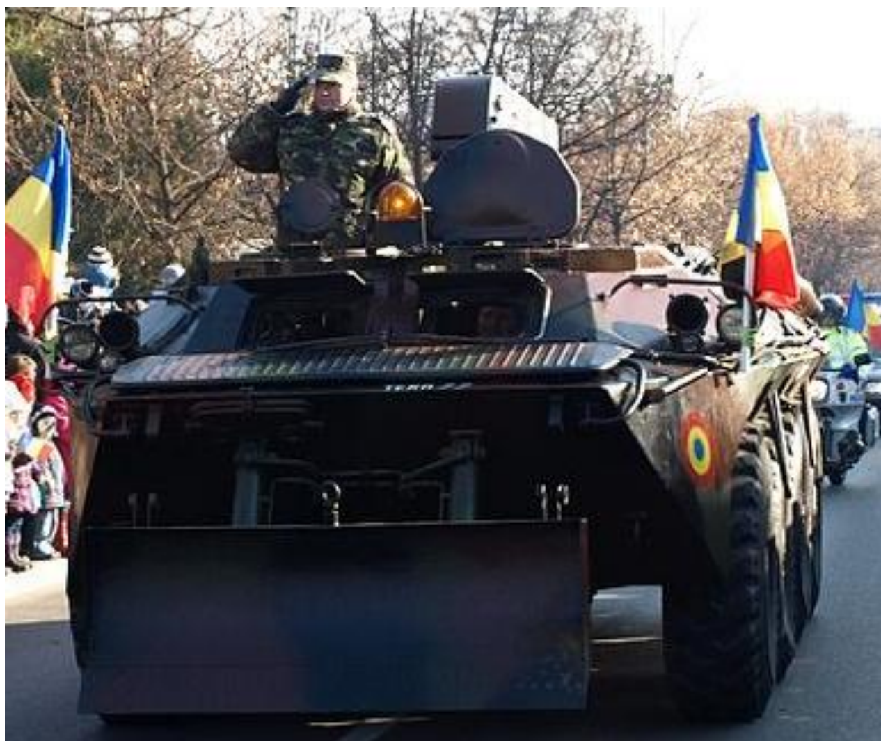
Figure 40. TERA-77L in a Ploiesti, Romania military parade

TAB-77s converted for use as a communication vehicles are known as TAB-77A R-1452s. 113