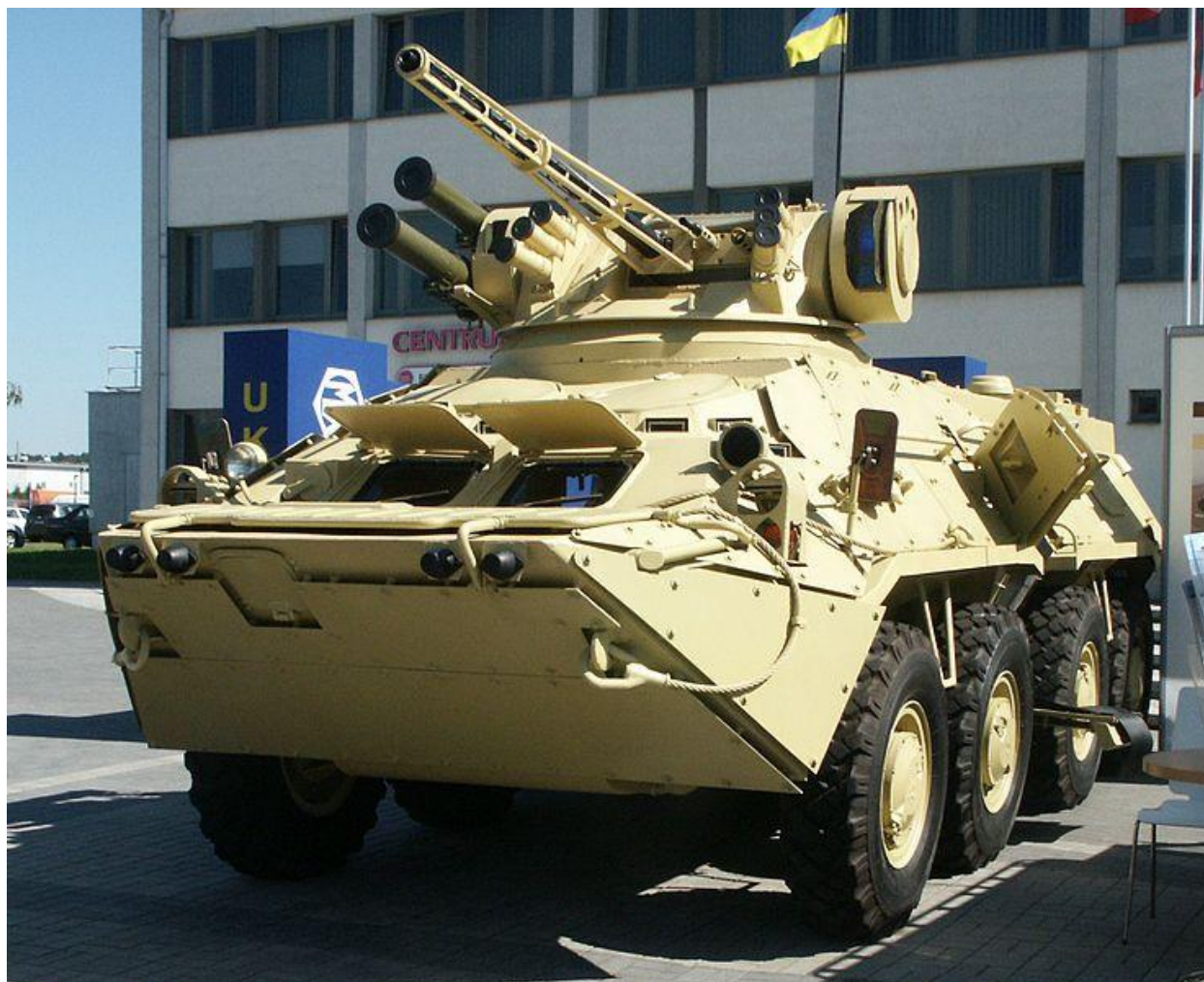
Figure 46. Ukrainian BTR-3E1

There are several other versions in the BTR-3 series of vehicles. The original BTR-3 is most closely associated with the BTR-80. The BTR-3U “Okhotnik” is also known as the BTR-94K and is the base model. The Ukraine has exported 10 of the BTR-3E series APCs to Burma. 127