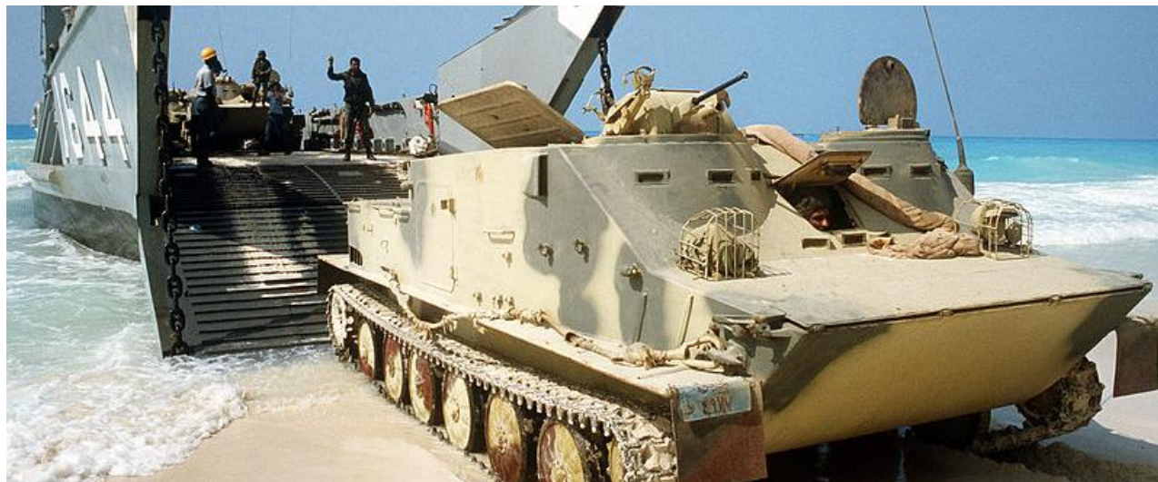
Figure 22. Egyptian OT-62B offloading during Exercise Bright Star '85

The OT-62B/Model 2/TOPAS-2A mounts a small turret on the right side of the front of the vehicle and is armed with a T-21 recoilless gun. The gun can be fired from inside the vehicle, but requires manual loading. The 2.13 kg high-explosive anti-tank (HEAT) round can engage stationary targets at 450 m and 300 m against moving targets. 43