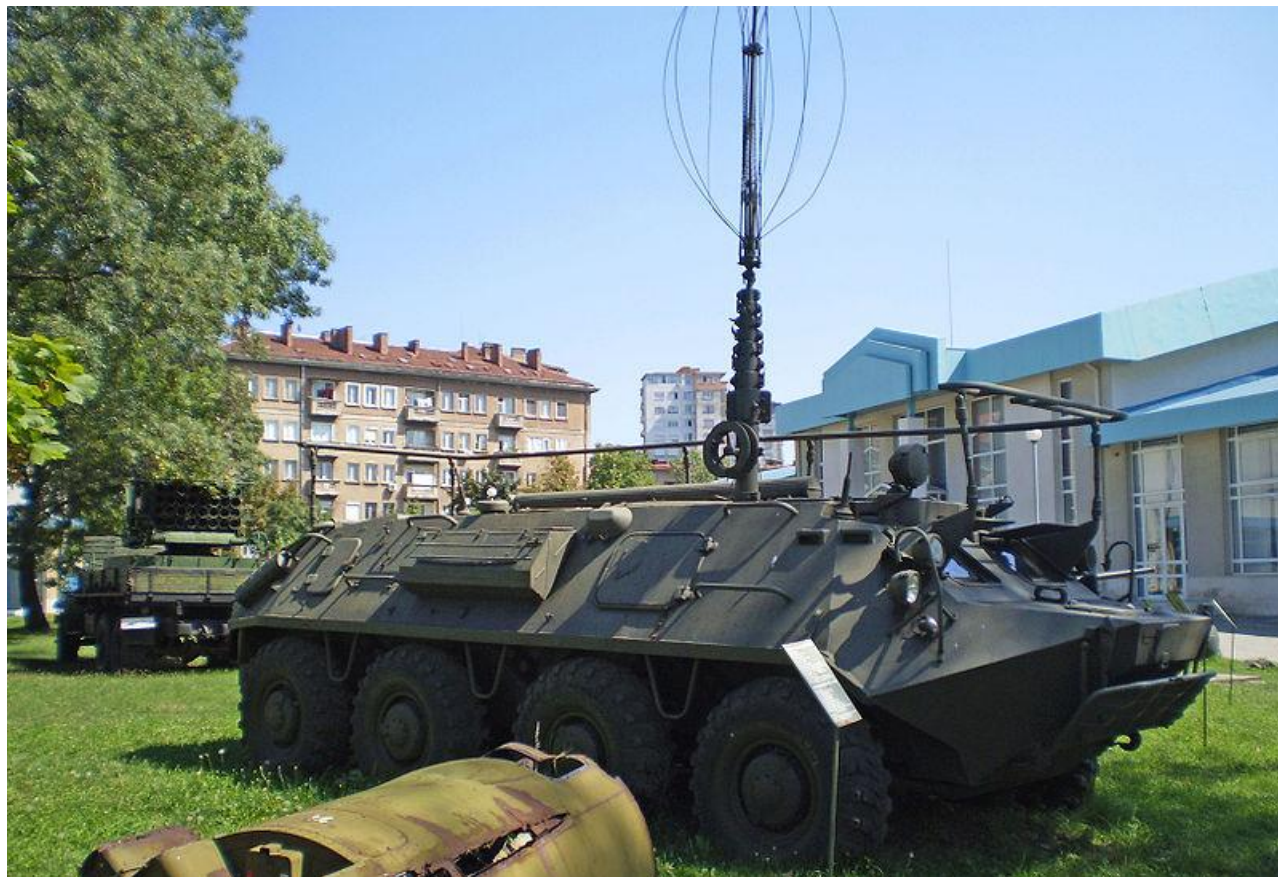
Figure 29. Bulgarian BTR-60PAU Artillery Command Vehicle