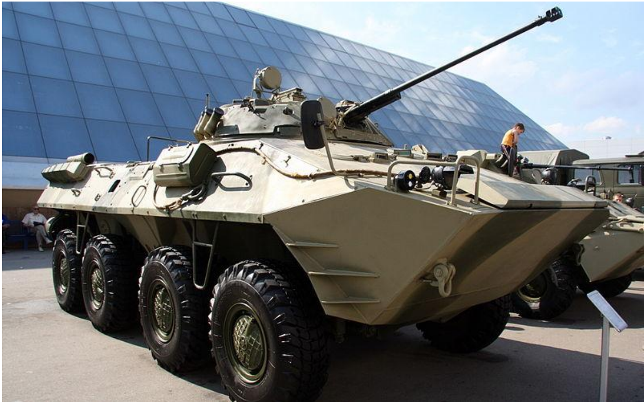
Figure 61. BTR-90

Currently, there are no countries with the BTR-90 in its inventory. The Russians announced in October 2011 that they would discontinue purchasing BTR-90s due to the vehicle's outdated design. A report in 2004 indicated that Jordan provided 50 BTR-90s to Iraq, but they were actually BTR-94s. 181