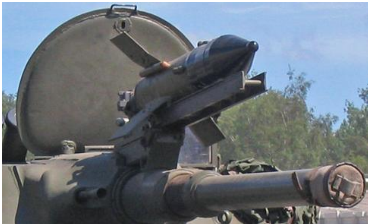
Figure 4. AT-3 Sagger missile mounted on an armored vehicle