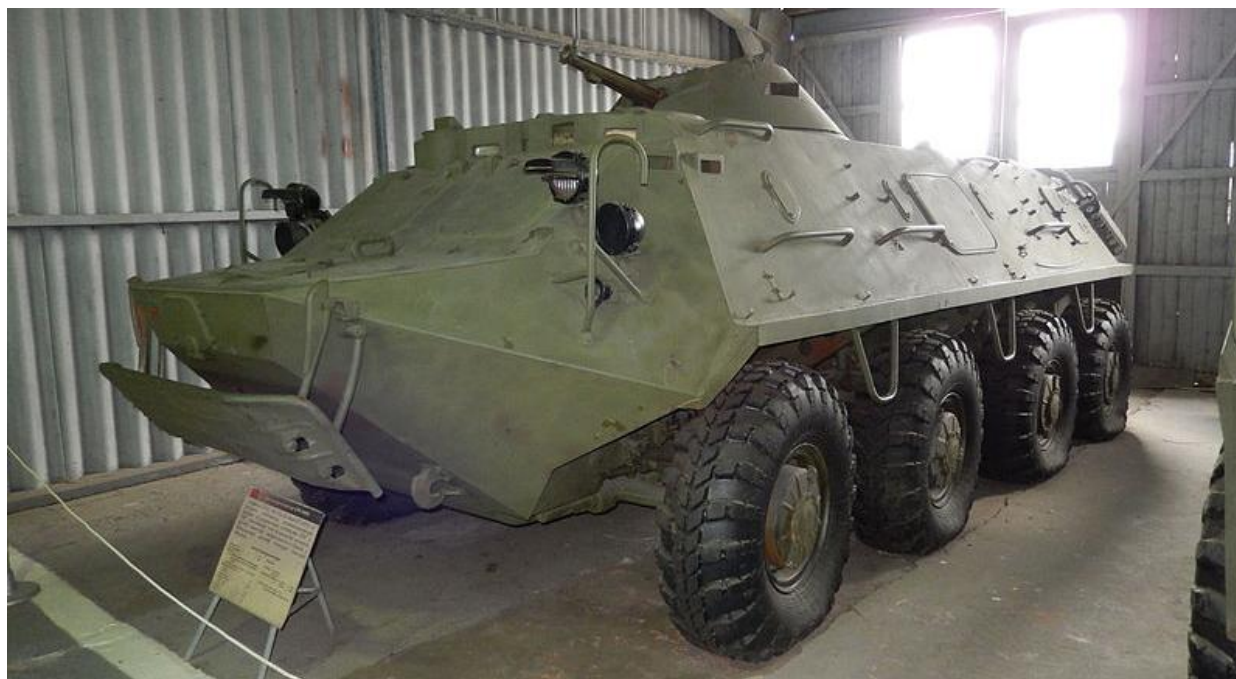
Figure 34. BTR-60PZ in Kubinka, Russia tank museum