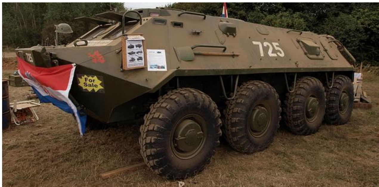
Figure 28. BTR-60PA at the War and Peace Show 2010

In 1963 in its first major modification, the Soviet Union added the armored top to protect the troop compartment and called it the BTR-60PA. The vehicle also contains the centralized NBC pressure system, but the soldiers have to exit the vehicle through hatches in the troop compartment top. There are three firing ports on each side of the vehicle for personal weapons. Some BTR-60PAs carry a 12.7-mm heavy DShK machine gun with two 7.62-m PKT machine guns as auxiliary weapons. 63