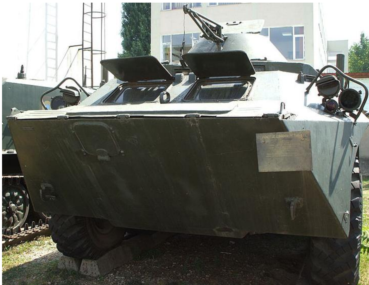
Figure 39. TAB-77A PCOMA at the King Ferdinand National Military Museum in Bucharest, Romania

A second Romanian, the TAB-77 M1984, prototype featured a 23-mm main gun and the 9M14M ATGM system. 110