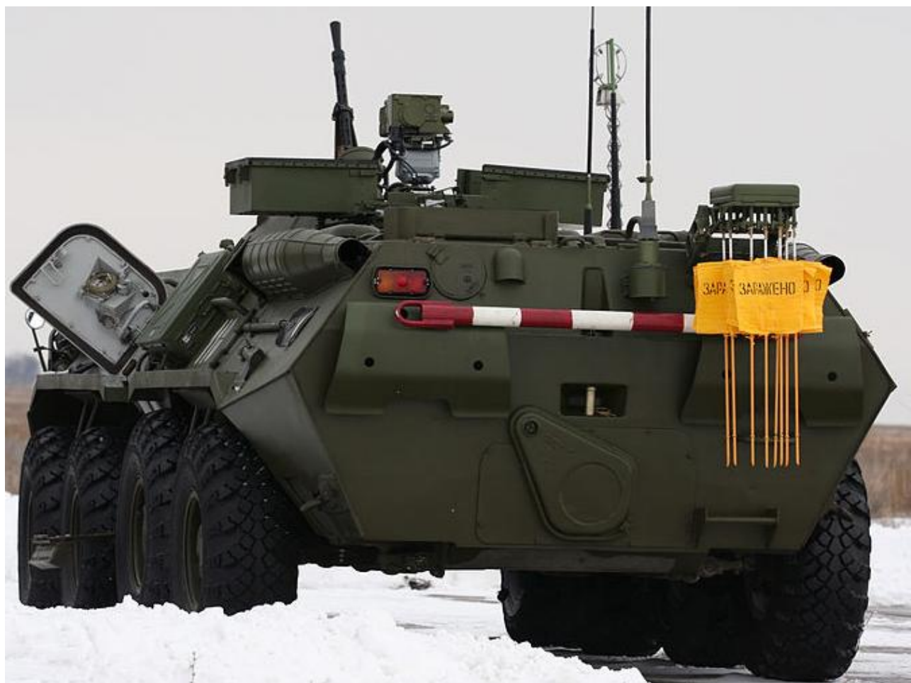
Figure 55. RkhM-6 with NBC markers that can be deployed from inside the vehicle

An even newer NBC reconnaissance and detection variant that can indicate safe lanes with markers that deploy while the crew stays inside the vehicle.