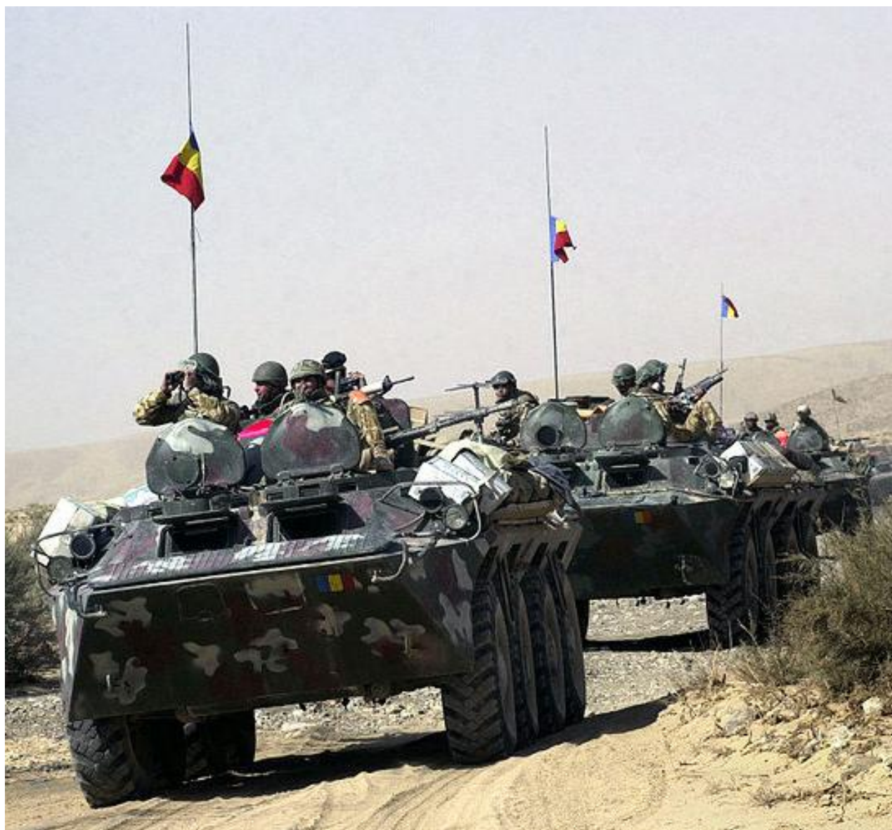
Figure 38. Romanian TAB-77s on patrol in Afghanistan

East German BTR-70s used as an NBC reconnaissance vehicle received the SPW 70(Ch) designation. 107