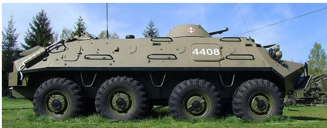
Figure 30. Polish Army BTR-60PB