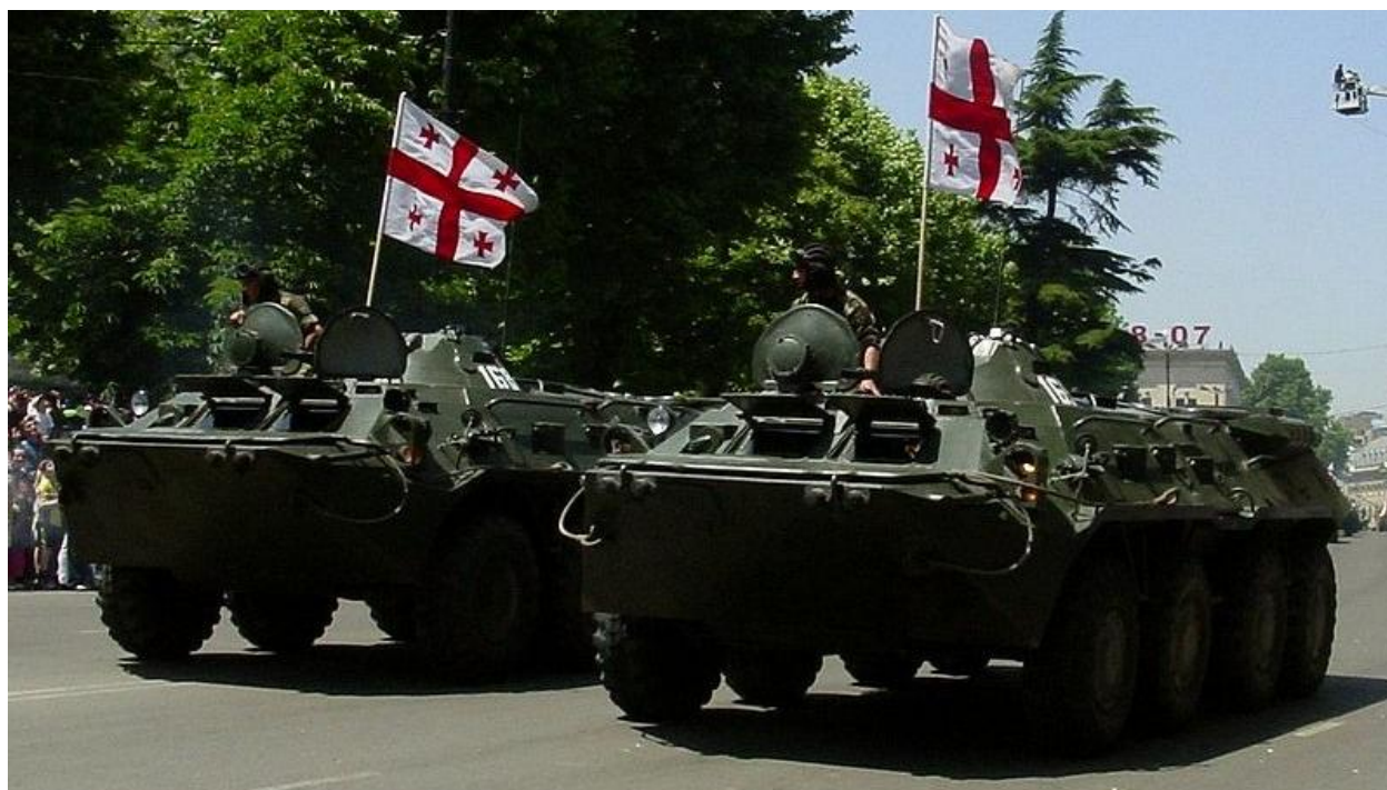
Figure 50. Georgian BTR-80S APCs in Georgian Independence Day Parade in Tbilisi

The BTR-80S version removes the standard turret from the BTR-80A and replaces it with a modular armament system that includes special TNP-3 day/night sights, a 14.5-mm KPVT machine gun and a 7.62-mm PKT coaxial machine gun. 144