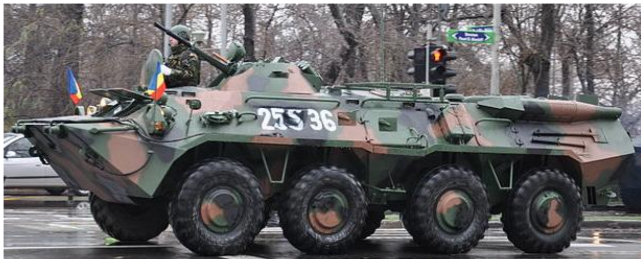
Figure 59. B33 TAB Zimbru at the National Day Parade in Romania

The TAB Zimbru is the Romanian designation for a BTR-80 with a Model 1240 V8-DTS series engine with 268 horsepower, additional storage space for 12.7-mm ammunition, and the Romanian radio system. 174