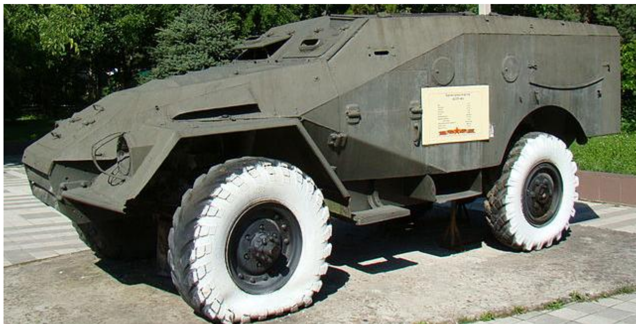
Figure 3. BTR-40B