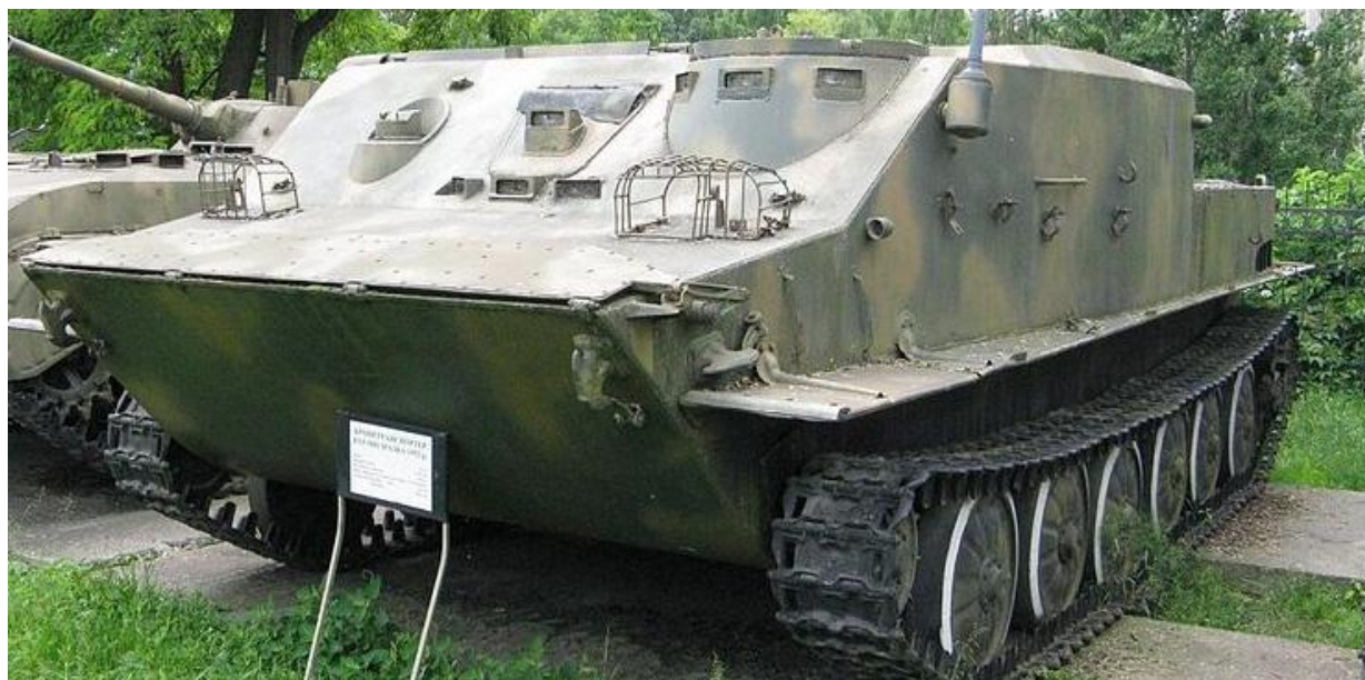
Figure 17. Ukrainian BTR-50P without its weapons systems