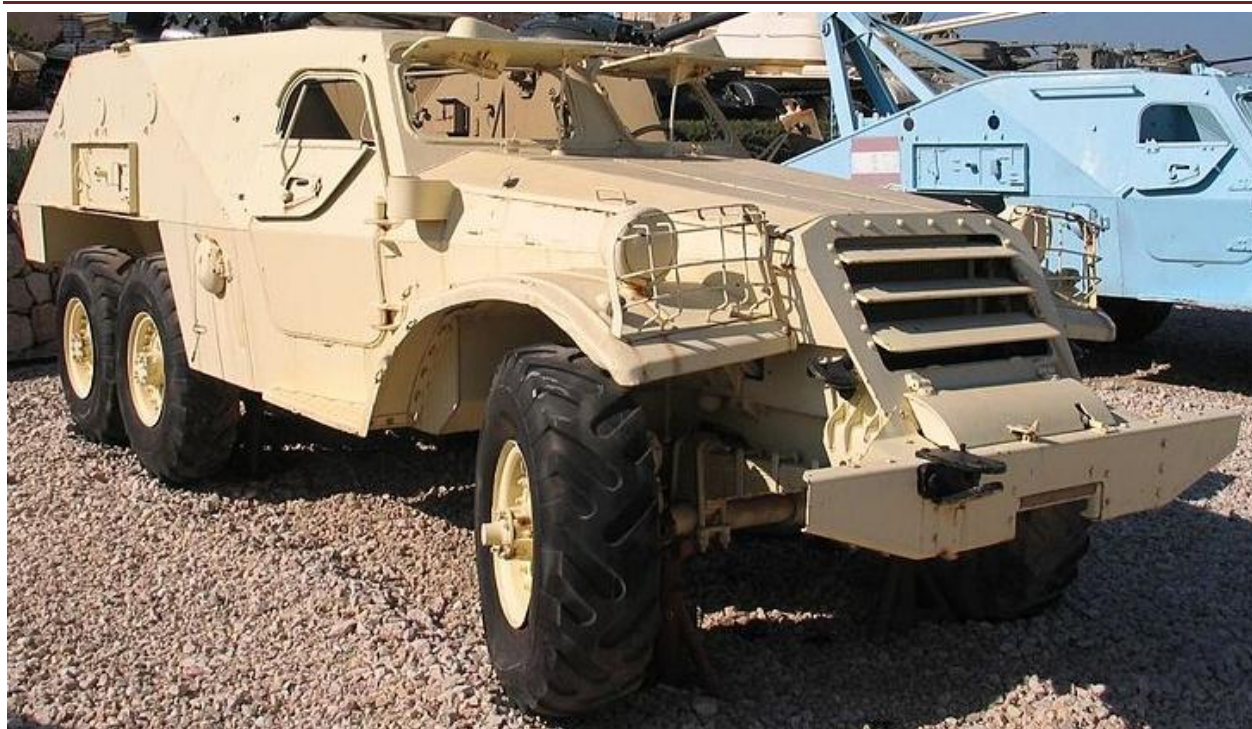
Figure 6. BTR-152 at the Yad la-Shiryon Museum in Israel

The Soviets initially built the BTR-152, which first entered service in 1950, based on the ZIL-151 ( Zavod imeni Likhachova ) truck, but later built the APC on the more sturdy ZIL-157 chassis. The vehicle carries a crew of two – commander and driver – and up to seventeen passengers in the rear cargo compartment. The BTR-152 can travel up to 65 km/h on the road, with a cruising range of 650 km. The primary main armament on most versions consists of a 7.62-mm SGMB (SG-43 Goryunov modernized) machine gun with a basic load of 1,250 rounds. Sometimes the Soviets would replace the normal machine gun with a 12.7-mm DShK ( Degtyaryova-Shpagina Krupnokaliberny ) 1938/46 heavy machine gun, with only 500 rounds of ammunition. The BTR-152 contains two side pintle mounts for additional 7.62 machine guns as well as three firing ports on each side of the vehicle and an additional firing port in each rear door. Some of the later versions include closed tops to protect the soldiers in the troop compartment. 12