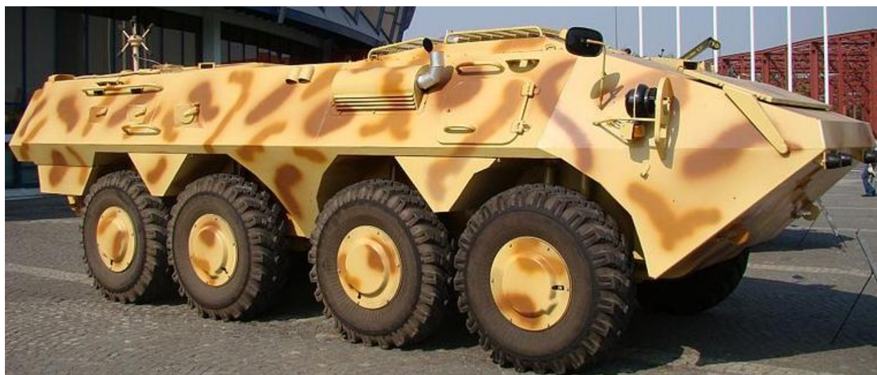
Figure 58. Saur 2 at the Expomil 2011 in Bucharest, Romania

The Saur 2 is the Romanian designation for an improved version of the Saur 1. 172