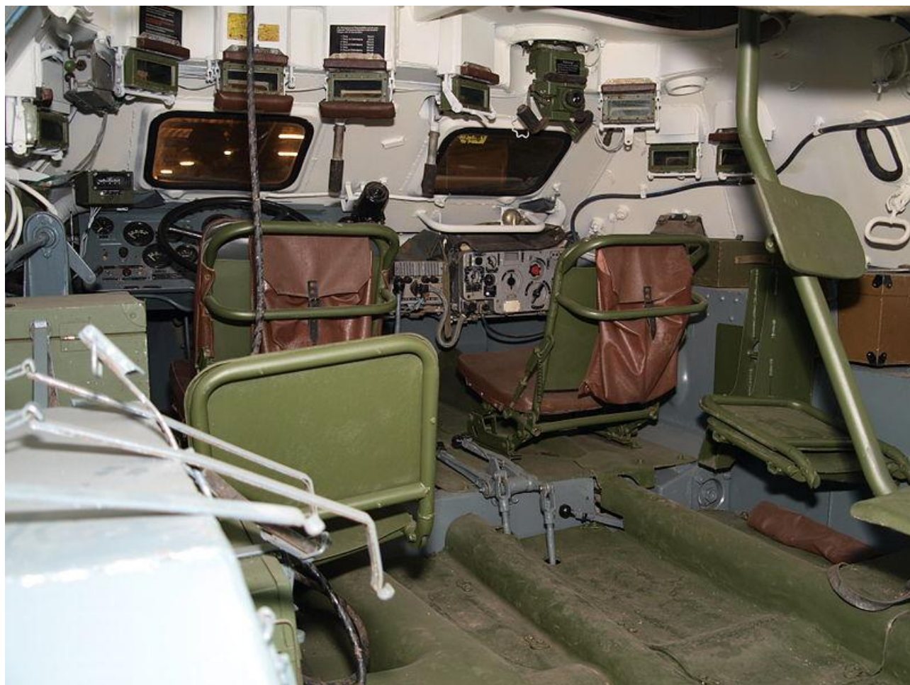
Figure 32. BTR-60PB Crew Compartment Interior