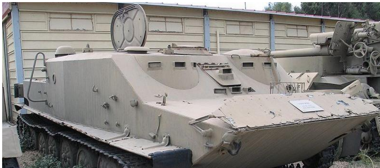
Figure 20. BTR-50PU Command Vehicle at the Batey ha-Osef Museum in Israel

The Soviets designed the BTR-50PK(B) as an amphibious armored recovery vehicle to assist and support vehicles at river crossing sites or move damaged vehicles away from the water obstacle. While the vehicle contains two radios for improved communication, the BTR-50PK(B) does not carry a winch or crane system and must use tow bars or chains to move the disable vehicles. 38