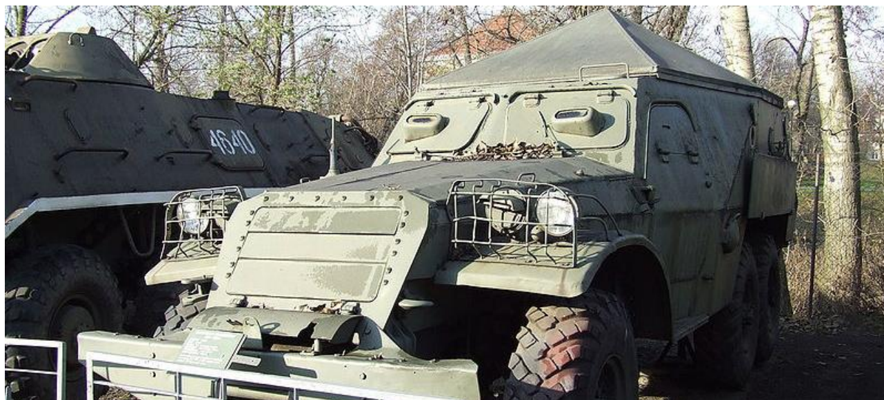
Figure 10. BTR-152U at a military museum in Warsaw, Poland