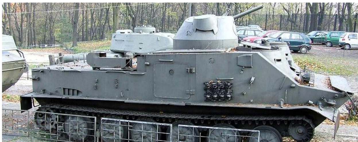
Figure 23. TOPAS-2AP at a Warsaw, Poland museum

The OT-62C/Model 3/TOPAS-2AP is the same APC as the OT-62A, but produced by Poland and called the TOPAS-2AP. The TOPAS-2AP sometimes features a turret-mounted weapon. 44