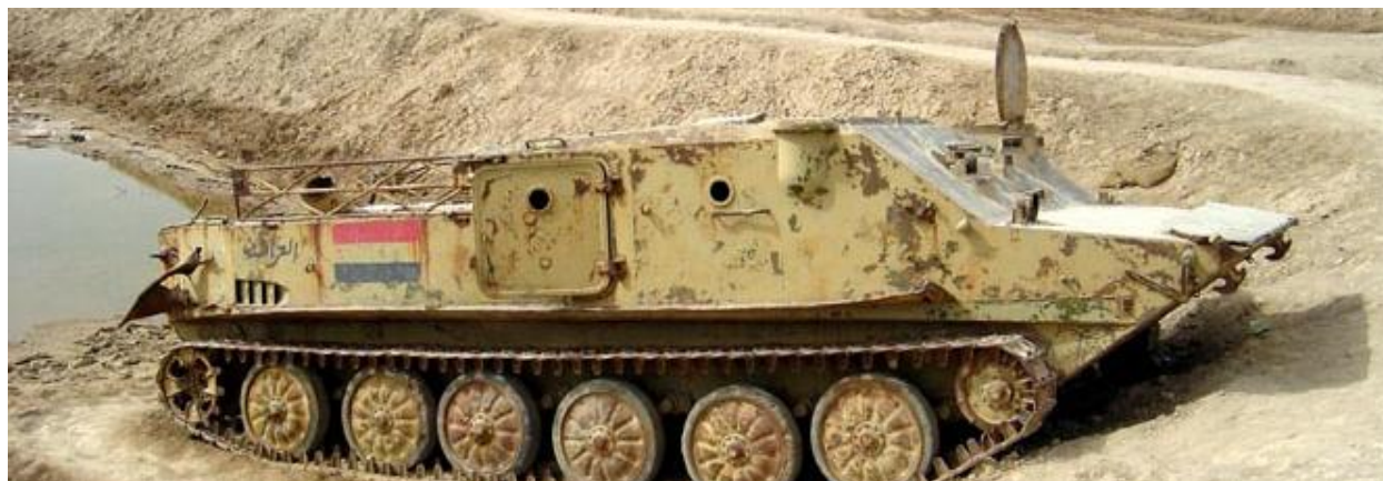
Figure 19. Iraqi BTR-50—Possibly a BTR-50PK(B)

The BTR-50PK is similar to the original BTR-50P, but contains two firing ports on each side of the vehicle, an NBC defense system, and a closed armored top to provide more protection to soldiers in the troop compartment. There is a 7.62-mm machine gun mounted on the vehicle's front. 37