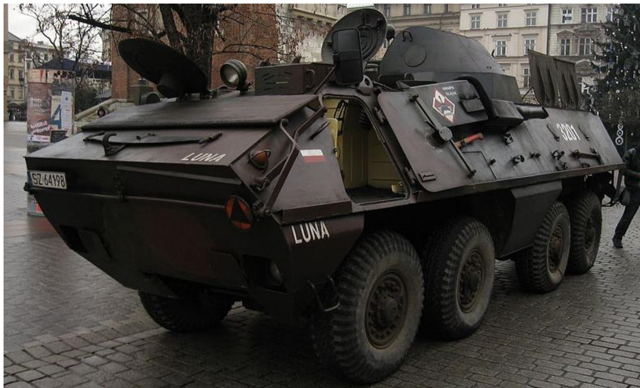
Figure 69. OT-64C(S) in Krakow, Poland

This is the version that was prevalent throughout the Polish army. This turret, while shaped differently than other SKOTs, carries the same two machine guns as the SKOT-2A and the ATGM, but its maximum elevation can reach 89.5 degrees. 205