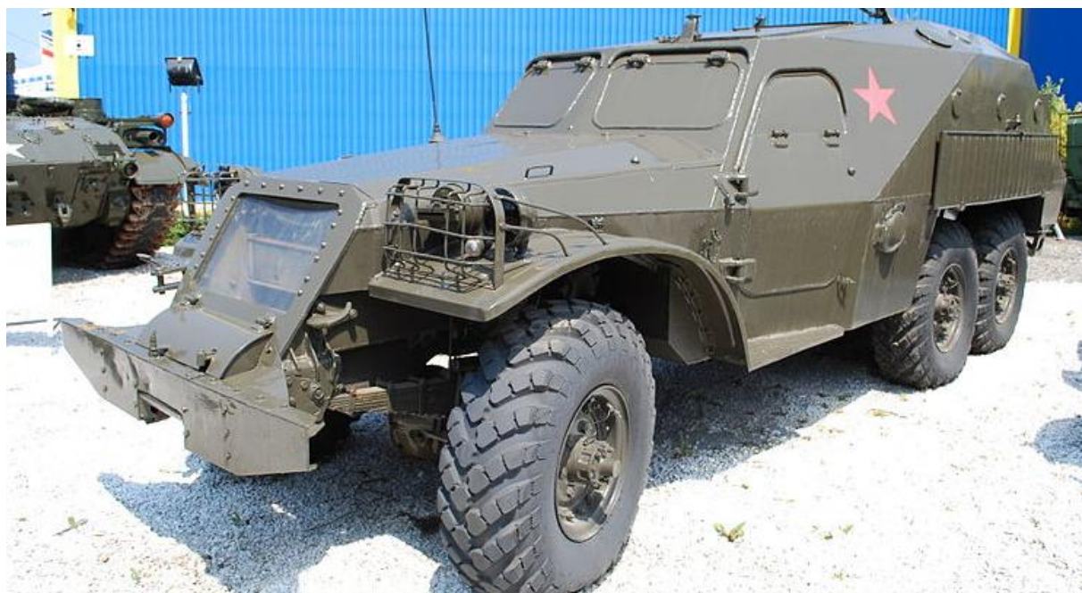
Figure 9. Russian BTR-152K without its 7.62-mm machine gun

of 15 soldiers including the crew, but featured a heater and an NBC overpressure system. Soldiers could operate a heavy machine gun mounted on the four roof brackets, but one of the hatches needed to be opened to fire the weapon. The BTR-152K is adaptable for use as an ambulance, communications vehicle, or for use in an artillery unit. The only difference between the K and K1 versions is that the K featured external CTPRS hoses while the latter used internal hoses. The Soviet Union produced 245 BTR-152K1s. While most went to the army, the Soviet Union's KGB and MVD received a total of 30 of the production models. 20