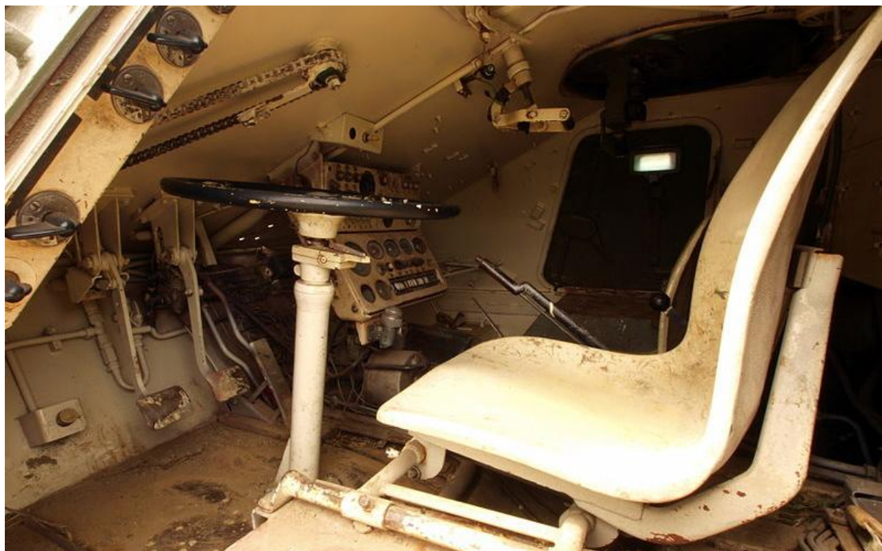
Figure 66. OT-64A Interior