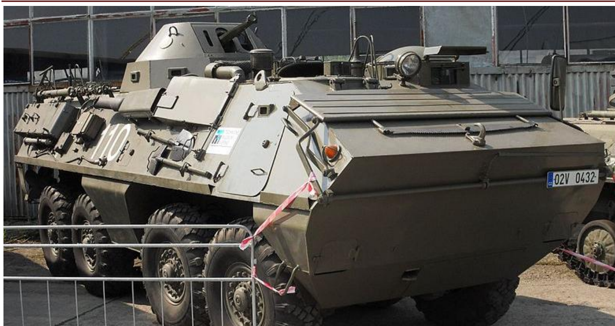
Figure 63. OT-64 at the technical museum in Brno, Czech Republic

The Sredni Kolowy Opancerzny Transporter (SKOT) is an APC similar to the BTR built by Poland and the former Czechoslovakia in the early 1960s. About 10,300 SKOTs were built between the early 1960s and 1990. Also known as the OT-64, primarily for the vehicles made in the former Czechoslovakia and now Slovakia, this vehicle with a crew of two can carry up to 18 soldiers who either enter through five hatches on top of the vehicle, or through two doors in the rear of the vehicle. The SKOT can travel up to 94.4 km/h on roads, and can travel up to 710 km on its 320 liter fuel tank. This amphibious vehicle can cross water obstacles at 9 km/h by using its two propellers. 196