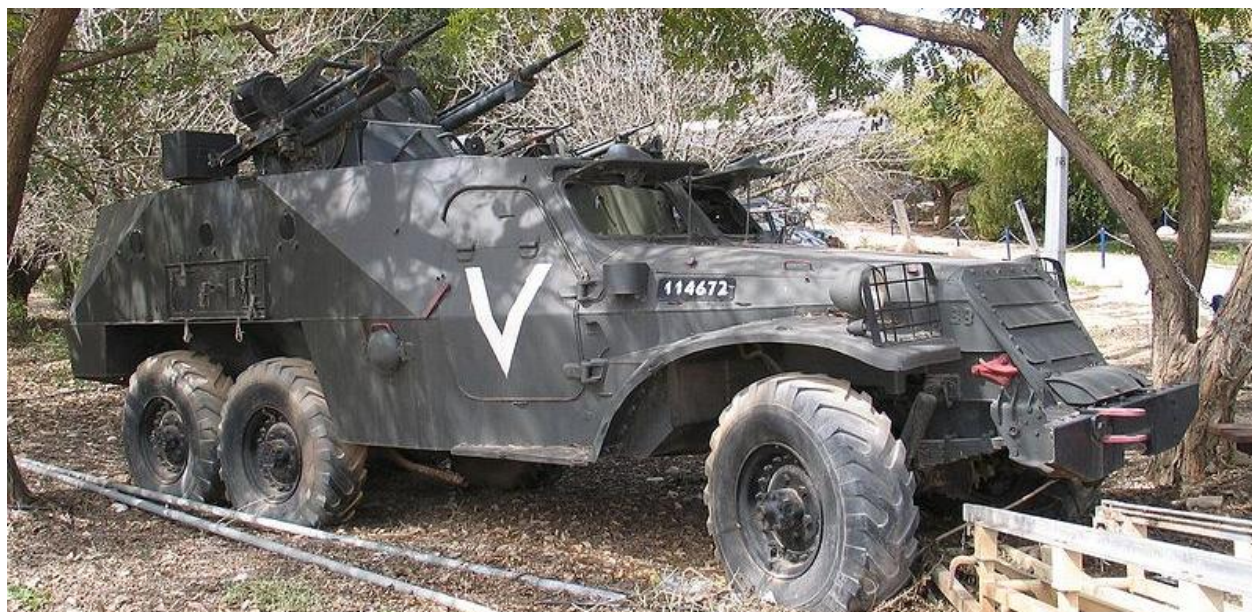
Figure 8. BTR-152 captured by the Israeli Army and armed with 20 mm cannons (BTR-152 TCM-20)