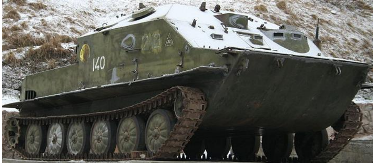
Figure 16. BTR-50MTP in Ukraine

Known by the Russians by the designation, UR-67, because of the explosive line charges of the same nomenclature that the vehicle carries. The BTR-50MTK is a mine-clearance variant that fires rockets launched from tubes located inside the vehicle. 33