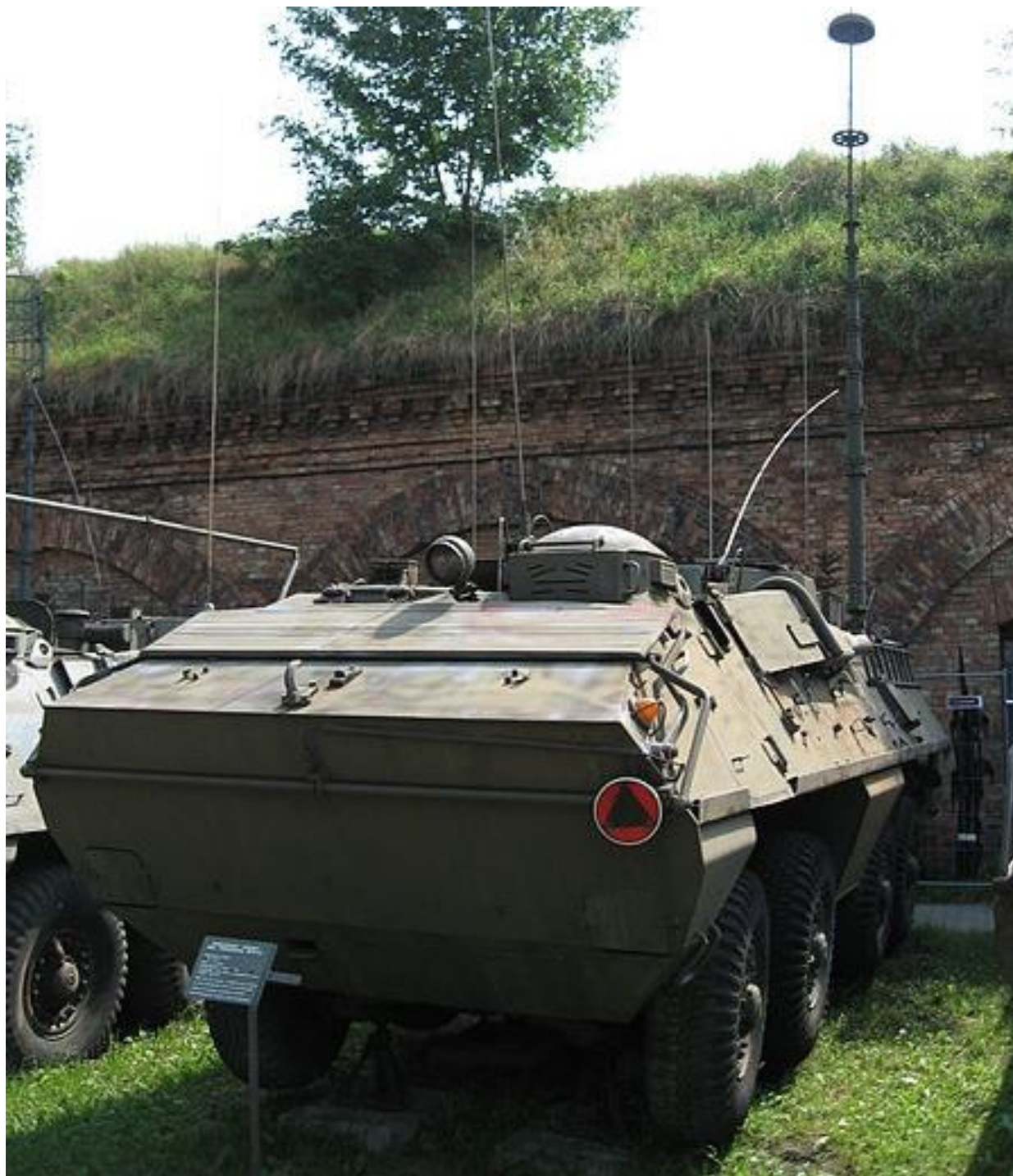
Figure 71. This SKOT command vehicle has at least 8 antennas