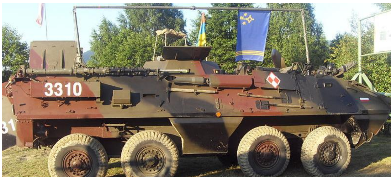
Figure 67. SKOT-2 at the Military Vehicle Collectors show in Bielsko Biala, Poland

Only Poland produces this version of the SKOT. This vehicle features split hatches that can be locked in their vertical positions. The weapons are normally pintle-mounted 7.62-mm machine guns or a 12.7-mm machine gun behind a metal shield. 203