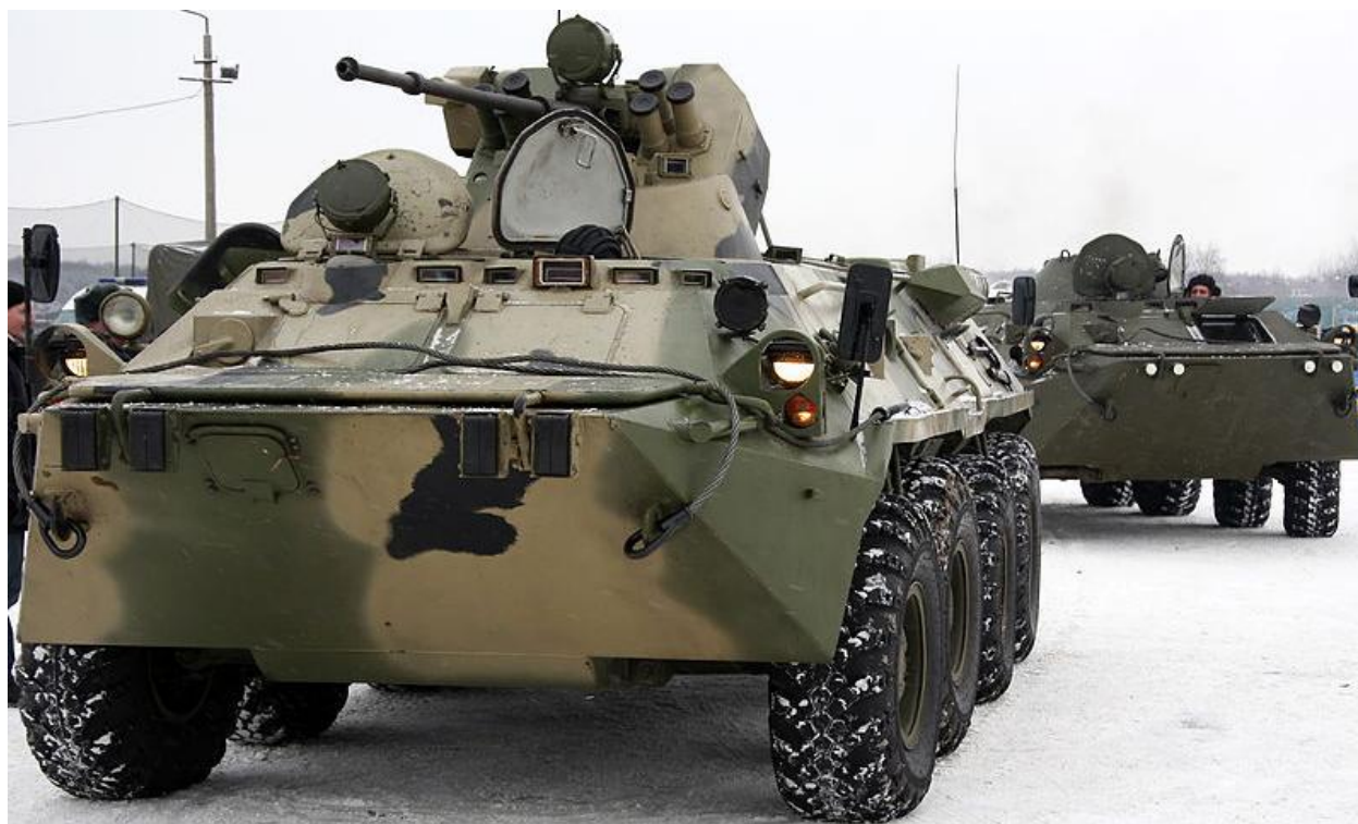
Figure 49. BTR-80A

The BTR-80A version carries a turret with TNP-3 day/night sights, a 2A72 30-mm cannon, and a 7.62-mm PKT coaxial machine gun similar to the turret found on the German Marder APC. The BTR-80A also carries three additional smoke grenade launchers. 132