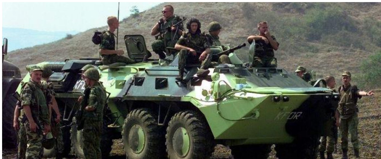
Figure 48. Russian BTR-80 in Kosovo

The one-man turret operates a variety of weapons systems. These include the 30-mm dual feed cannon with 350 rounds of ammunition, a 7.62-mm coaxial machine gun with 2,500 rounds, a 30-mm grenade launcher with 116 rounds (29 in the ready magazine with three additional magazines in reserve), and six 81-mm electrically-operated smoke grenade launchers. 129