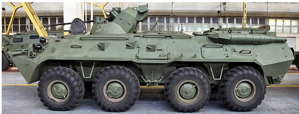
Figure 51. Russian BTR-82A

First produced in 2009, the BTR-82A's main armament is the 2A72 30-mm automatic cannon with day and night sights along with the other features of the BTR-82 including the 7.62-mm coaxial machine gun.