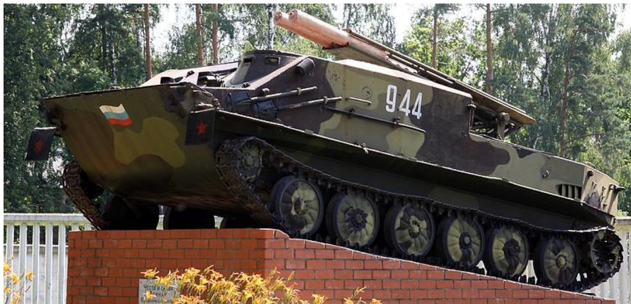
Figure 15. MTK (UR-67)

The BTR-50's top speed is 44 km/h with a range of 400 km. The BTR-50 is amphibious and can cross a river at 11 km/h through the use of two hydrojets. The track suspension system consists of a torsion bar, six road wheels, a rear drive, front idler, and two shock absorbers. The tracks do not use any return rollers. The mechanical design places the engine, fuel tanks, and power train for the BTR-50 behind the troop compartment. The BTR-50 mounts an IR search light on the front hull and also features an IR driving light. Some later versions of the BTR-50 use a closed-top system that can be pressurized against a nuclear, biological, or chemical (NBC) attack, and is also outfitted with an automatic engine fire extinguisher system. 32