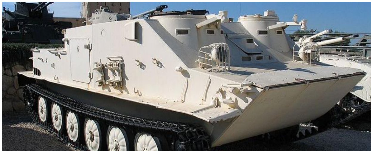
Figure 21. Modified Syrian or Egyptian OT-62 TOPAS at the Yad la-Shiryon Museum in Israel

BTR-50s produced in Czechoslovakia (later Slovakia) and Poland are designated OT-62s, and are almost identical in all aspects to the BTR-50P. OT-62s configured as BTR-50PUs are called TOPAS and possess the armored roof for the passengers, the NBC system, a more powerful engine than the original version, and a side door that passengers use for entering the troop compartment. The TOPAS is sometimes fitted with a small turret. The Israelis captured a number of BTR-50s and OT-62s during the Six-Day and Yom Kippur Wars. The Israelis used the captured OT-62s because of the superior workmanship until the 1980s before they passed them on to the Southern Lebanese Army. After the Southern Lebanese Army fell apart in the early 2000s, several of the previously captured OT-62s ended up in the hands of the Lebanese. 41