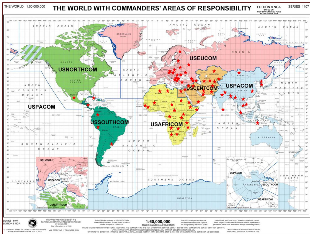
Figure 1. Countries with BTR Variants. The red stars indicate the countries where BTR variants can be found.