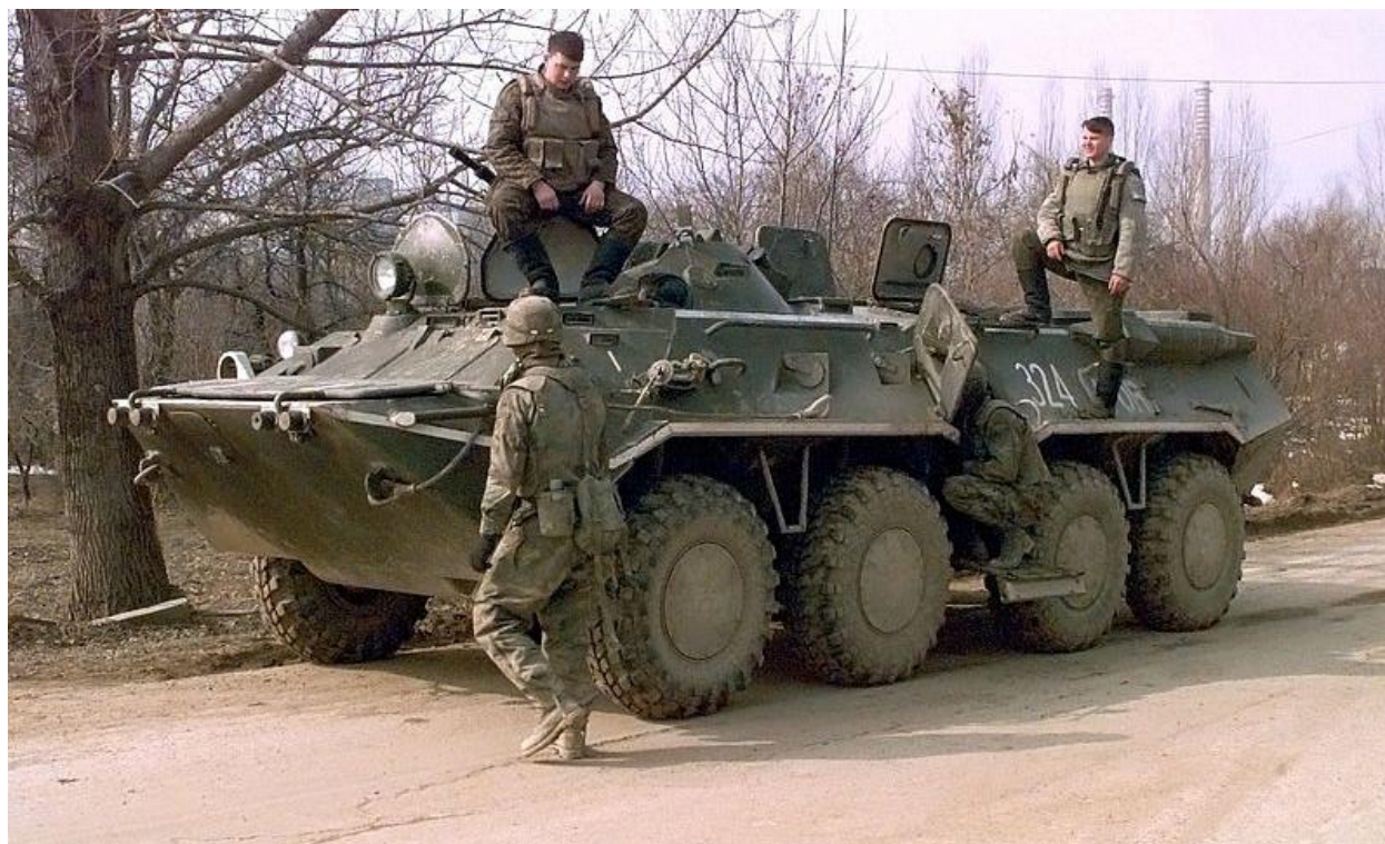
Figure 43. An American Soldier checks out a BTR-80 in Bosnia