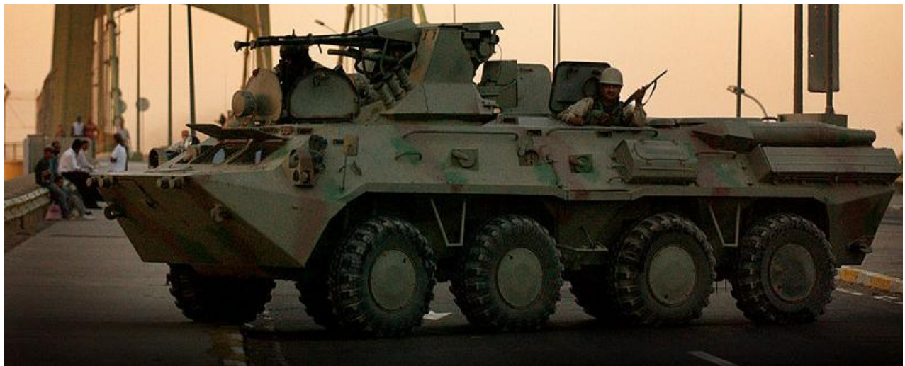
Figure 52. Iraqi National Guard BTR-94

The BTR-94 is the Ukrainian amphibious armored car version of the BTR-80, with twin 2A7M 23-mm machine guns with 200 rounds, a coaxial KT 7.62-mm machine gun with 2,000 rounds, and six 81-mm smoke grenade launchers. 156