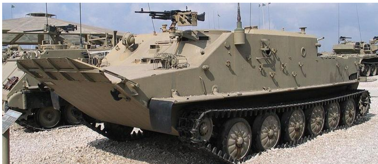
Figure 18. BTR-50PK at the Yad la-Shiryon Museum in Israel

The BTR-50PA is the same APC as the BTR-50P with no AT gun, but instead fires a 14.5-mm KPVT heavy machine gun mounted on the commander's cupola. 36