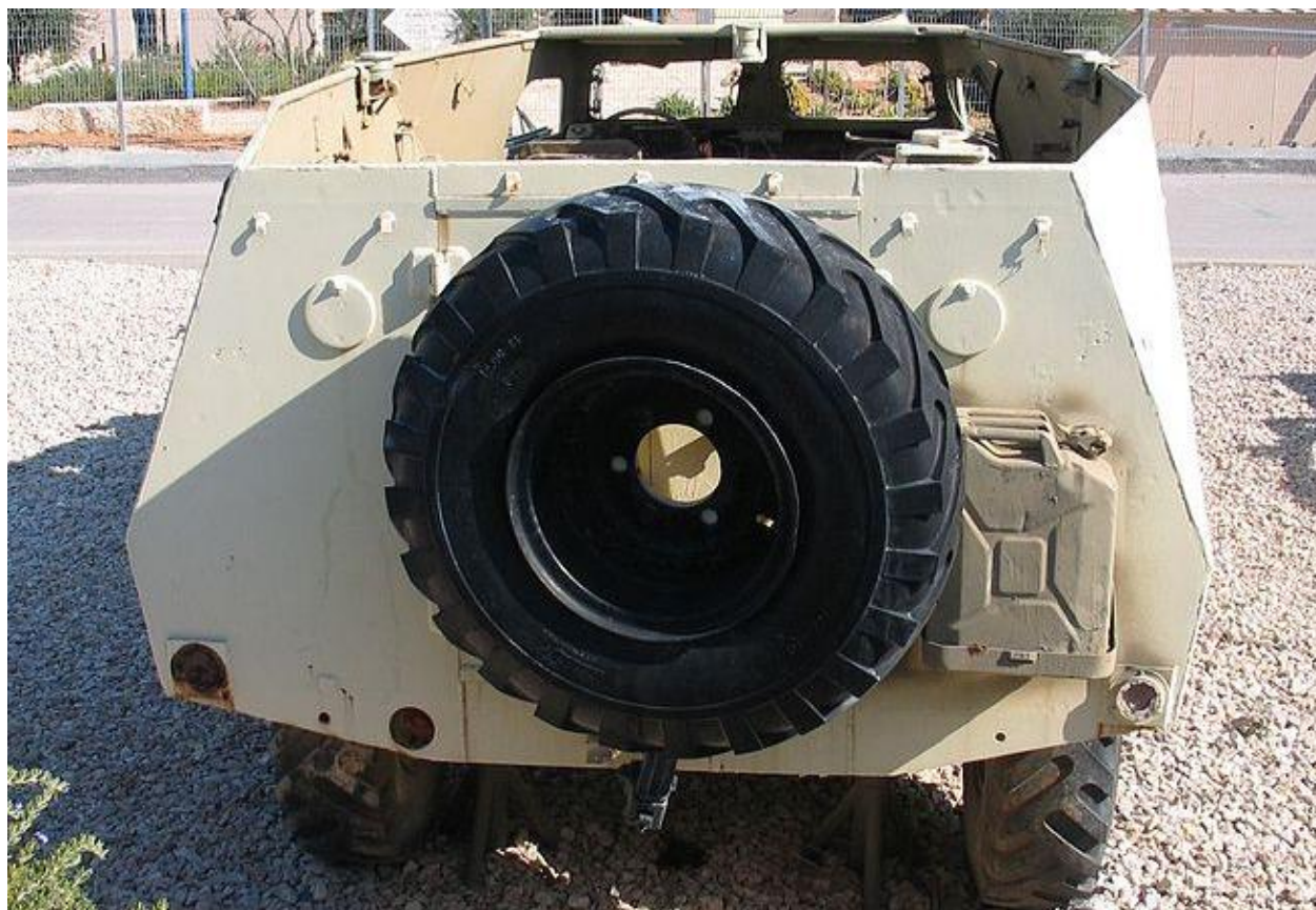
Figure 7 Rear of the BTR-152 at the Yad la-Shiryon Museum in Israel