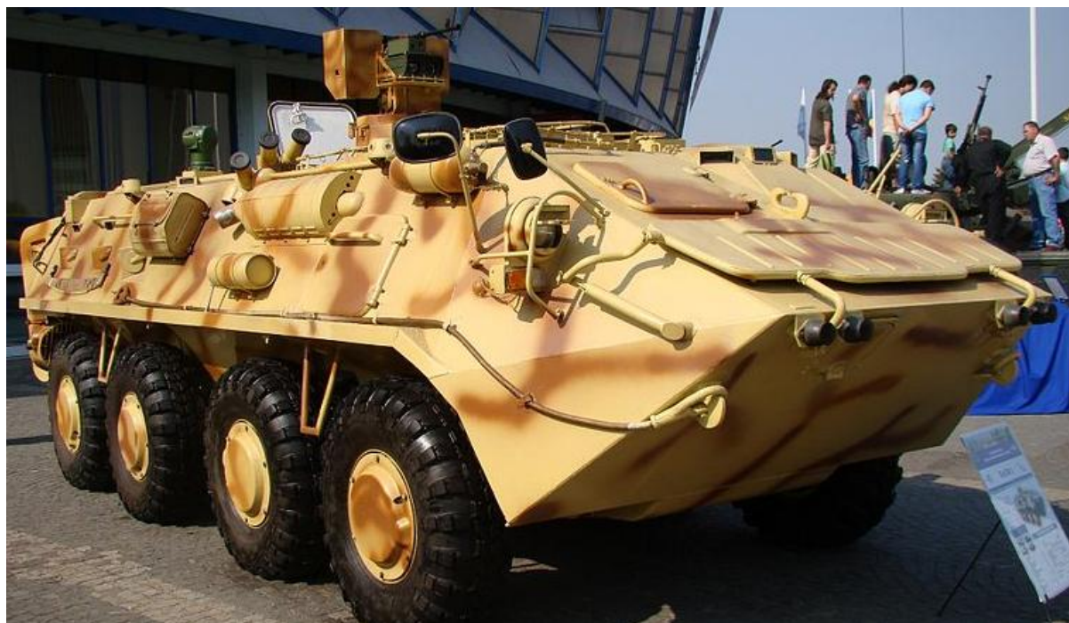
Figure 57. Saur 1 at the Expomil 2011 in Bucharest, Romania