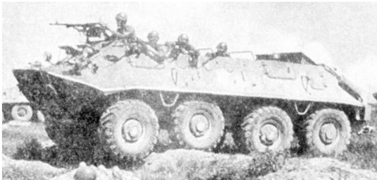
Figure 27. BTR-60P during a Soviet military exercise

The BTR-60 MEP is an infantry command post variant. 60