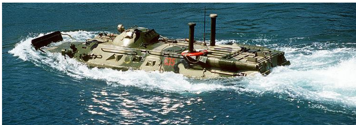
Figure 42. BTR-80 conducting a river crossing

performance with a lower risk of fire. The cruising range for the BTR-70 is 600 km. The entry hatches between the second and third axles on both sides of the vehicle include a step to make entry easier. There are at least 5,000 BTR-80 vehicles in service in approximately 30 countries. 121