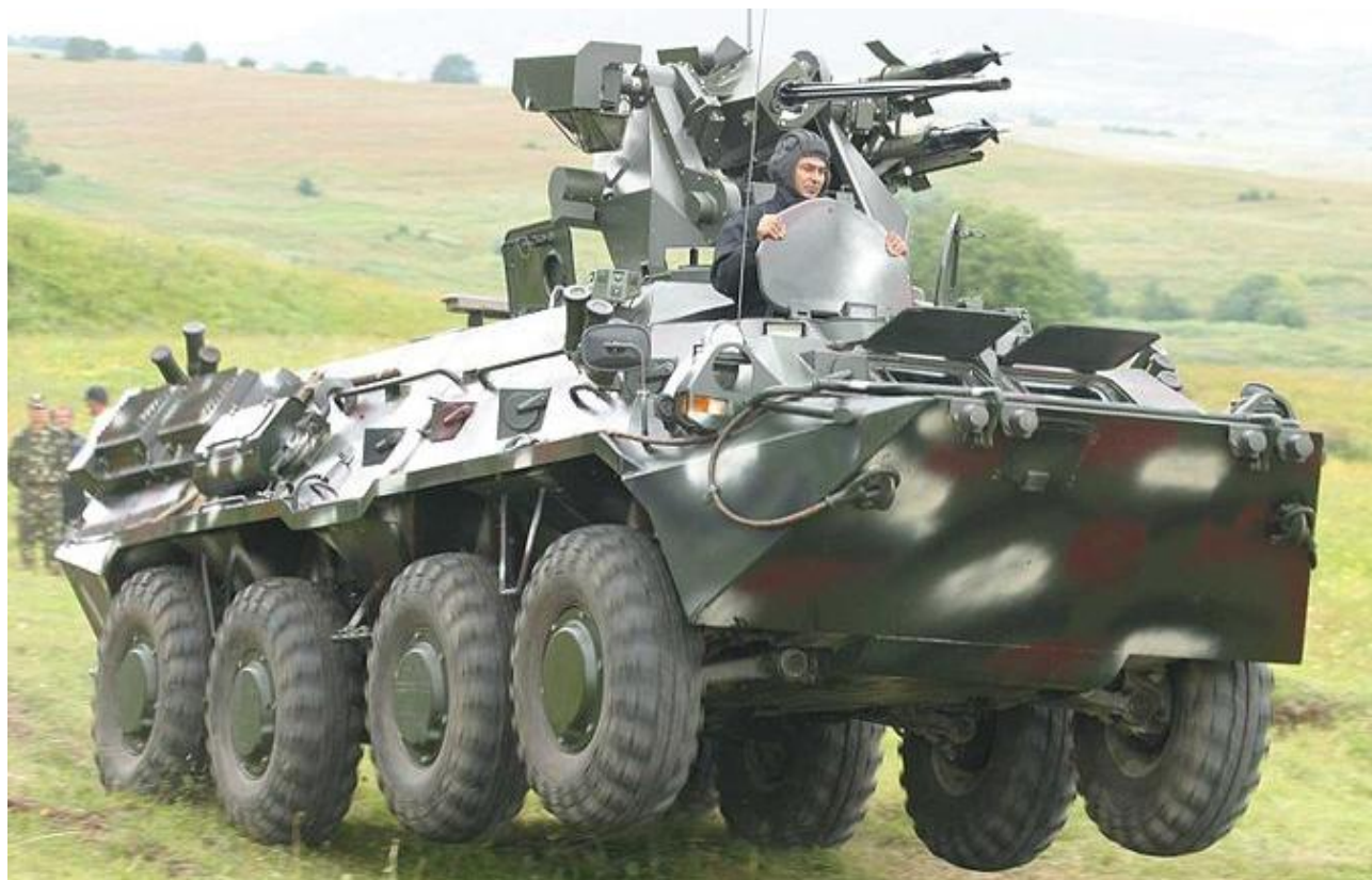
Figure 60. Zimbru 2000 prototype