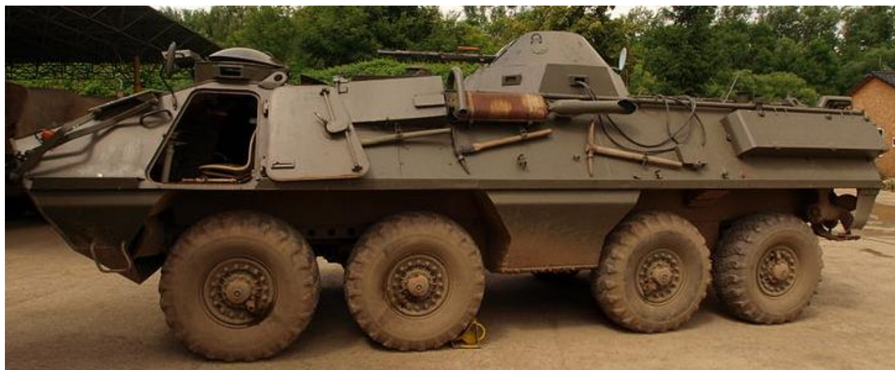
Figure 65. OT-64A