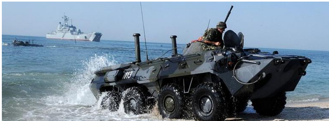
Figure 47. BTR-3U conducts an amphibious landing on Tendra Island, Ukraine

engine. Produced by the Ukraine and called the Guardian, the BTR-3U can travel 85 km/h on roads and swim 8 km/h across water obstacles. A crew of three—commander, driver, and gunner—operate the vehicle, while six soldiers are available for dismounted operations. This is the version used by the UAE Marine forces and features a Buran-N1 turret system. The Ukraine has exported 24 of these vehicles that feature a Buran-N1 turret system to the United Arab Emirates for use by their Marines. 128