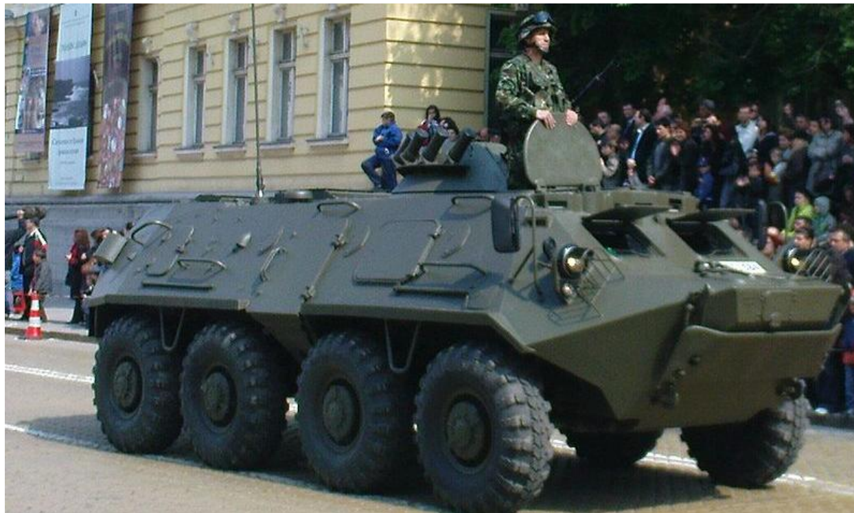
Figure 33. Bulgarian BTR-60PB-MD1 in Sofia Army Day parade