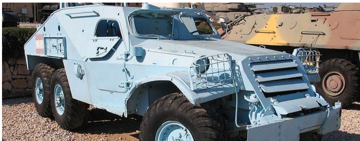
Figure 11. BTR-152V1 converted to an ARV at the Yad la-Shiryon Museum in Israel

The BTR-152V is a 1955 production model with an open top and an external CTPRS system. The CTPRS allows the operator to reduce the tire pressure to increase the contact area when the vehicle crosses soft ground such as snow or mud. The CTPRS also allows the vehicle to escape the kill zone if any of its tires are hit as the system slows the loss of air pressure. The Soviet Union produced 2904 BTR-152Vs between October 1955 and 1959. 22