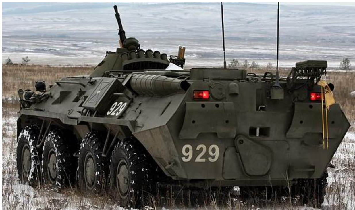
Figure 54. Russian RkhM-4-01 on maneuvers

The RkhM-401 variant is the RkhM-4 with more modern NBC detection equipment than its predecessor. It carries markers that can be used to designate a safe path for follow-on vehicles. 168