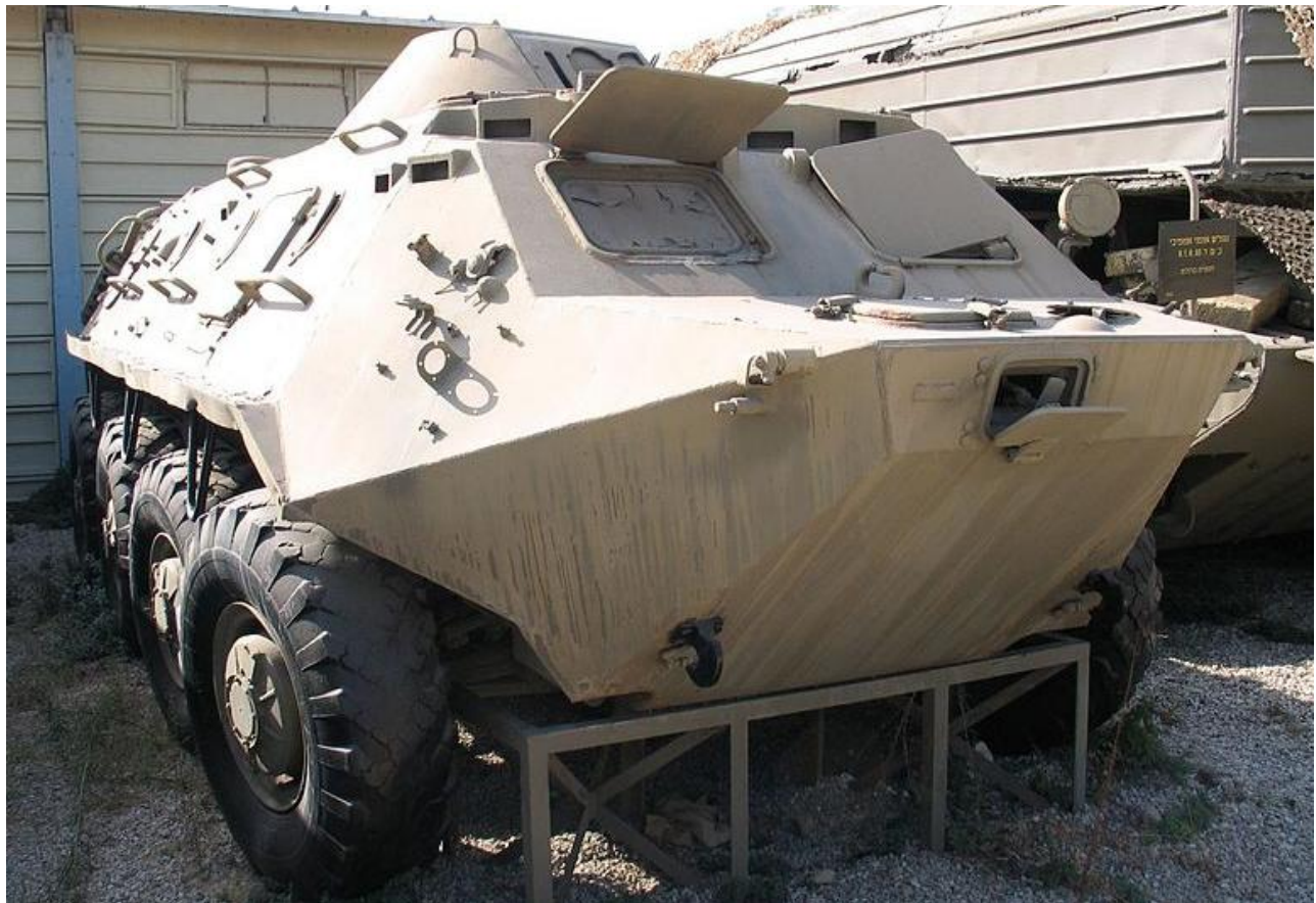
Figure 26. BTR-60 in the Batey ha-Osef Museum in Israel

While the BTR-60 features thicker armor than its predecessors, the BTR-60 is still vulnerable to damage from high explosive (HE) fragmentation ammunition and small arms fire. The tires are also susceptible to punctures from indirect and direct fire weapons. Equipment on the outside of the vehicle such as antennas and auxiliary fuel tanks can also be damaged by field artillery fire. 55