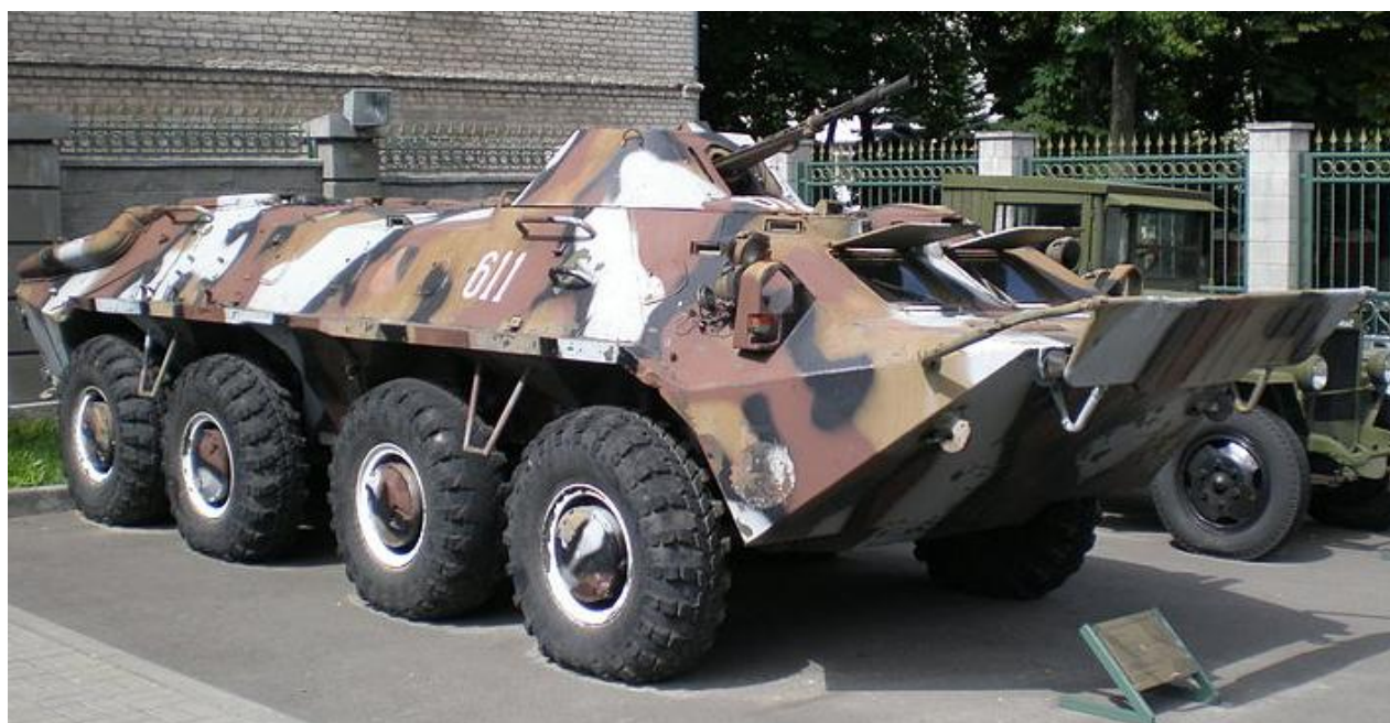
Figure 36. BTR-70 at museum in Belarus

The main weapon system in the turret on the standard BTR-70 is a 14.5-mm KPV machine gun with a basic load of 500 rounds on board. There is also a coaxial 7.62-mm PKT machine with 2,000 rounds, also in the turret. There is also space for two RPG-7 (rocket propelled grenade) launchers and two 30-mm AGS-17 (automatic grenade launcher) portable grenade launchers. Firing ports on both sides of the vehicle allow the soldiers inside the APC to fire their personal weapons. 90