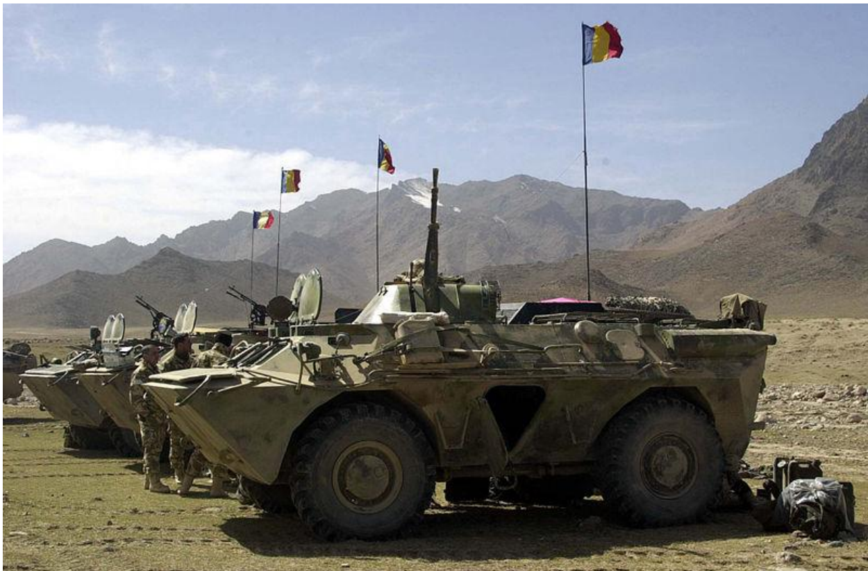
Figure 41. Romanian TABC-79s in Afghanistan

The Romanians made some of their BTR-70s 4x4 drive instead of 8x8 and designated them as TABC-79s. 115