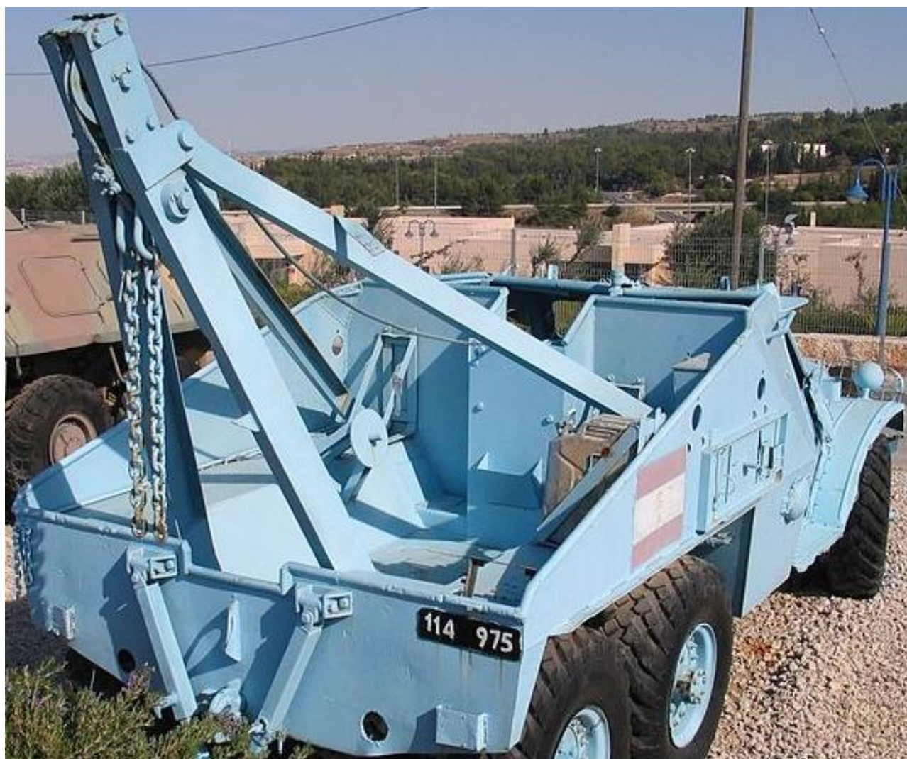
Figure 12. BTR-152V1 captured by the Israelis from the South Lebanon Army

The BTR-152V1 is a 1962 production model, also known as the Model B that includes a 5,000 kg winch on the vehicle's front bumper, an integrated infrared night vision TVN-2 system, cabin heating, windshield defroster, and a CTPRS system with internal air lines that make it less susceptible to damage from enemy fire. Some versions were modified to use as a wrecker with a rear hoist such as the BTR-152V1 pictured. The Soviet Union only made 611 of these variants between October 1958 and December 1959. The Soviet MVD (Ministry of Interior) and border guards received 556 of the BTR-152V1s produced. 23