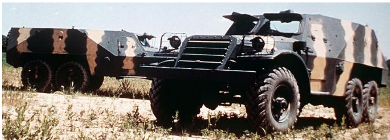
Figure 13. Two Soviet-built BTR-152V2s

The BTR-152V2 is essentially the same production model as the BTR-152V1, but without the winch on the front bumper. 24