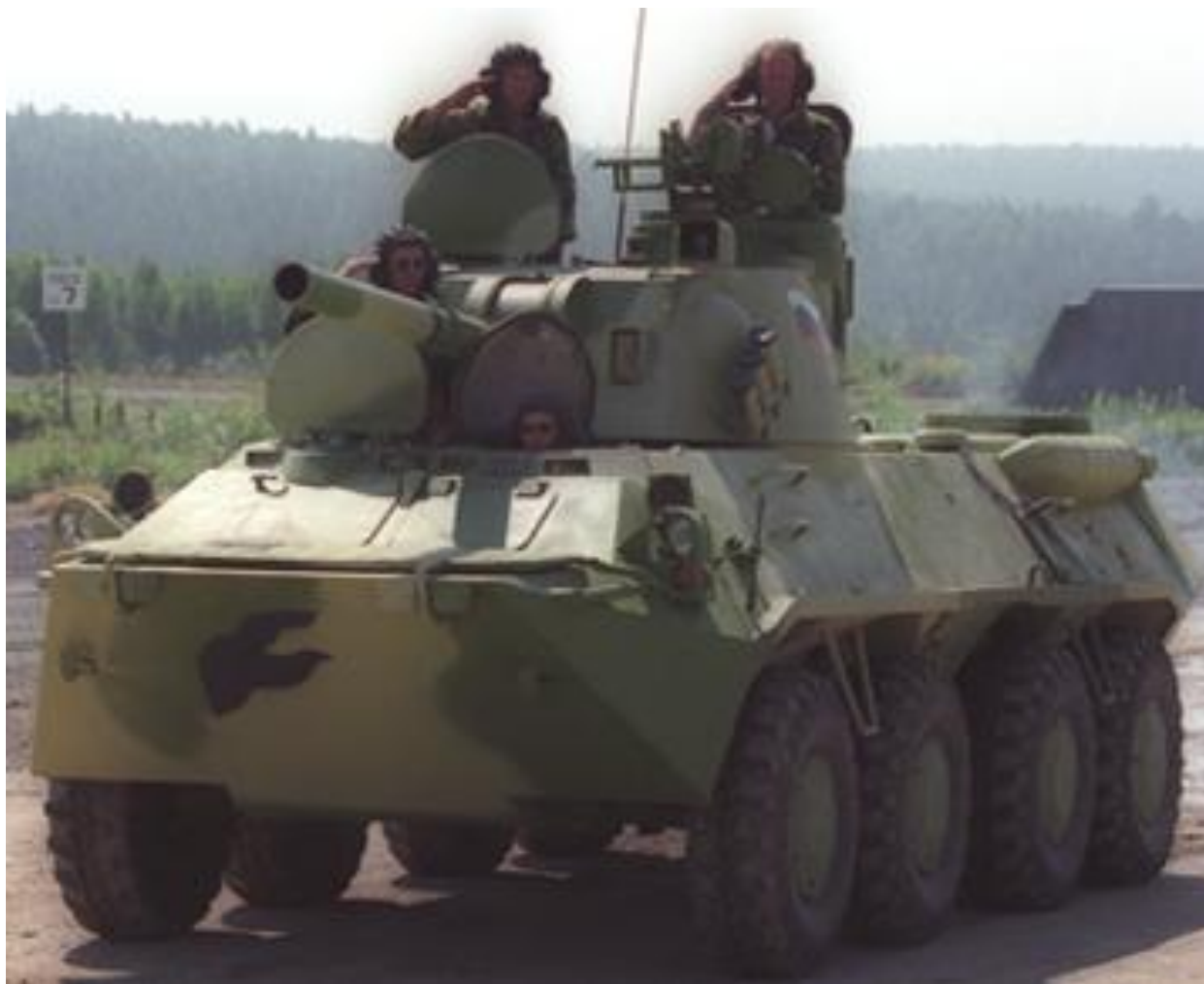
Figure 44. 2S23 at the Second Ural Expo Arms

The standard weapon system is a turret equipped with a 14.5-mm PKVT machine gun with 500 rounds and a coaxial 7.62-mm PKT machine gun with 2,000 rounds. The major change in the turret design allows the guns to fire at a higher angle, a design flaw on the BTR-60s and BTR-70s that the Soviets discovered the hard way in the Afghanistan mountains. There are seven pivoted firing ports on the BTR-80, four on the right and three on the left, permitting all seven soldiers to fire their personal weapons from inside the vehicle. Two of the side firing ports are designed for the 7.62 PK general purpose machine guns while the others are fitted for the AKMS or AK-74 individual machine guns. There is also space inside the vehicle to carry two man-portable surface-to-air missiles (SAM), usually the SA-14 (Gremlin), SA-16 (Gimlet), or SA-18 (Grouse). The BTR-80 also carries six smoke dischargers on the rear of the vehicle for obscuration purposes. 122