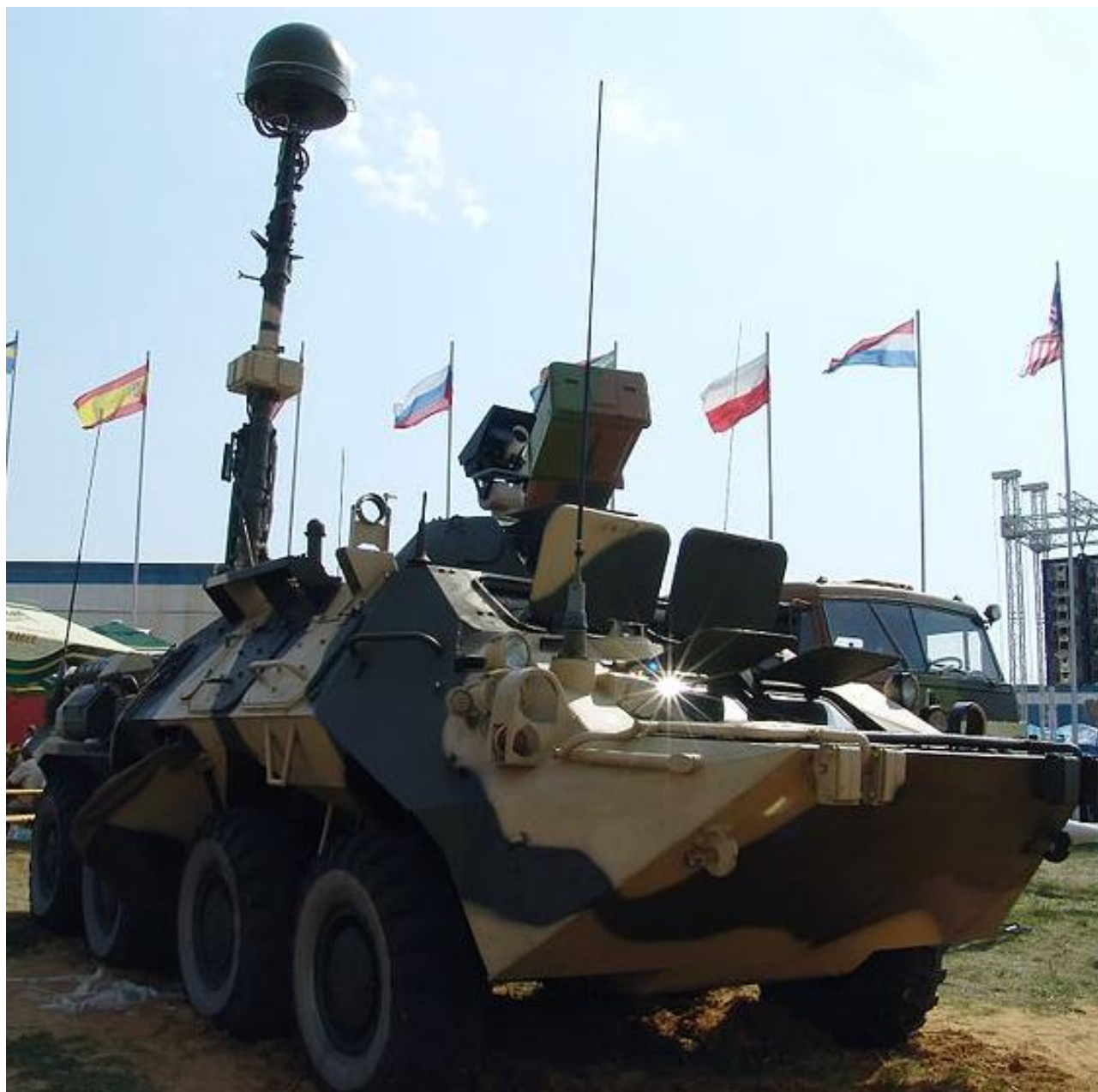
Figure 53. PU-12M7 at the MAKS 2007 air show near Moscow, Russia

The PU-12M7 is an improved version of the PU-12M6 for artillery batteries. 162