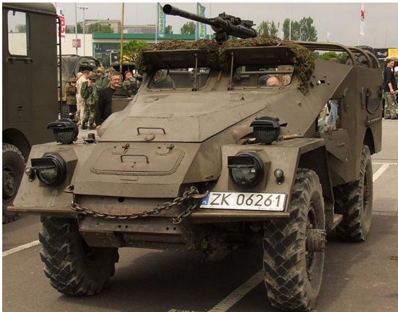
Figure 2. BTR-40