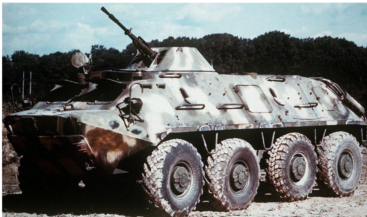
Figure 31. Former Soviet BTR-60PB with the 14.5-mm KPV machine gun

In the second major modification of the BTR-60, the Soviets added the turret originally made for the BRDM-2 that carries two different calibers of machine guns—the 14.5-mm and a 7.62-mm coaxially-mounted machine gun along with a periscope sight in the turret roof. There is also a 12.7mm machine gun location in front of the gunner’s hatch. There is also space for the passengers to mount two 7.62-mm machine guns are either side of the forward hatch. Due to the turret configuration, the BTR-60PB can only carry eight troops for dismounted operations instead of the 12 soldiers accommodated by some of the previous BTR-60 designs. 65