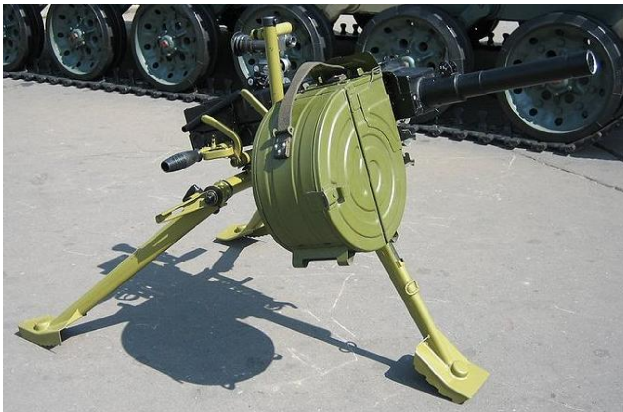
Figure 37. Dismounted AGS-17 Automatic Grenade Launcher