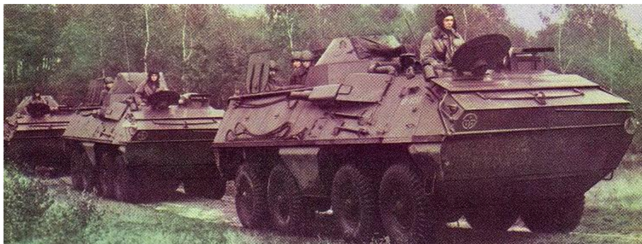
Figure 68. OT-64C(1) on maneuvers