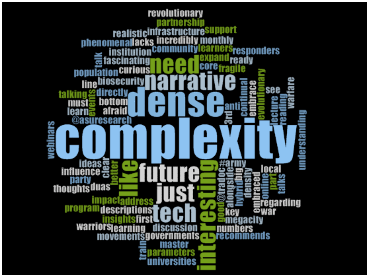
Figure 17: 100 Most Frequent terms from Twitter (#madsci16) discussion.