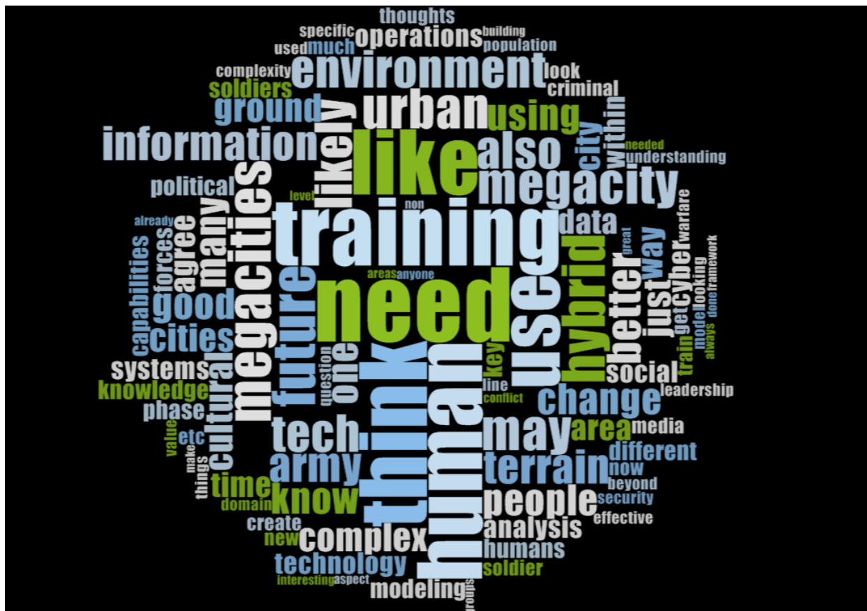
Figure 11: 100 most frequent terms from the Megacities and Dense Urban Areas Conference chat room and Twitter discussions.

The Megacities and Dense Urban Areas Conference also included over 500 individuals participating virtually through web streaming, a chat room, and Twitter: #madsci16. Chat room and Twitter discussions were captured and an initial analysis of this data was conducted using a qualitative data analysis tool to identify the 100 most frequent terms used by participants for insight into predominant discussion topics. Based on this analysis, as visualized in the word cloud below, “training”, “human”, “hybrid”, “change”, “cultural”, “tech”, and “terrain” are among some of the more frequently used terms (See Appendix 4 for separate word clouds for the chat room and Twitter discussions)