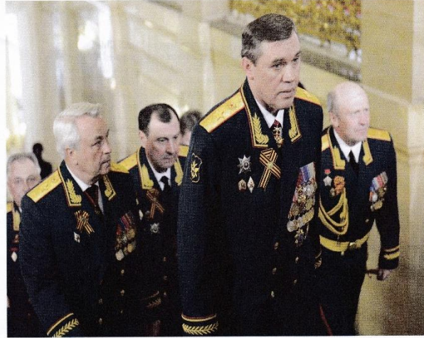
General of the Army Valery Gerasimov (front), chief of the General Staff of the Russian Armed Forces and Russia's first deputy defense minister, and Nikolai Pankov (left), Russian deputy defense minister, attend a reception 9 May 2015 marking the seventieth anniversary of the victory over Nazi Germany in the Great Patriotic War of 1941–1945 at the Kremlin in Moscow.