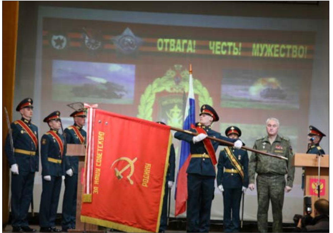
Presentation of colors ceremony for the 18th Motorized Rifle Division.