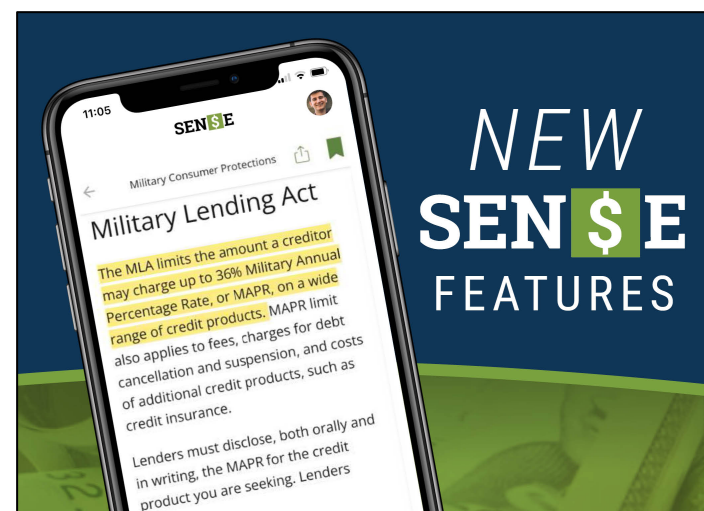
Alt text: New Sen$e features on the app