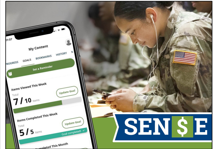
Alt text: Service member looking at the Sen$e app on mobile device