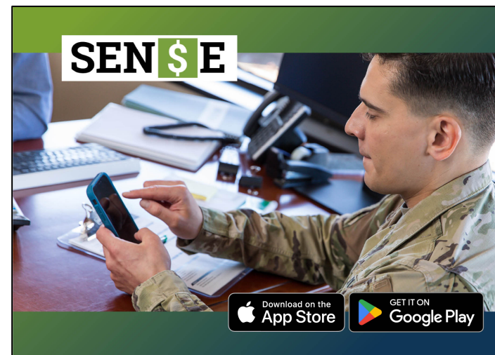
Alt text: Service member looking at mobile device