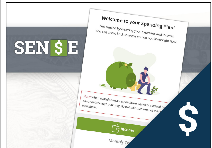
Alt text: Spending plan tool screenshot

Better than ever! New look. New features. Same trusted source of personal financial readiness content. Get the new Sen$e app today!