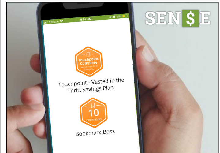
Alt text: Badges on the Sen$e app on mobile device

[Link to: Apple Store or Google Play or https://finred.usalearning.gov/ToolsAndAddRes/Sen$e ]