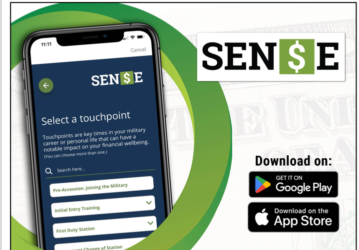
Alt text: Mobile device screen showing Sen$e touchpoints

Who said personal finance apps can't be fun? Grow your financial knowledge by spending a few minutes each day unlocking time and touchpoint badges in Sen$e. Start earning yours today!