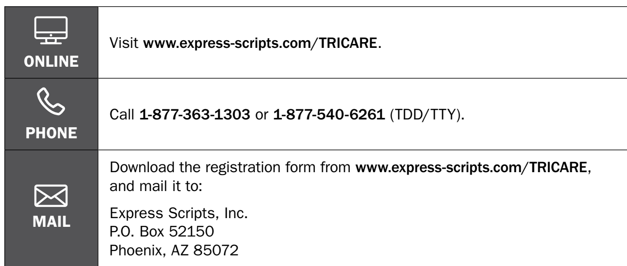
Figure 4.1 TRICARE Pharmacy Home Delivery Registration Methods

When visiting non-network pharmacies, you pay the full price of your medication upfront and file a claim to get money back. Claims are subject to deductibles, out-of-network cost-shares and TRICARE-required copayments. All deductibles must be met before you can get money back. For details about filing a claim, see the Claims section of this handbook.