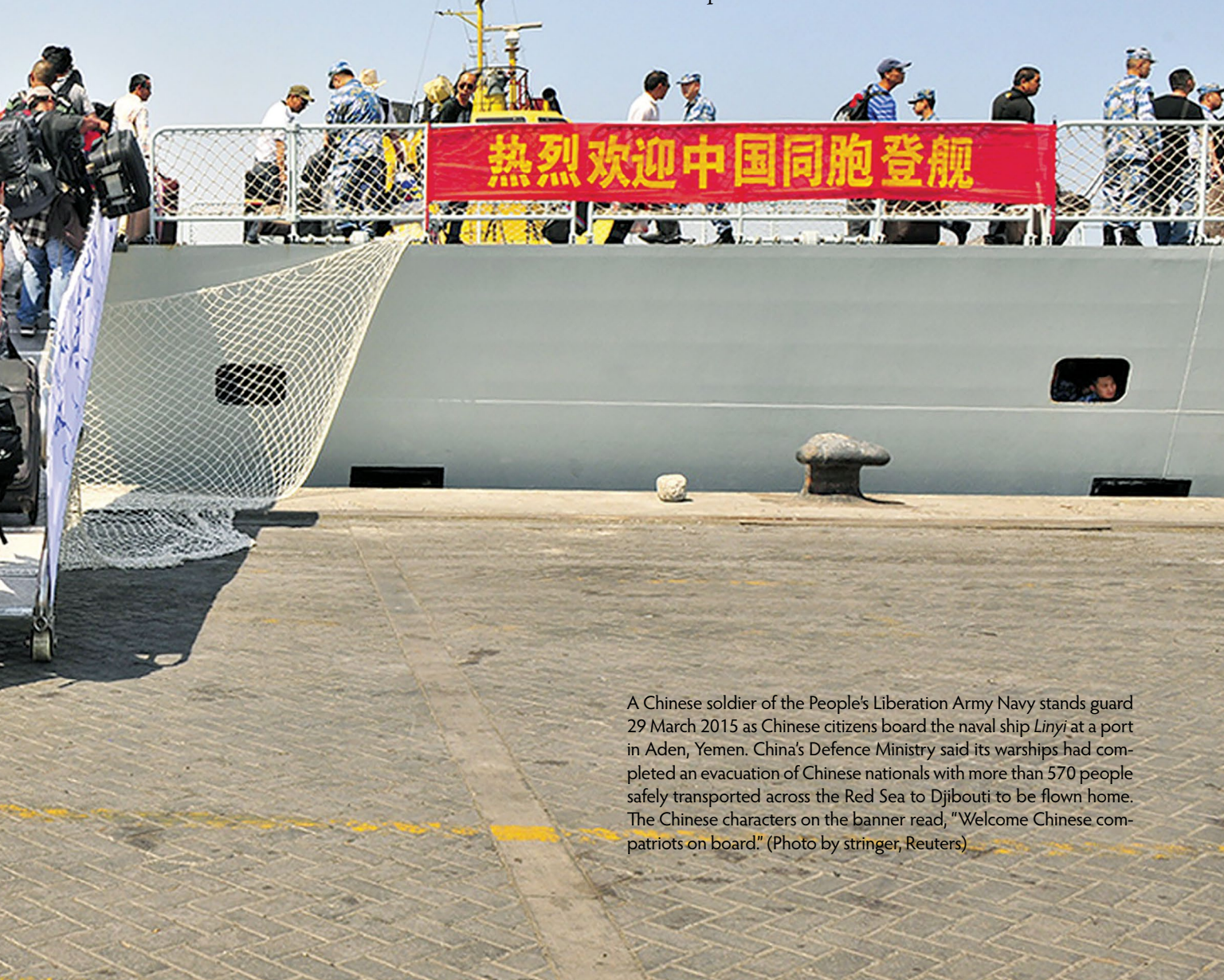
A Chinese soldier of the People's Liberation Army Navy stands guard 29 March 2015 as Chinese citizens board the naval ship Linyi at a port in Aden, Yemen. China's Defence Ministry said its warships had completed an evacuation of Chinese nationals with more than 570 people safely transported across the Red Sea to Djibouti to be flown home. The Chinese characters on the banner read, "Welcome Chinese compatriots on board."

While the efforts of embassy personnel to facilitate the evacuation of Chinese nationals and foreign citizens from dangerous situations are not surprising, the more recent commitment of military resources is. These are signs of a new trend, one of increased military intervention and an extended overseas military presence in the years to come. This article provides some possible insights into China's perception of its transitioning role and what we might expect in the future based on its involvement in overseas evacuations over the past several decades.