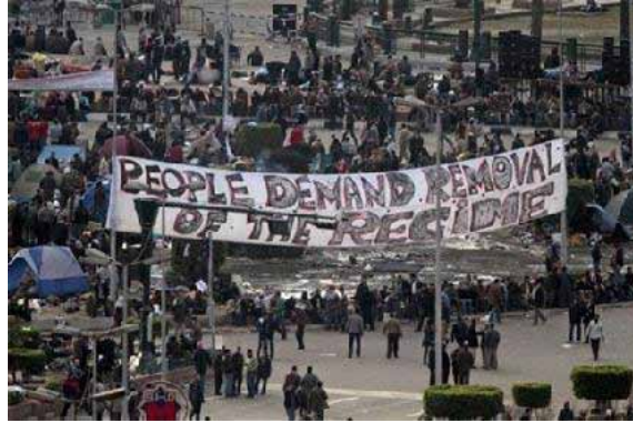
Image 3 “People demand the removal of the regime” in Tahrir Square, Egypt 19

Protesters turned to social media and sharing services to make their actions known. In Tunisia, Egypt, Yemen, and Libya demonstrations, violence, and disorder have led to successful regime change. In other countries, in particular Syria, the regime continues to dispose of the opposition by increasingly violent means. Despite the heavy loss of life the Arab Spring revolutions continue to draw global attention, and the efforts of protesters are repeatedly uploaded to YouTube, Tweeted about, or “Liked” on Facebook. The Arab uprisings and revolutions have also inspired other movements, such as the Belarusian ‘silent’ protests and the Russian ‘Evolution’.