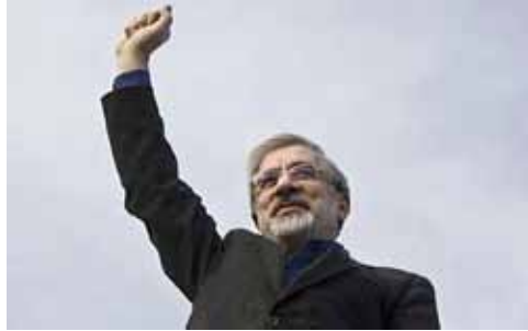
Image 2 Mir-Hossein Mousavi, Iranian Reformist Candidate, 2009 18

Iranian Twitter activity seemed to show ubiquitous support for the protests; foreign observers overlooked the fact that much of the activity was conducted in English or languages other than Farsi. Observers simply latched on to the flurry of activity found via Twitter's convenient hash tags and trending topics. While the West began to laud the power of social media, the Iranian government turned to the very same networks as a tool for prosecuting citizens they were able to identify in pictures, video, or tags by location in the social media updates, or from text messages or phone calls made by demonstrators themselves. The political power of technology cuts both ways: it allows the development of political sentiment while granting the authorities easy access to information that can be used to deter or combat potential competition.