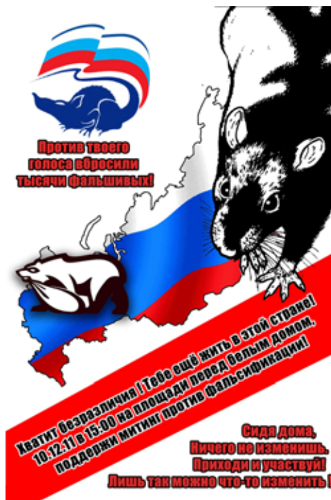
Image 5 Flyer from the city of Vladimir calling citizens to a meeting against voting falsifications 40

How strong is the impulse for sweeping change and the evolution of civic society in Russia today? When protests broke out after the disputed results of the December 4, 2011 parliamentary elections in the Russian Federation, resulting in as many as 100,000 citizens filling the streets of Moscow, 39 the impulse for change appeared high. Protesters demanded a new round of “cleaner” elections, and spoke out against the “party of crooks and thieves” (Image 5).