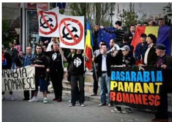
Image 1 Anti-government and anti-communist protesters in Chisinau, Moldova.