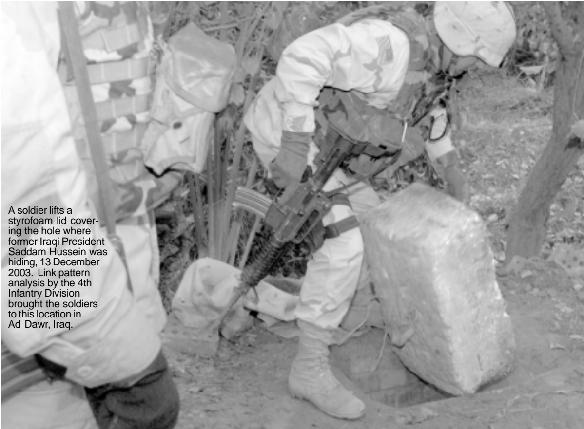
A soldier lifts a styrofoam lid covering the hole where former Iraqi President Saddam Hussein was hiding, 13 December 2003. Link pattern analysis by the 4th Infantry Division brought the soldiers to this location in Ad Dawr, Iraq.

intelligence personnel who did the link-pattern analysis did it the tedious, old-fashioned way, using pads of butcher-board paper, yellow stickies, and a large wall chart. 7 Some dedicated intelligence personnel did a brilliant job, but time and energy could have been greatly reduced with current software applications and computerized databases.