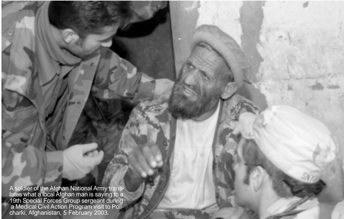
A soldier of the Afghan National Army translates what a local Afghan man is saying to a 19th Special Forces Group sergeant during a Medical Civil Action Program visit to Policharki, Afghanistan, 5 February 2003.

lators are unaware of the nuances of the English language, so “request” might become “demand.” Honest translations are critical.