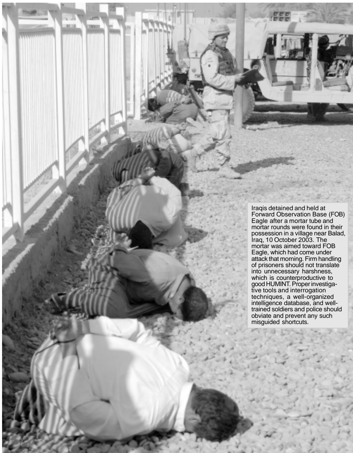
Iraqis detained and held at Forward Observation Base (FOB) Eagle after a mortar tube and mortar rounds were found in their possession in a village near Balad, Iraq, 10 October 2003. The mortar was aimed toward FOB Eagle, which had come under attack that morning. Firm handling of prisoners should not translate into unnecessary harshness, which is counterproductive to good HUMINT. Proper investigative tools and interrogation techniques, a well-organized intelligence database, and well-trained soldiers and police should obviate and prevent any such misguided shortcuts.

confidentially contact the unit for a lengthy debriefing.