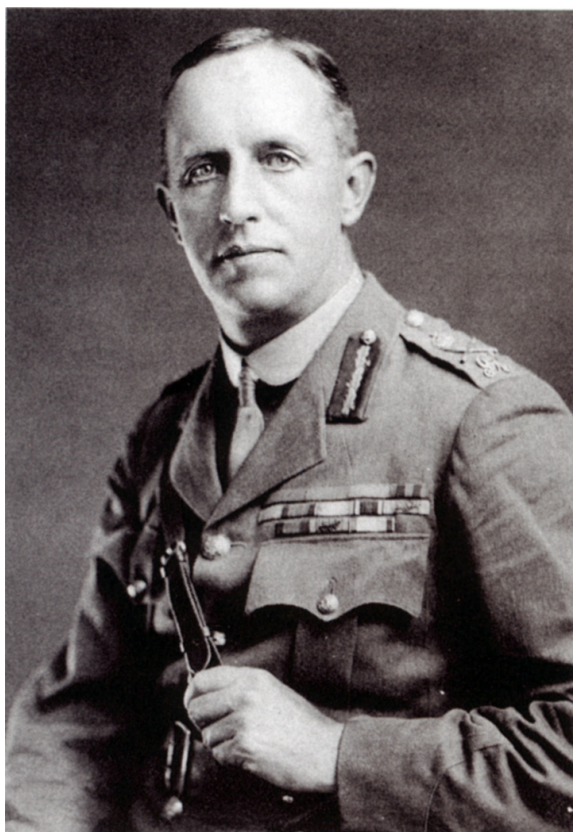
General Sir Andrew Skeen (National Portrait Gallery, 1923)