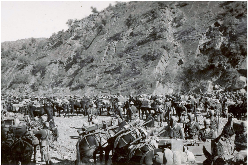
Pack mules ready to march with 48th Regiment (Sgt Partridge)