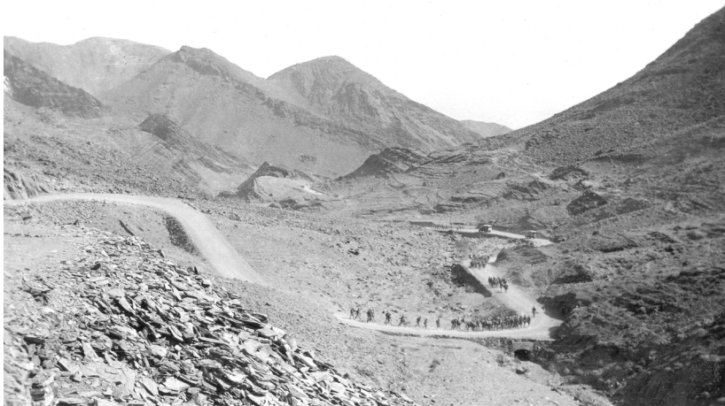
Main body of 48th Regiment moving to Razmak