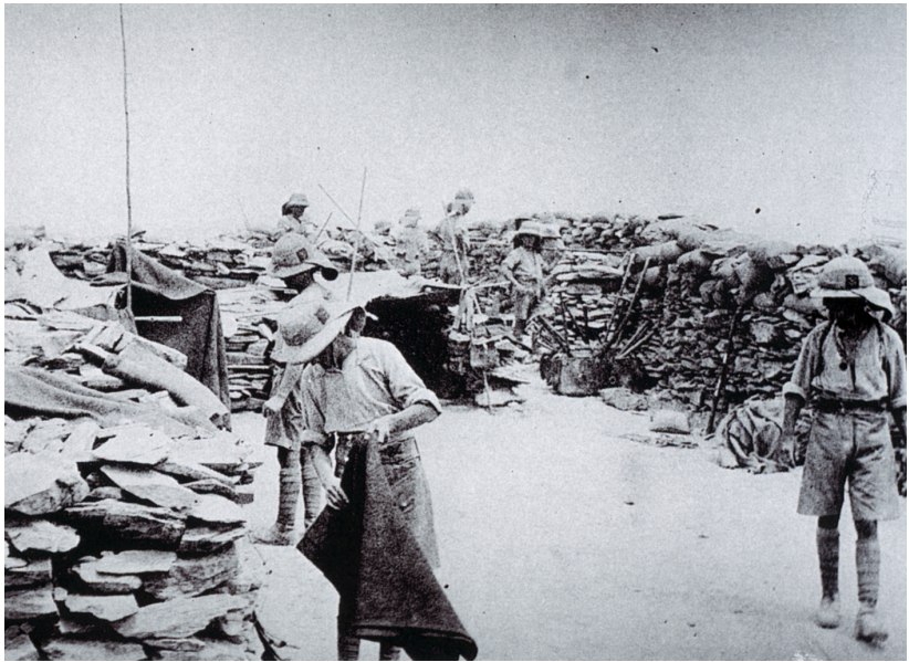
Interior of sanger occupied by picquet (NAM 60338)