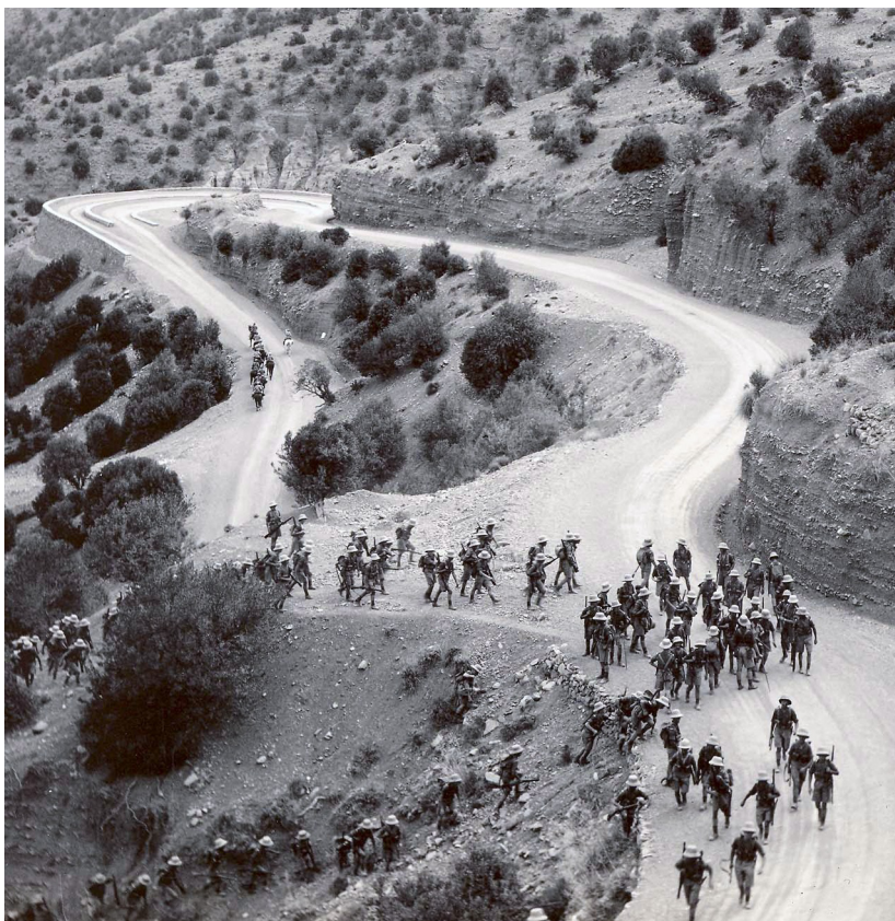
48th Regiment takes a short cut