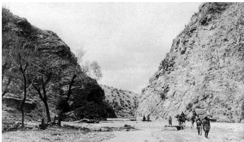
Dominating terrain for a march column (NAM 98080)