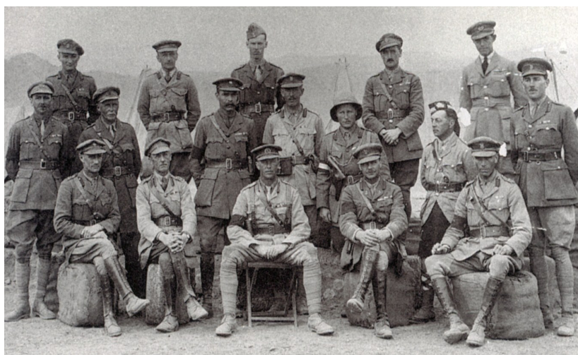
General Skeen and his staff, Third Anglo-Afghan War, 1919