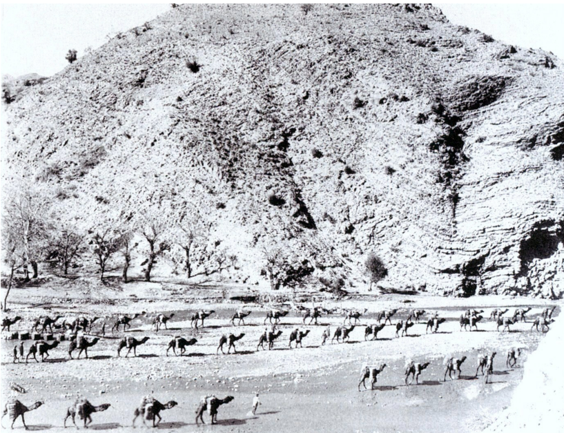
Camels and their handlers in march columns (NAM 99810)