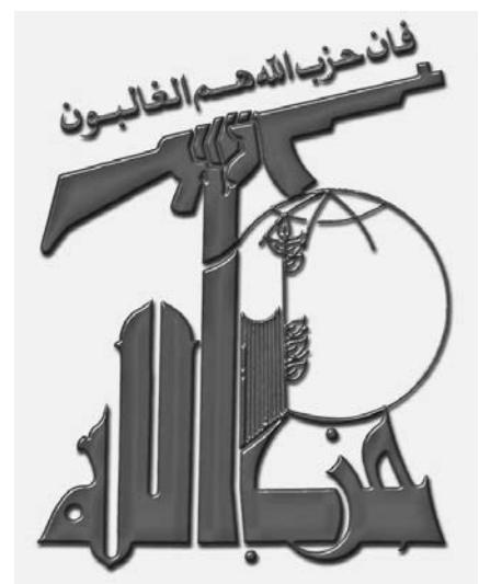
Hizballah symbol. (Terrorist Knowledge Base.org)

The loudspeaker has also been technologically updated in ways never imagined. The days of shouting at one another over cease fire lines or to encourage one side to surrender still exist, but these have been supplemented by the silent loudspeaker—the text message. Text and voice mail messages on mobile phones warned residents of Tyre in southern Lebanon to leave or risk being killed. This means the message is precision guided, just like high-tech weaponry. Coalition forces reportedly used the same method before their March 2003 advance into Iraq. Their aim was to change the attitudes and behavior of Iraqi commanders by enticing them to defect or simply to go home and not