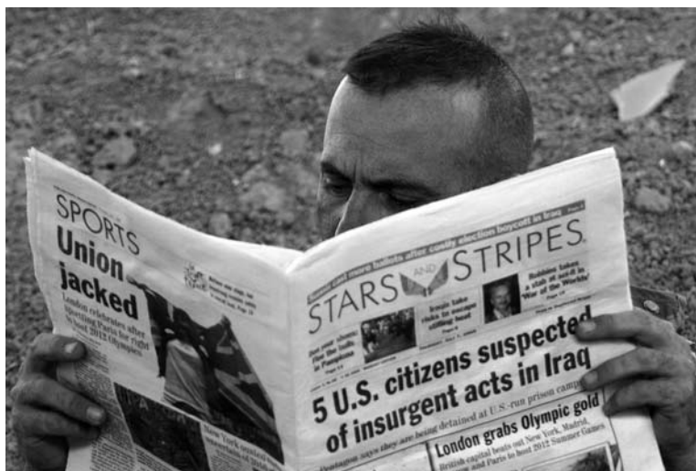
Traditional media delivery.

Analyst Ben Venske notes jihadi videos are another terrorist favorite. They are used for several specific purposes instead of the “organized bazaar” represented by YouTube. These are: as instructional material, to make