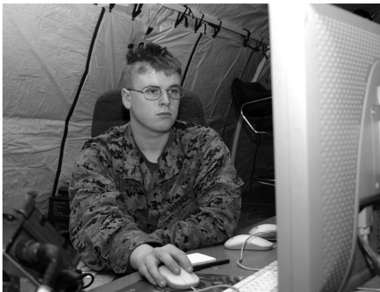
Young and blog-savvy: the face of the CYOP generation.

Teenagers, those most intimate with cyber technology, will be as affected—if not more so—than their elders in a cyber environment. Middle aged and senior citizens, more skeptical and analytical based on a lifetime of exposure and familiarity with deceptive techniques, will still require the more immature but technologically advanced teenager to interpret meanings and impacts—much like a translator. Cyber language and techniques are confusing and a difficult medium in which to stay current. For example, teenagers cruise through blogs and sites like Zone-H, Digg This (or just Digg), Little Green Footballs, MySpace, FaceBook, and technorati with abandon. Such sites provide a very different