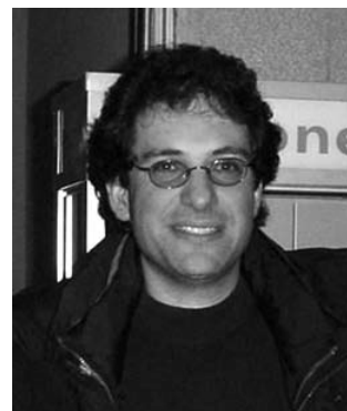
Kevin Mitnick, Noted Social Engineer.