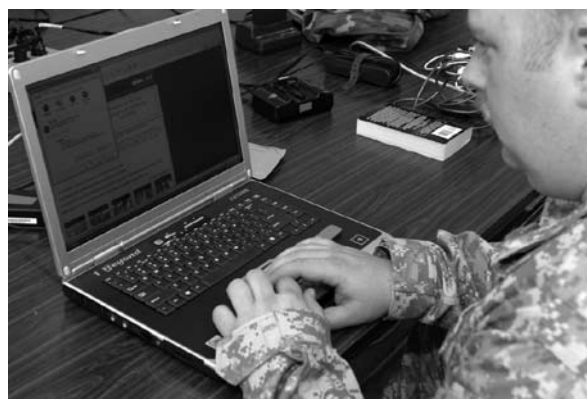
Practicing cyberskepticism.

Mitnick noted that firewalls and biodetection systems are great ways to prevent hacking, but that training people to spot social engineering techniques is just as important. For example, one way to get information on cyber access codes is to call an unsuspecting person at a company and pose as an associate. This initial discussion will focus on troubleshooting a nonexistent network problem for the unsuspecting person. After pretending to have fixed the problem, Mitnick says the "associate" would ask for a favor, playing on a human tendency to reciprocate for a good deed. He notes this "causes people to take a mental shortcut, based not on the request, but the favor."