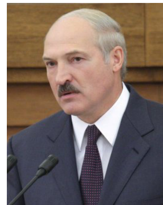
Belarusian President Alexander Lukashenka

However, the Russian scenario is also posing severe restrictions on Lukashenka, who no longer has the levers formerly at his disposal. The Nord Stream Pipeline is scheduled to become operational in 2011, and it is likely to satisfy up to 30 percent of Germany's gas needs, ending the transit monopoly of Belarus on Russian gas flows to the EU. In addition, Russia has officially allocated a subsidy of $4,124 million/year to Belarus, a decision made at the December 20 meeting of Russia-Belarus prime ministers in Moscow. Putin emphasized that this was merely an oil subsidy and signaled that there would be others. In reality, Russia's plans for Belarus entail the country's eventual partnership in a common economic zone, thereby making it impossible for Belarus to conduct any independent negotiations or make decisions favoring the EU. This plan foresees the integration of Belarusian state corporations – with their privatization anticipated – into the network of Russian industrial corporations. For example, a plan to integrate Belarusian dairy and meat industries into Russian holdings is also pending. Regardless of what Lukashenka says about sovereignty and independence, he will inevitably be constrained by these factors.