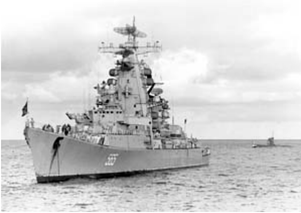
A Soviet Kresta-class cruiser rides at anchor in U.S. waters as an accompanying F-Type submarine approaches from the stern.

As noted, among the many reasons that the Soviets studied and evaluated TVDs was to help them develop individual targets and target complexes whose destruction or disruption would contribute to the successful prosecution of military operations. For all TVDs, Soviet planners classified targets based on their importance to overall strategic objectives; the threat these targets posed to the Soviet Union and its allies; the vulnerability of targets in terms of hardness and mobility; and the priority in which such targets should be attacked. 9 Targets were grouped by category, the importance of which varied from one TVD to another, and by operational circumstances such as operations with or without the use of nuclear weapons. Among the five basic categories of enemy resources usually considered was one of growing importance: "war-supporting military-economic-political infrastructure." 10