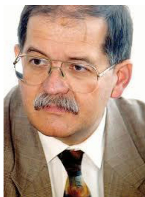
Darko Tanasković © 2011 Ministry of Foreign Affairs of Serbi, via http://ankara.mfa.rs/

For Serbs, meanwhile, Bosniak reconnection with Turkish customs and beliefs may imply the Bosniaks' wish for a return of the Ottoman Empire and intensify already existing nationalist tendencies. To be sure, Turkey and Serbia cooperate on a range of issues that reach from economic investments 37 to Turkish mediation of Serbia's fractured Islamic Community. 38 Yet one will quickly find aversions toward Turkey, specifically the Ottoman past, when following