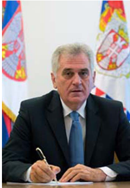
President of Serbia Tomislav Nikolić

To be sure, Tadić, in a recent rally in Novi Pazar, asserted that he will make sure to bring investors to the region and pledged that all peoples, cultures and languages ought to have their place in Serbia. 24 This means that politicians are aware of the difficulties Sandžak's population faces. Tomislav Nikolić and Čedomir Jovanović too spent time in Sandžak to persuade Bosniaks of a new and better future under their leadership should they be chosen to lead Serbia. Yet, it automatically brings up questions about the sincerity of Tadić's (and other politicians') promises. First, why did the Belgrade leadership not bring investment to the region earlier, and second, will his promise outlast the presidential campaign? A cynic might say that it will not. Serbia has thus far failed to improve interethnic relations and regional living standards and get away from ethnocentric politics.