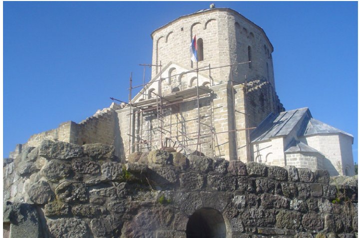
Đurđevi stupovi, Orthodox Church dedicated to Saint George, in the ancient city of Ras in Serbia. Built during the 12th-century by the Serbian King Stefan Nemanja.

Southeastern Europe lies at a crossroad between the western and eastern hemispheres, where diverging religious identification draws a fault line between Croats, Bosniaks and Serbs; or