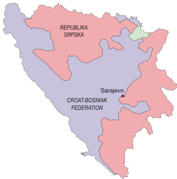
Map of Bosnia and Herzegovina (BiH) by Aaron Perez (Own Work) [CC-BY-SA-3.0], based on political boundaries from www.gadm.org

in purple; Brčko district is marked green).