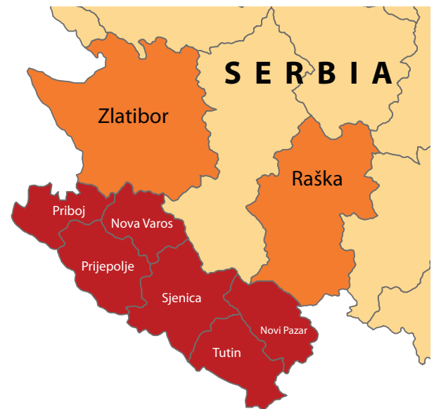
Map of Serbia Sandzak region by Aaron Perez (Own Work) [CC-BY-SA-3.0], based on political boundaries from www.gadm.org

Under the domination of the Austro-Hungarian and Ottoman empires ethnic identity was visible in two broad layers: one common layer under which Slavs sought to expel the common occupier; and an individual layer, which encapsulated their own,— Bosniak, Serb, Croat etc. — ethnic identities. In the process, cultural traditions, religious practices and language influenced these peoples' national self-consciousness. 7 Self-awareness, in turn, shaped people's identities for the duration of the Ottoman and Austrian Empires, while socialism perhaps froze these perceptions in time, or at least kept them simmering under the surface. As in other post-socialist societies, notions of self that found expression in values, beliefs and attitudes led to the dissolution of a common Yugoslav identity and the destruction of the country, most notably during the war in Bosnia and Herzegovina (BiH). This process is continuing to this day.