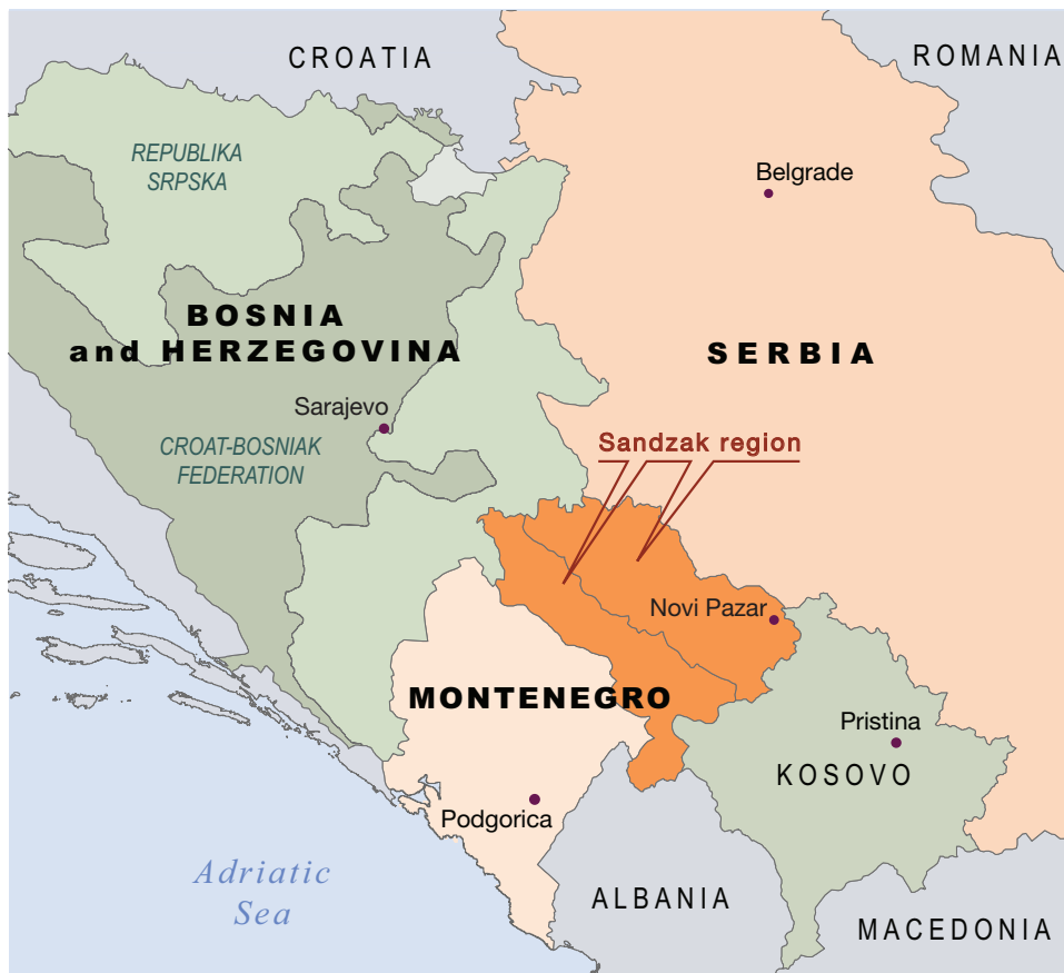
Map of Sandzak region by Aaron Perez (Own Work) [CC-BY-SA-3.0]based on political boundaries from www.gadm.org

Catholicism, Islam and Orthodoxy respectively. By the 15th century, Southeastern Europe was fully incorporated into the Ottoman Empire, at which time a considerable number of Bosnians converted to Islam. Why and how this conversion transpired in large numbers, mostly among Bosniaks 1 , is yet a subject of debate. 2 Under the auspices of the Serbian Orthodox Church, Serbs practiced their traditions within the parameters of the millet system. 3 Within the parameters of the millet system, each religious community was able to practice their own traditions. The millet system served as a structure that organized the relationship between the religious community and