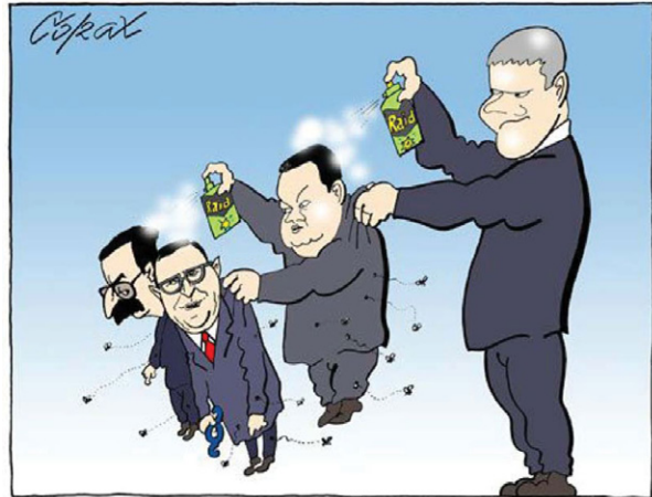
Ivica Dačić, Serbia's Minister for the Interior held by Serbian President Boris Tadić. Political cartoon by Corax via http://www.danas.rs/danasrs/corax.22.html

Despite all the nationalist rhetoric, the 1990s war in former Yugoslavia was not of ethnic or religious origin, but rather a conflict over land and political power that became an ethnic clash over time. 11 It is this conflict that continues today, in which recognition of the past plays a vital role. This is evident in the Muslim enclave of Sandžak, as well as in BiH. Sandžak thus serves as a mirror that can illustrate the greater picture relating to relations between BiH and Serbia.