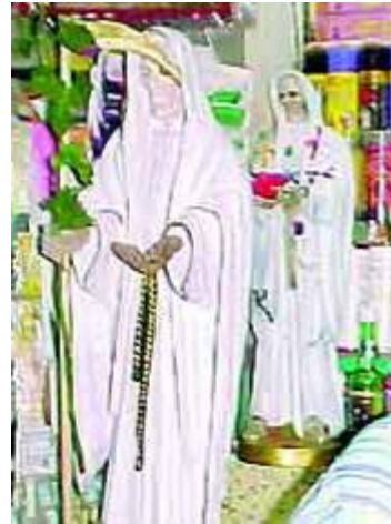
Figure 6 Statues of Santa Muerte [31]