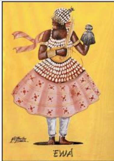
Figure 12 Yewa [51]