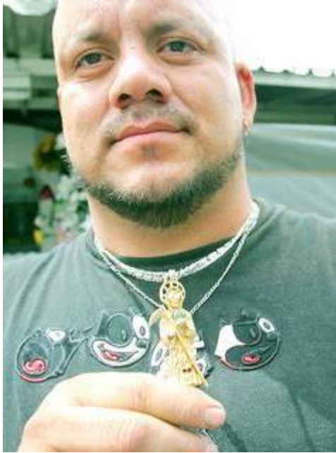
Figure 5 Santa Muerte devotee displays amulet [30]