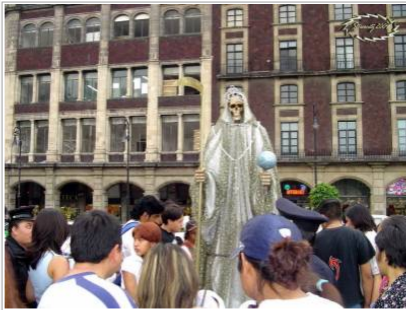
Figure 1 Santa Muerte in the Zocalo, Mexico City [3]

are directly affected by crime. Criminals seem to identify with Santa Muerte and call upon the saint for protection and power, even when committing crimes. They will adorn themselves with her paraphernalia and render her respect that they do not give to other spiritual entities.