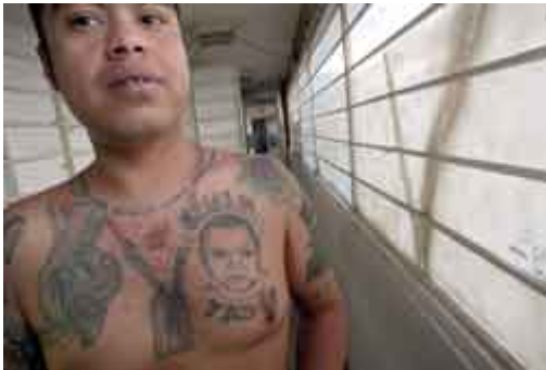
Figure 3 Imprisoned Cult Practitioner with Tattooed Santa Muerte and Tattooed Amulet [28]