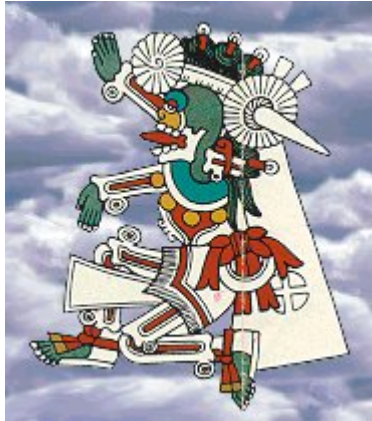
Figure 9 Mictlantecuhtli [44]