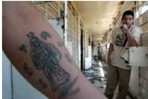
Figure 4 A Prisoner's Tattoo of Santa Muerte [29]