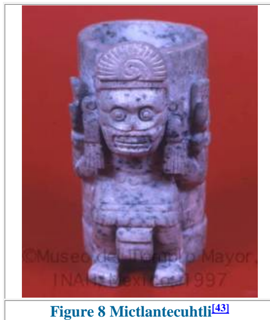
Figure 8 Mictlantecuhtli [43]

The origin of the Santa Muerte cult is as mysterious and controversial as the nature of the cult itself. Some devotees assert that the death cult has existed in Mexico for as many as three millennia, having been handed down from the progenitors of the Maya, Zapoteco, Totonaca, and other indigenous groups until it became widespread under the Mexicas and the Aztecs. [40] According to the theory, the figure now represented by Santa Muerte may actually be the legacy of Aztec devotions to Mictlantecuhtli and Mictecacihuatl, the god and goddess of death respectively, rulers of the shadowy underworld realm of Mictlán. They were traditionally portrayed as skeletons or persons with skeletal heads. Offerings to them included the skins of human sacrifices. [41] Both allegedly ate the dead. They were worshipped by those seeking the power of death. Their temple was located in the ancient ceremonial center of the city Tenochtitlan (modern Mexico City). The name of the district was Tlalxico. [42]