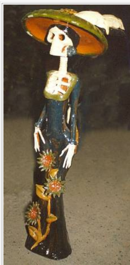
Figure 2 La Catrina Calavera [6]

The image of death is pervasive in many aspects of Mexican culture. Probably the most widely known manifestation of this is the feast of the Day of the Dead on the second of November, when Mexicans frequently parade skeletal images and render honors to their deceased loved ones. Another example is the image of the Catrina Calavera , a skeleton in a wedding dress that was popularized in the satirical works of the late nineteenth/early twentieth century artist José Guadalupe Posada. [5] Such customs can be easily misunderstood by outsiders; it might even be tempting to confuse the Santa Muerte with these other cultural traditions.