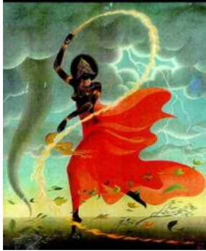
Figure 11 Oyá [50]