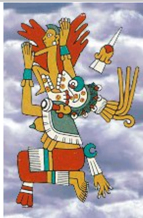
Figure 10 Mictecacíhuatl [45]

Another theory is that the cult came from Yoruba traditions, being handed down from African slaves brought to the Americas and transmitted to Mexico through, or parallel to, the Cuban tradition of Santería, the Brazilian tradition of Palo Mayombe, or the Haitian tradition of Voodoo. All of these practices are synchronistic traditions that emerged from the interaction between African animistic and polytheistic traditions with traditional saint-worship in Catholic Christianity. According to this theory, Santa Muerte is actually a variation of the Santería orishas (spiritual entities) Oyá, goddess of storms, and/or Yewá, goddess of the underworld, [46] who, according to Santería beliefs, brings bodies of the dead to Oyá. [47] She could also be a variation of Centella Endoki AKA Mama Wanga, ruler of cemeteries, who is a Palo Mayombe version of the Santería Oyá. Finally, the tradition could trace back to the Voodoo entity Maman Brigitte, who is also a counterpart to Oyá and Centella Endoki. [48] A third theory is that Santa Muerte appeared in a vision to a nineteenth century witchdoctor ( brujo chamán ) in the village of Orizaba, Veracruz and ordered the creation of the cult. [49]