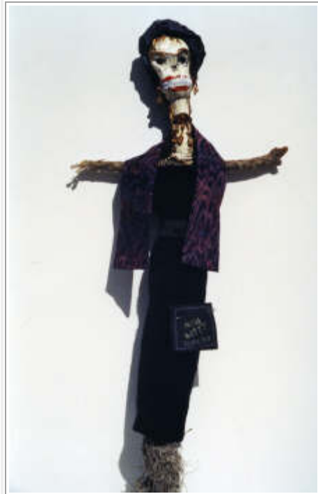
Figure 13 Maman Brigitte [52]