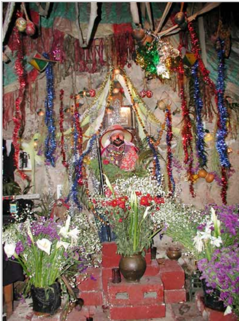
Figure 14 Shrine to Maximón [60]

seasonal association with Santa Muerte 's likely progenitor as well as a similarity in method of worship and followers with Santa Muerte herself.