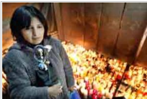
Figure 17 A Worshipper inside the Santa Muerte National Sanctuary [75]