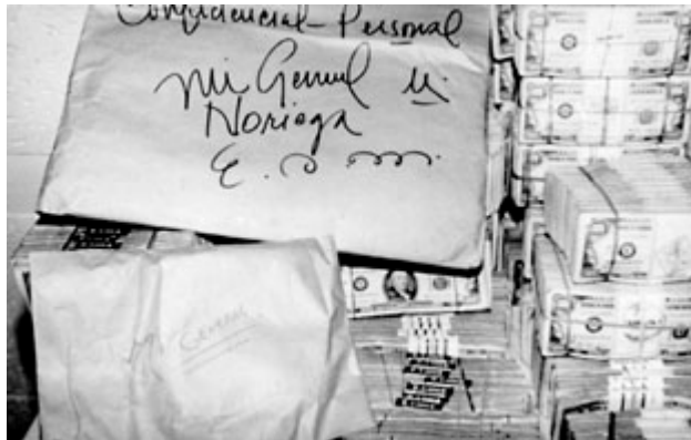
Bundles of cash found in the office of General Manuel Noriega during Operation Just Cause .

The country is one of the world's major drug