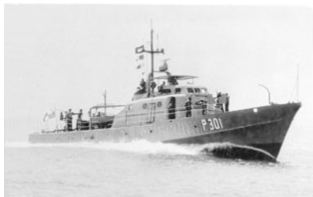
The Panamanian Vosper-type patrol craft Panquiaco .

Panamanians recognize the difficulty of defending the canal. It is vulnerable to a number of threats such as sinking a ship in the waterway, direct action by special operations forces using explosives against critical nodes, destruction of the watershed by unsound environmental practices and even a downturn in operational efficiency due to corruption or poor management. As a linear target stretching through waterways and jungle, the canal is nearly impossible to defend traditionally. Although reasonable measures can forestall or respond to terrorist actions, protection begins with a policy of neutral canal operations. Indeed, the Treaty Concerning the Permanent Neutrality and Operation of the