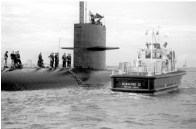
Marines of the US Security Detachment, Panama, stand by as Panama Canal personnel board the nuclear attack submarine Hawkbill during its transit through the canal, November 1999.

By the Neutrality Treaty , the United States is assigned the responsibility and right to "act against any aggression or threat directed against the canal or against the peaceful transit of vessels through the canal." 23 Hundreds of US warships, including submarines, transit the canal each year. Thus, SOUTHCOM war gamers have worked out processes by which any direct threat to high-value shipping or to the canal can be met with a United States-based joint task force operating in cooperation with Panamanian Public Forces (PPF). Officers of the PPF, particularly the Maritime Service, will participate in developing future contingency plans for defending the canal. 24