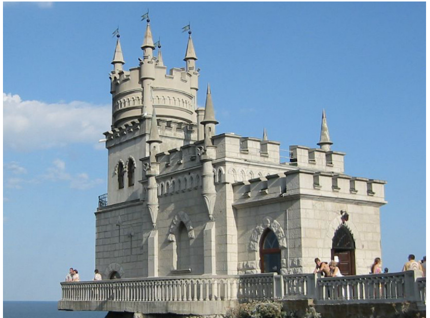
Swallow's Nest, one of the romantic castles of Neo-Gothic style near Yalta, Crimea; built in 1912 by the order of a German baron Stengel according to a project of a Russian architect A. Sherwood. The Swallow's Nest is a popular tourist destination in Crimea.

The Crimean peninsula is many things to many people. It is a homeland, a premier vacation destination, a key strategic location, an integral part of independent Ukraine, jewel in the crown of the Russian Empire, a site of ethnic cleansing, a major battlefield, and a monument of multiethnic harmony, to name only a few. Today, the Autonomous Republic of Crimea (ARC) is the only administrative region of Ukraine with an ethnic Russian majority and a sizable non-Slavic indigenous minority (roughly 12% of the population)—the Crimean Tatars. Throughout its history Crimea has always retained a special status, a separate identity comprised of many other identities. Paradoxically, both its specialness and separateness have been the source of and the means of avoiding conflict. Even today we see both of these forces at work in Crimea.