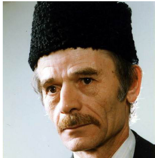
Mustafa Abdülcemil Qırımoğlu, also known as Mustafa Jemilev

In various interviews over the past few months, Mejlis head and member of the Ukrainian parliament Mustafa Jemilev laid out many of the grievances of the Crimean Tatars. 23 He said that in the past 20 years of Ukraine's independence, of which Crimea has been a part, "there was nothing good about it for Crimean Tatars." 24 Beside more general issues like various politicians' maneuverings towards Russia, he also cites specific issues. He says that "there is not a single Tatar in [the Security Service of Ukraine] and not a single judge," and other Tatar officials in Crimea were being removed from their positions, in one case replaced by a deputy minister from the Donetsk oblast, not even in Crimea. 25 Political representation in Crimea is also an issue, as there is no current system of "quota-based representation of the indigenous population in the Crimean parliament." Because of the community's small numbers, Crimean Tatars have virtually no chance of being elected to the Crimean parliament. 26 This statement is corroborated by data from a Razumkov Center poll, showing that Crimean Tatar representation even in local governments the proportion of Crimean Tatar representation is substantially lower than the percentage of the Crimean Tatar population in those areas. 27