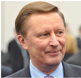
Deputy Prime Minister Sergei Ivanov, By Veni Markovski. [CC-BY 2.0 ( www.creativecommons.org/licenses/by/2.0 )], via Flickr.

as unilateral deployment of a global ballistic missile defense (BMD) system. Nor could we ignore the considerable imbalances in conventional arms, especially against the background of dangerous conflicts persisting in many regions of the world. It is not possible to talk about ‘global zero’ while disregarding all of these interrelated factors.” These factors and their interrelationships must be considered in any discussion on reducing tactical nuclear weapons. Lavrov then restated Moscow’s long-known precondition to such reductions, namely the “withdrawal of tactical nuclear weapons to the territory of the state to which they belong as well as removal of the infrastructure for their deployment abroad should be regarded as a first step towards the resolution of this problem.” 14 Removal of the infrastructure represents a tightening of Moscow’s preconditions. Global zero is impossible, in Lavrov’s view, without addressing the potential to deploy weapons in space, and comprehensive talks on missile defense are required involving all parties; in the absence of this approach global zero is rendered as a dead-end. 15