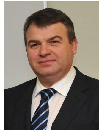
Anatoliy Serdyukov, Russia Defense Minister.

In the aftermath of the Russia-Georgia War, in August 2008 a document was quickly circulated in Moscow outlining an imminent systemic reform of the conventional armed forces, under the guise of giving the military a novyy oblik (new look). Of course, such a reform not only was long overdue but also undoubtedly planned prior to the war over Abkhazia and South Ossetia. 57 The choice of phrase reflected the negative connotations of “reform” at many levels in Russian society, particularly given the previously failed efforts in the armed forces. Putin had used the phrase in a speech in October 2003, and in early 2007 began calling for an “innovative army.” His appointment of Anatoliy Serdyukov in February 2007 as Defense Minister, a civilian with a background in the furniture business and in the finance ministry, signaled that words were giving way to action on the future of the military. 58 In September 2008 President Medvedev outlined a reform that would abandon cadre units and bring all formations to permanent readiness; overhaul and simplify command and control; improve officer training and education; introduce modern equipment and weapons, especially high-precision systems; and enhance pay, housing and social conditions for servicemen. 59 Serdyukov’s short broadcast on the Defense Ministry’s Zvezda TV on October 14, 2008, added a little more detail, but the nature of the reform only emerged gradually. 60