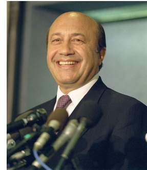
Former Foreign Minister Igor Ivanov

In an article in Izvestiya in October 2010, as the START III treaty was going through its ratification procedures and prior to the NATO Summit in Lisbon in November 2010, former Russian Prime Minister Yevgeny Primakov, Foreign Minister Igor Ivanov, President of the Kurchatov Institute Yevgeny Velikhov, and former Chief of the General Staff Army-General (retired) Mikhail Moiseyev offered an analysis of Russian nuclear policy and sketched the possible future parameters of nuclear disarmament. Significantly, the article argued that nuclear deterrence addresses the threat perceptions of the 20th century and is effectively powerless in terms of the new 21st century threats, ranging from international terrorism, transnational crime, and ethnic and religious conflict to the proliferation of WMD. Nuclear deterrence in this context may actually encourage nuclear proliferation and hamper cooperation on a broad range of transnational threats and the development of joint missile defense systems. Dvorkin highlighted the apparent opening this might offer, and noted the forward thinking in the thesis. 52 Clearly, the questioning of the limits of nuclear deterrence in Russian security policy was by no means a signal of a policy shift in Moscow, but rather that the path outlined to pursuing such a disarmament agenda was fraught with difficulty.