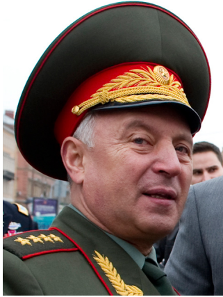
Russian Gen. Nikolai Makarov, Chief of the General Staff of the Armed Forces of Russia