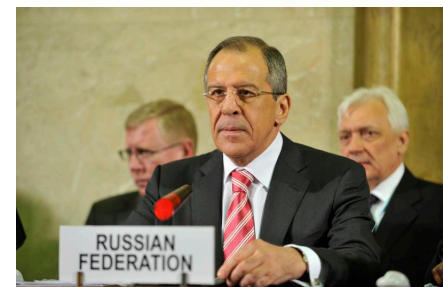
Sergei Lavrov during Disarmament Conference, By Jean-Marc Ferre, UN. [CC-BY-NC-ND 2.0 ( www.creativecommons.org/licenses/by-nc-nd/2.0 )], via Flickr.

On March 1, 2011, Russian Foreign Minister Sergei Lavrov addressed the UN Conference on Disarmament in Geneva. Lavrov praised START III as a contribution to strengthening global security and the nonproliferation regime. The reduction of strategic nuclear weapons will be irreversible, verifiable and transparent, and, according to Lavrov, the principles of equality, parity and equal and indivisible security stipulated in the treaty denote a "gold standard" in reaching similar military-political agreements in future. On the one hand, Lavrov appeared to welcome global zero as an aspiration, characterizing proposals linked to the initiative as "reasonable and constructive." On the other hand, the Russian Foreign Minister set out a series of factors that makes talk of global zero speculative: "We use our contacts to present the Russian position on the prospects of nuclear disarmament in a very detailed way. This position is defined by the key principle of the indivisibility of security. We insist that there is a clear need to take into account the factors that negatively affect strategic stability, such as plans to place weapons in outer space, to develop non-nuclear armed strategic offensive weapons, as well