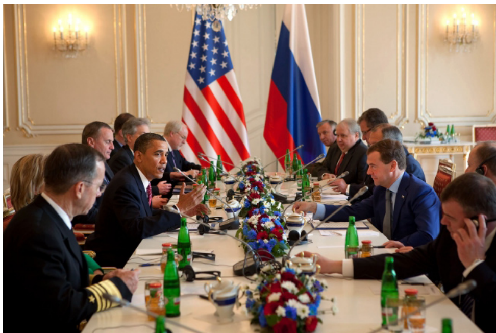
PHOTO: President Barack Obama, center-left, and President Dmitry Medvedev of Russia, center-right, attend an expanded delegation bilateral meeting at Prague Castle for the new START Treaty. (Official White House Photo by Pete Souza via www.whitehouse.gov )

The transformation of the table of organization and equipment (TOE) of Russia's conventional armed forces and modernization program to 2020 signals a clear break from past reliance on mass mobilization. It marks a coming to terms with the strategic traumas to the military following the end of the Cold War and collapse of the Soviet Union, reorienting its force structure to the types of conflict Russia may face in the future. Combined with the “reset” in relations between Washington and Moscow and a gradual improvement of NATO-Russia relations since the Alliance froze ties for six months following the Russia-Georgia War in August 2008, hopes that a new era in nuclear disarmament may be approaching followed the ratification of the Strategic Arms Reduction Treaty (START III) in early 2011. Pressure towards further deepening disarmament regimes is growing, with calls in Washington and Europe to foster a new dialogue with Moscow.