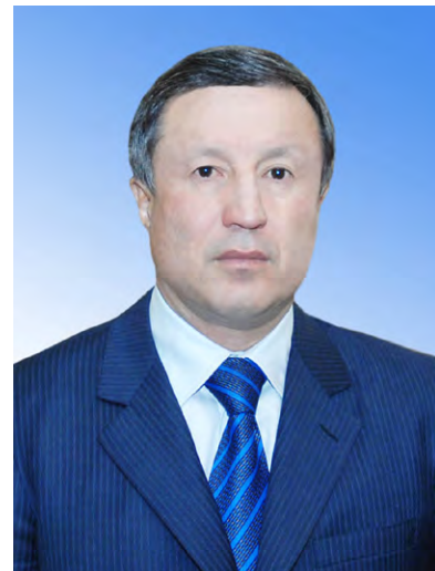
Kazakhstan's Minister of Defense Adilbek R. Dzhaksybekov

29, 2010, President Nazarbayev reinforced this sense of high ambition for the state by outlining Astana's policy objectives to 2020. In relation to defense and security Nazarbayev set high priority on the task of strengthening "interethnic harmony, national security" and further developing the country's international relations. "Harmony and stability in the society" and "state security" were defined as the main aims of domestic and national security policy to 2020. He added that "We will pursue an active, pragmatic and balanced foreign policy aimed at ensuring national interests, increasing the international prestige of our country and strengthening national, regional and global security." These priorities, tied to the future economic and social development of the country determined the need for a revised NSS, likely containing these features, and demonstrate the difficult balancing act in pursuing a defense and security policy closely mirroring the so-called "multi-vector" foreign policy. 11