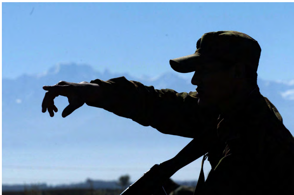
PHOTO: A Kazakh NCO points to the mission objective in front of Kazakhstan's mountainous terrain during an information exchange field exercise.

Kazakhstan's 2011 Military Doctrine runs to 4,720 words in Russian and is divided into four parts: introduction,