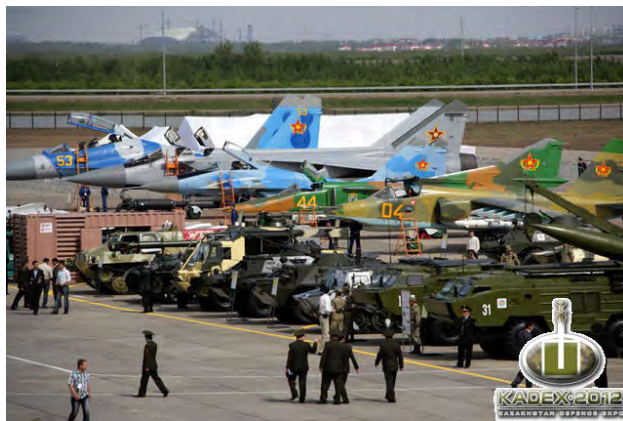
Military equipment on display at KADEX 2012

In this sense, having identified the interest in high-technology systems contained in the 2011 Military Doctrine, it makes more sense to observe this pattern in Astana's foreign procurement patterns. Its interest in receiving US C-130 transport aircraft has evidently waned. In 2010 Kazakhstan became the first Central Asian country to hold an international military exhibition and KADEX 2012 in Astana on May 3-6, 2012, demonstrated continued political commitment to boost the domestic defense industry by seeking additional foreign defense industry partners. KADEX 2012 was a much larger military exhibition than its first foray into the international arms market two years earlier, involving 250 companies from more than twenty countries worldwide. During the exhibition