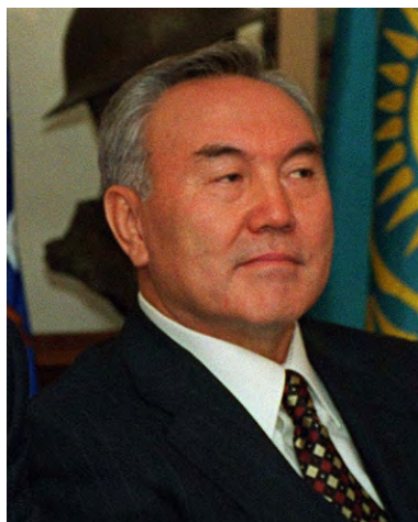
The president of Kazakhstan, Nursultan Nazarbayev

At a bureaucratic level the planning and development of Military Doctrine in Kazakhstan follows a similar pattern to such processes in Russia. Indeed the approach to how the document is drafted, edited and revised is steeped in the military and defense planning legacy of the Soviet era. 5 The starting point in the drafting and revision process is rooted in earlier versions of the doctrine, including consideration of the clauses requiring rewording or the need for new entries, and the removal of obsolete elements. Kazakhstan introduced its first Military Doctrine in 1993 within only a few months of forming its independent Armed Forces on May 7, 1992, although some domestic critics suggested this it was never fully implemented, before revising the document in 2000 and issuing a third doctrine in 2007. Many Western and Russian defense experts regarded the first two doctrines in 1993 and 2000 as strongly influenced by the Soviet legacy and this was confirmed by the nuances between the successive defense ministers in the country during the 1990s, each in turn advocating variations of Soviet approaches to defense and security. 6