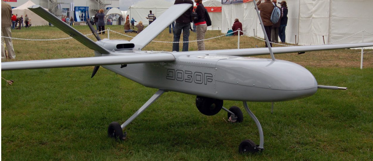
Dozor-100 UAV

conduct, especially at tactical level was unclear. 11 New experimental communications models were field tested during Kavkaz, Lagoda and Zapad 2009, but while this served to link the need to overhaul existing C 3 systems, a key aspect in the reform agenda, it also signaled an early linkage between the “new look” and developing network-centric approaches to combat operations. More than ten years ago, the use of radio sets at company level preceded their later introduction at squad level; studying these exercises convinced the General Staff of the need to equip every soldier with personal sets. Those using the automated C 2 system reported that it was overly complicated, and far from user friendly. Throughout 2010, officers received additional training in the use of the new system, as the technology compelled their retraining. 12