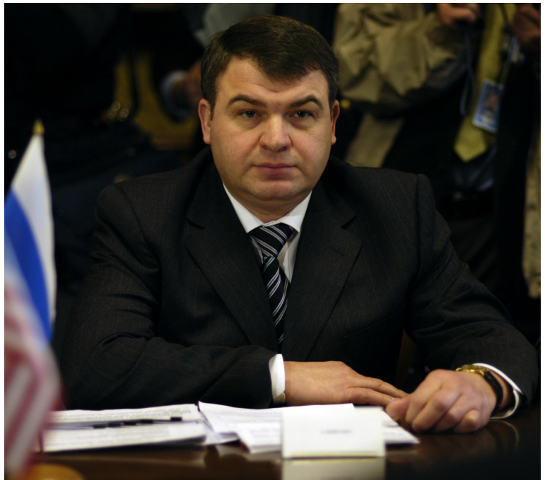
PHOTO: Anatoliy Serdyukov.

T he reform of the Russian conventional armed forces, announced in the aftermath of the Russia-Georgia War in August 2008, as part of an agenda that became known as the “new look” cannot be understood, or properly assessed, unless its fundamental drivers are defined. Overall, following Defense Minister, Anatoliy Serdyukov, declaring the key features of the reform on October 14, 2008 on the day he briefed a closed session of the defense ministry collegium, the reform agenda appeared guided by an effort to enhance the combat capabilities and combat readiness of their conventional armed forces, loosely centered on the paradigm of forming mobile, smaller and modernized forces. It seemed to make sense given the operational failings of the Russian armed forces during the Five-Day War, and marked a consistent and determined campaign to drag the military out of its twentieth-century table of organization and equipment (TOE) to re-equip, restructure and train for the conflicts of the twenty-first century. 1