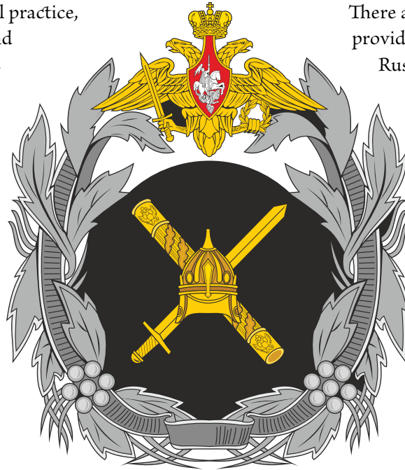
Emblem of the General Staff of the Russian Armed Forces

The Russian military does not directly or fully illuminate what it does in conceiving, developing, implementing, and coordinating actions to affect what it describes as the “amalgam of calculation and risk” of its adversaries. 7 To a significant degree, its process is dogmatic, secretive, and opportunistic at the same time. Moreover, sometimes Russian influence events obviously involve the armed forces, and at other times, the armed forces seem to grapple and play catch-up with actions that defy their deep culture of planning. 8 Nevertheless, surveying some of the General Staff’s doctrinal developments resulted in a structured exposure to how the Russian military may look at influence, particularly in the competition period. There is also the potential to see how they can be expected to deal with it going forward, even emerging with a more consolidated and central role among the state’s security institutions.