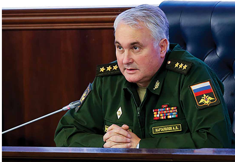
Col.-Gen. Andrei Kartapolov, chief of the Main Operational Directorate of the Russian General Staff, conducts a press conference 19 November 2015 detailing the results of Russian air strikes in Syria.

instigating force or alternative police. This could be considered a disorganizing activity. The Cossacks who were deployed as alternative, pro-Russian police forces in the immediate aftermath of the Crimean seizure are an example of these citizen militias coordinating and integrating in Russian military operations. In the current Russian military encyclopedia, the