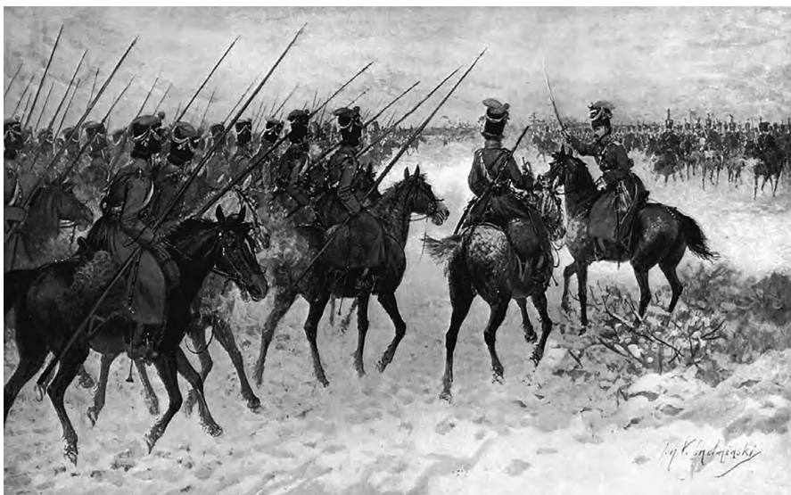
Figure 2. As irregular cavalry, the Cossack horsemen of the Russian steppes were best suited to reconnaissance, scouting and harassing the enemy's flanks and supply lines.

Moscow-controlled guerrillas complicated an already difficult German supply effort.