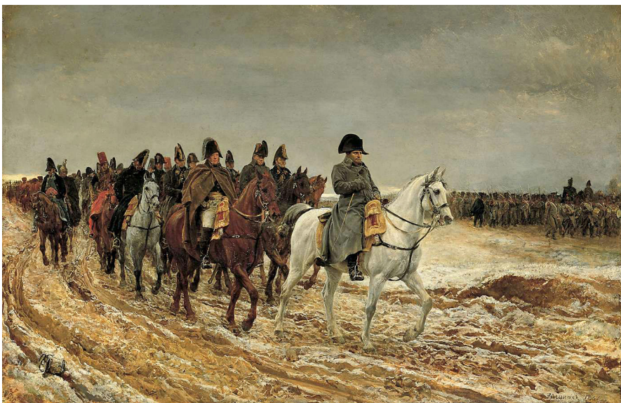
Figure 1. A 1920 painting depicts Napoleon's retreat from Moscow.

The Soviet Union did not intend to defeat Nazi Germany in this fashion, but after bungling the initial period of war, they inadvertently emulated Tsar Alexander I by fighting a retreat all the way to Moscow while building the forces for a series of counterstrokes. This time, Moscow held while the German effort culminated and their supply lines stretched to breaking. The muddy roads and "inverted front" of