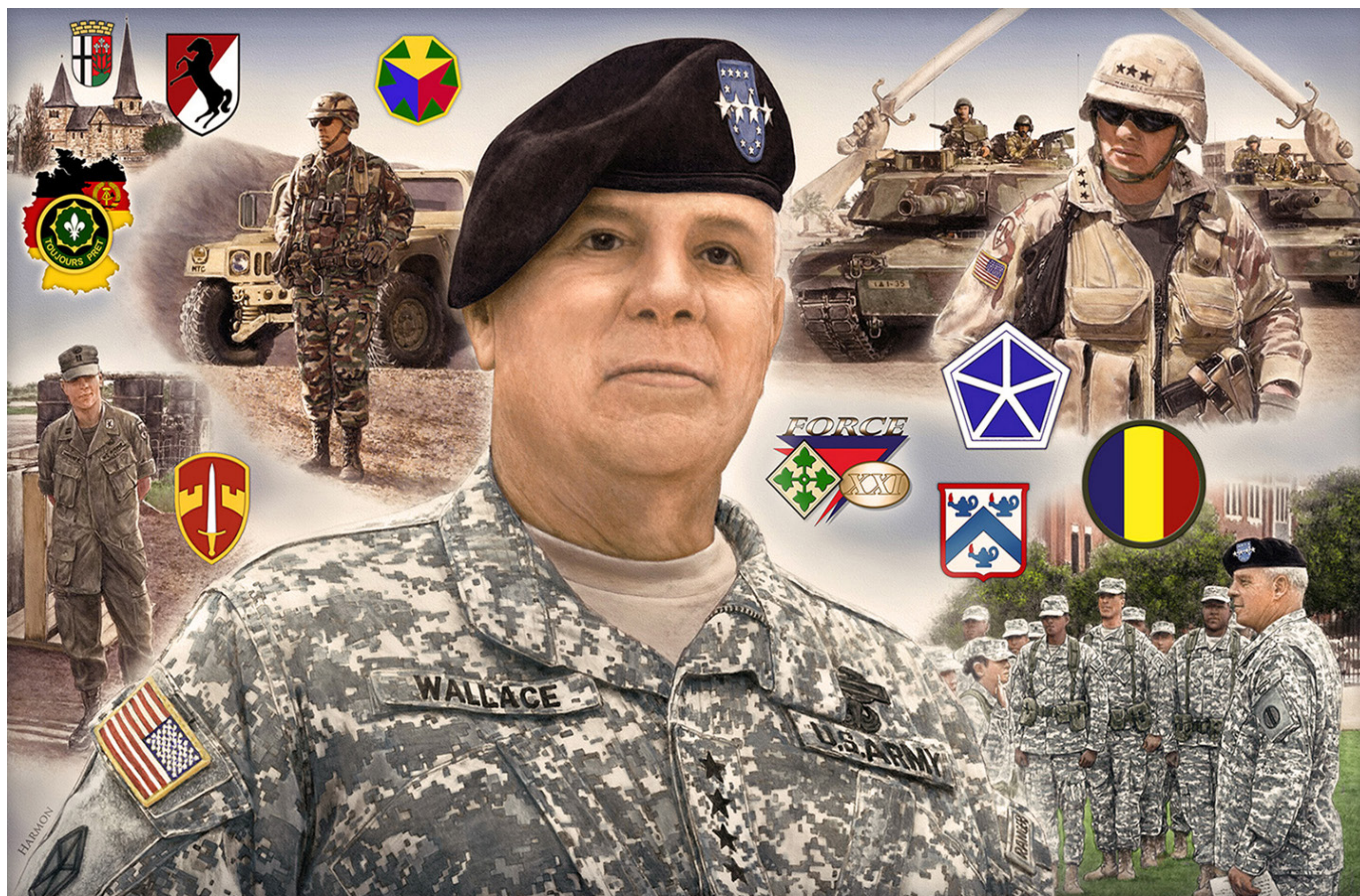
GENERAL WILLIAM S. WALLACE