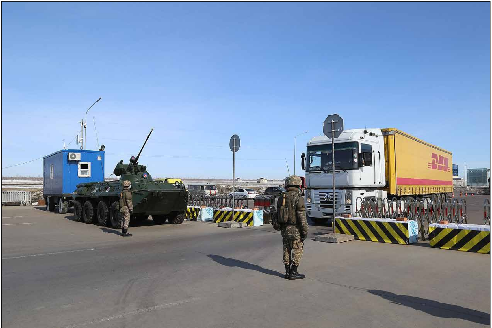
Quarantine in Nur-Sultan. 26 March 2020.

The Deputy Chief of the General Staff mentions that the conscripts in the special groups “will serve at checkpoints, patrol, disinfect and guard facilities and participate in flood control” and that “in regions where military units are garrisoned, there may not be a draft.” The article also reports that those drafted “will receive the same salary as they get now,” that they “will serve close to their place of residence so that they can spend the night at home” and that the “same benefits for military personnel will be provided for those conscripted into the special groups.” End OE Watch Commentary (Stein)