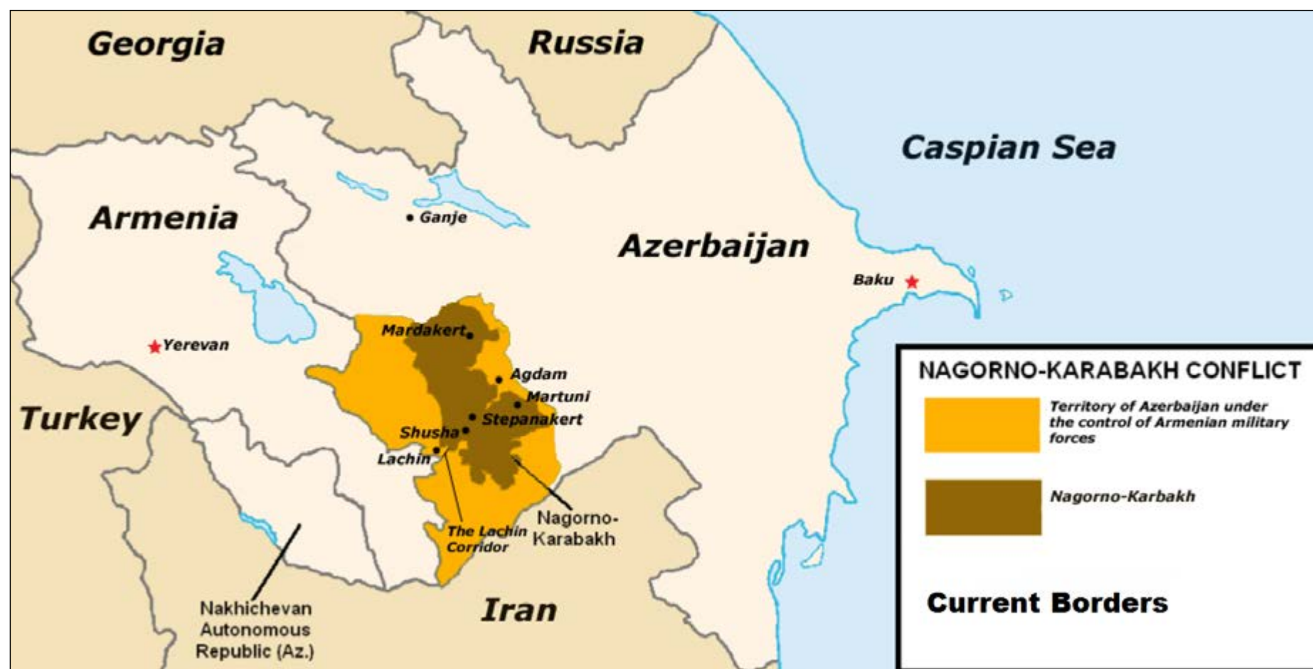
Map of South Caucasus featuring conflict in Nagorno-Karabakh.

“As soon as the situation escalated in Karabakh, the transit of military cargo through Georgia was suspended both by land and by air, both in the direction of Azerbaijan and Armenia.”