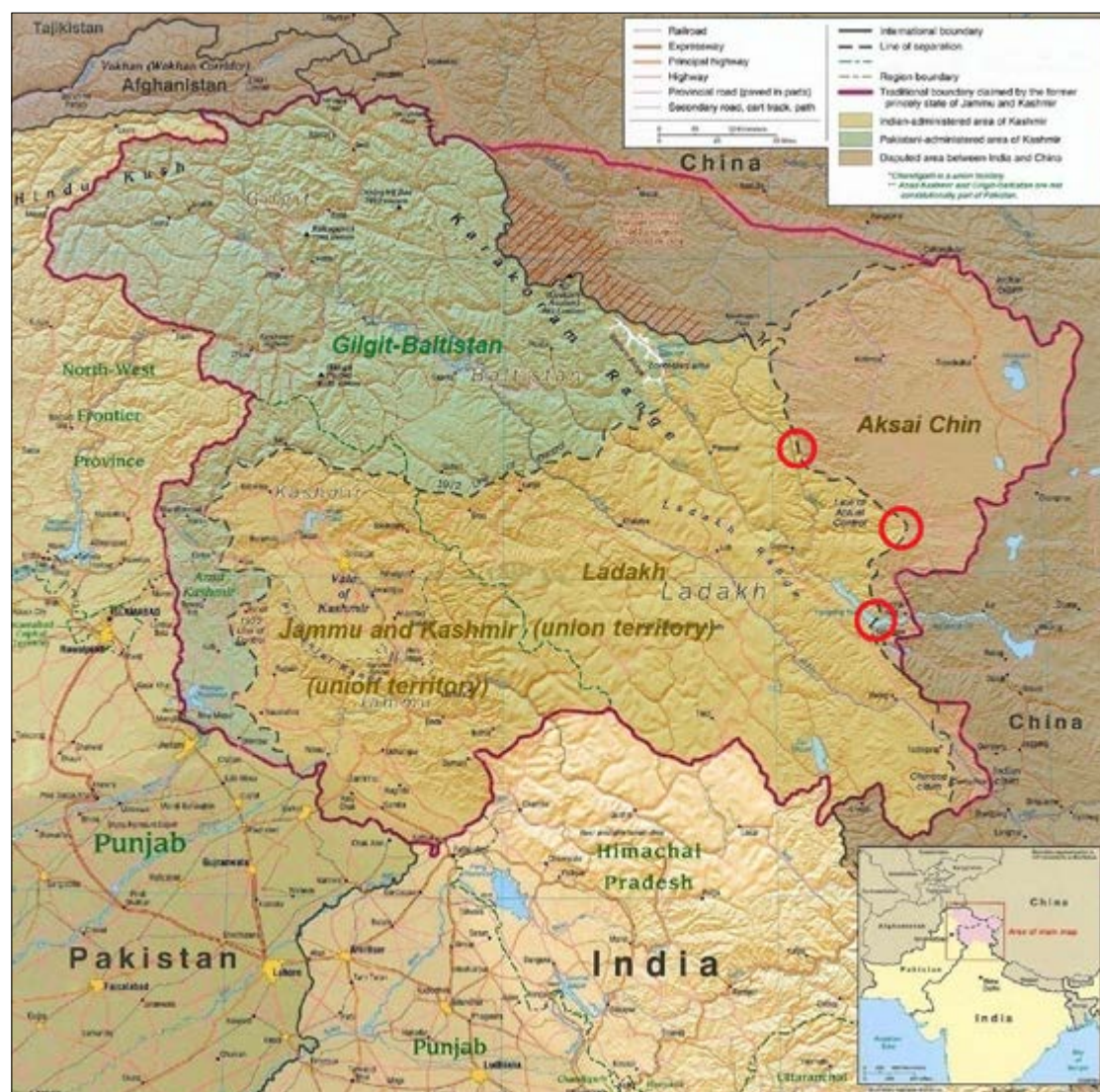
Map of Disputed Kashmir Region.