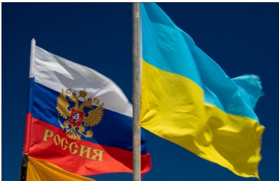
Flags of Russia and Ukraine.

Source: https://www.publicdomainpictures.net/en/view-image.php?image=280507&picture=flag-of-russia-and-ukraine Public Domain