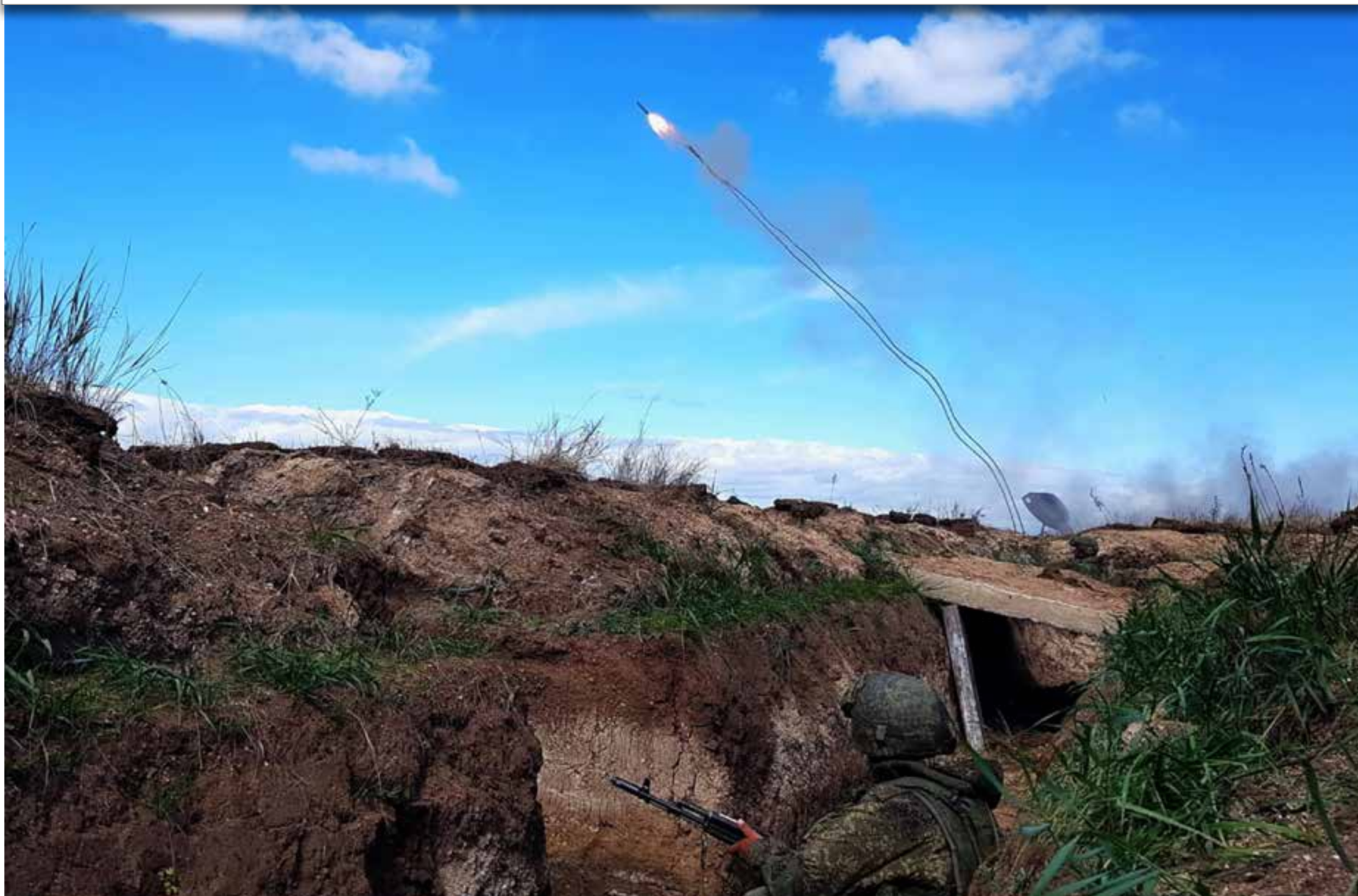
Performing engineering tasks in preparation for the Vostok-2018 maneuvers.

“The armies of the district are facing very large, formation-level tactical exercises, in which the opposed forces techniques that have been developed must continue,” Colonel-General Aleksandr Dvornikov indicated.