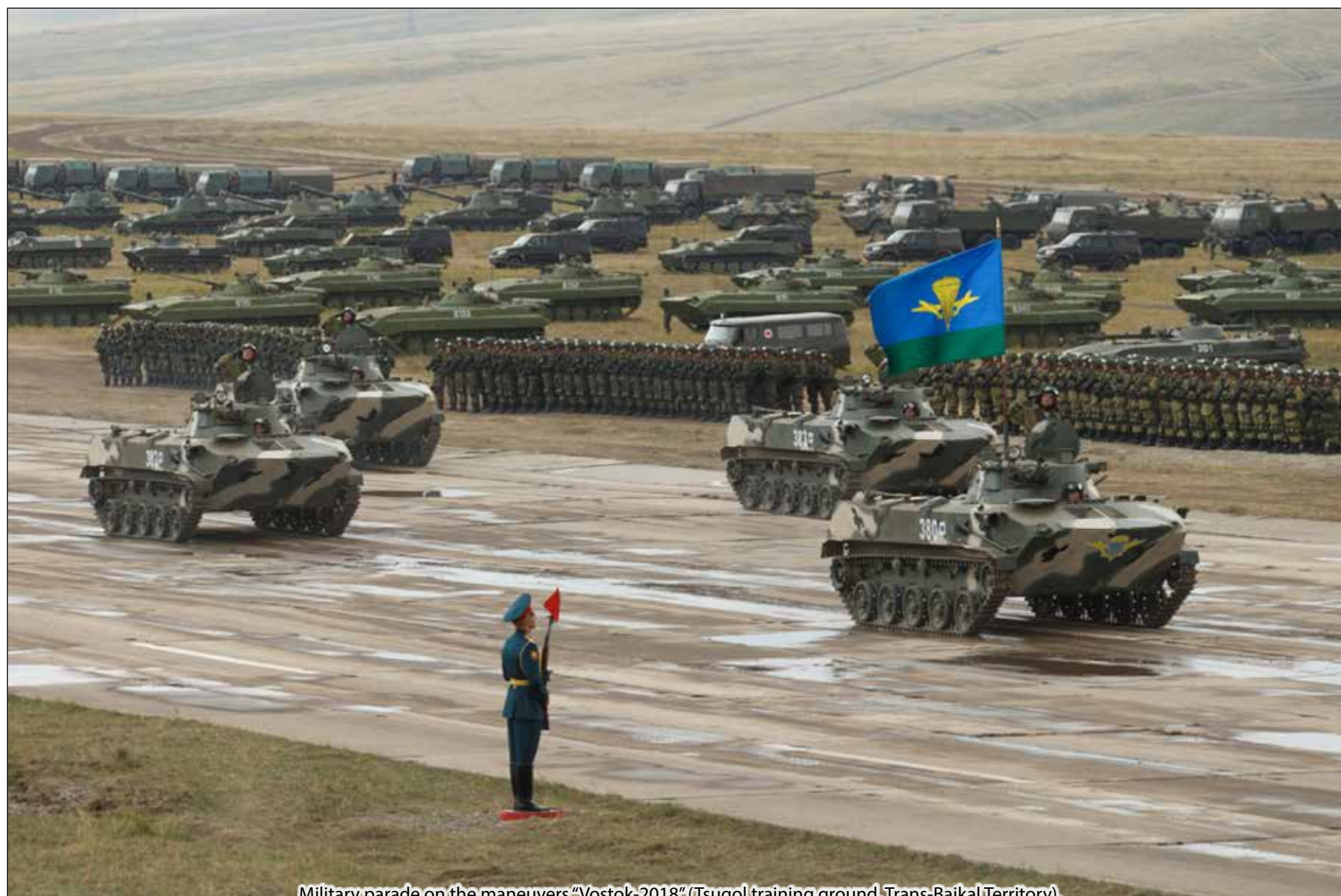
Military parade on the maneuvers "Vostok-2018" (Tsugol training ground, Trans-Baikal Territory).