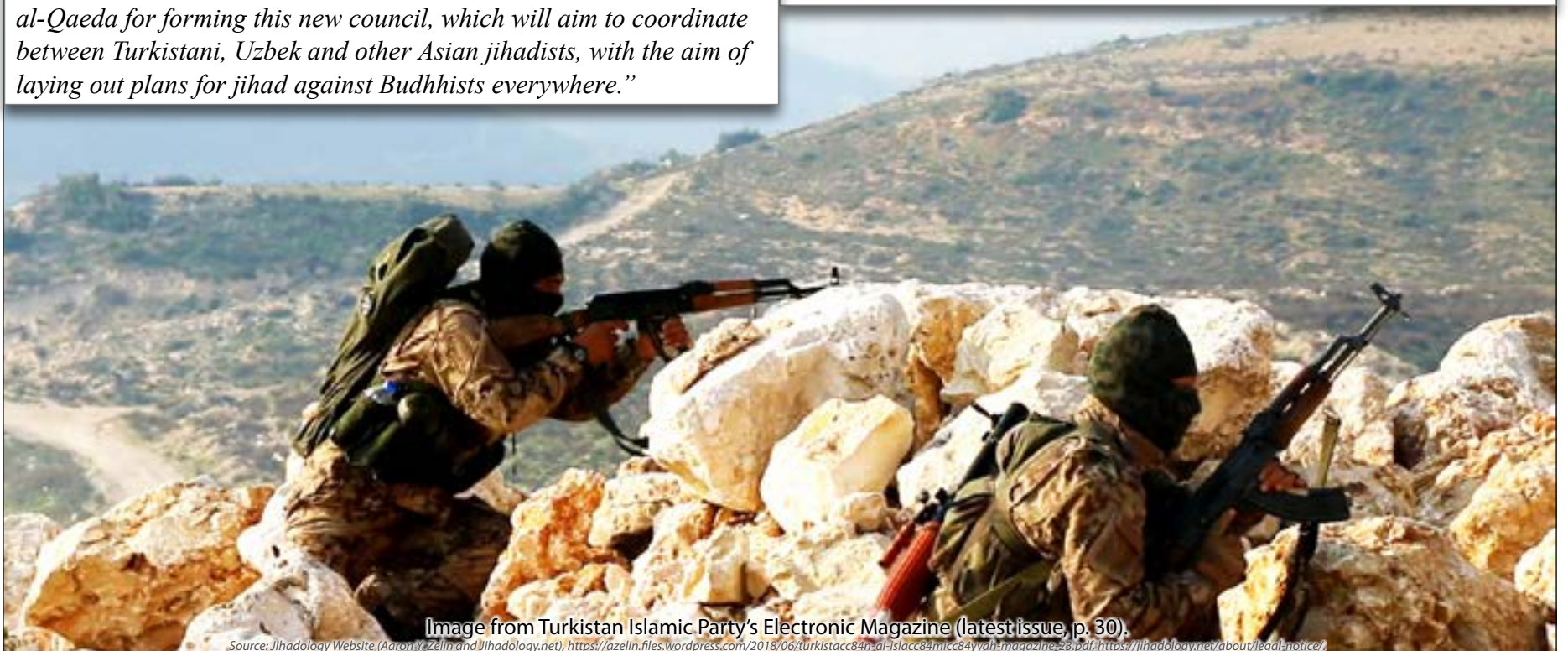
Image from Turkistan Islamic Party's Electronic Magazine (latest issue, p.30).