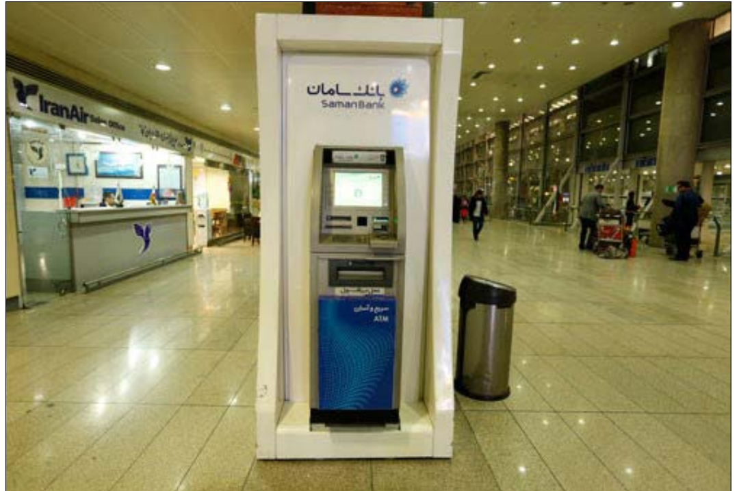
An ATM in Imam Khomeini Airport City.

Financial sanctions have largely insulated the Iranian economy from the outside world. The Islamic Republic developed its own electronic network in 2002 to create an intranet for Iranian banks and most Iranian banks were connected to the system by 2010. This has allowed Iranian banks to issue ATM cards both to allow Iranians to access Iranian rials and conduct other banking functions such as electronically paying bills and taxes. Despite this network, broad distrust of Iranian banks and suspicion about government has hampered the Iranian government's efforts to make society less cash dependent. That such scams are occurring with increasing frequency and now merit a special warning and a hotline likely will reinforce ordinary Iranians' preference to conduct cash transactions rather than rely on electronic banking. This in turn will both limit Iranian government insight into many financial transactions and breathe new life into a currency black market which thrives on differences between official and street rates." End OE Watch Commentary (Rubin)