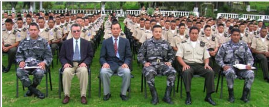
Ecuador's Meditating Security Forces used IDT technology to break the hovering barrier.

The POTUS voiced her approval and the next morning they put the finishing touches on her speech as they watched the international press conference by the President of Ecuador. As predicted by