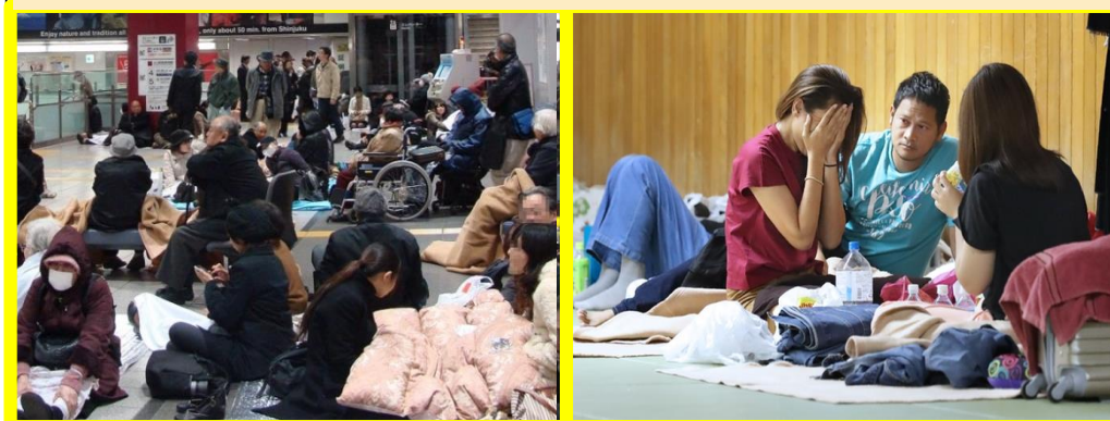
Outset of Various Victims