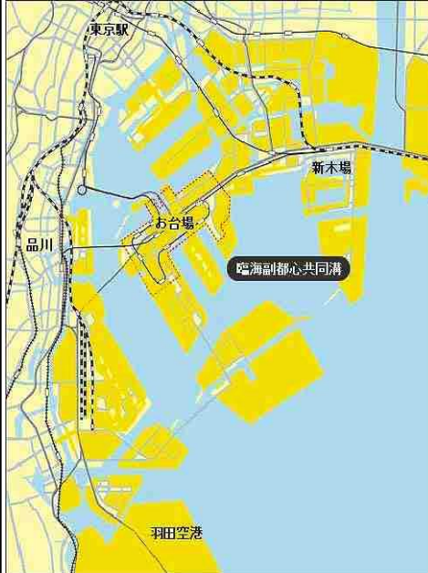
Liquefaction in the Bay Area where many reclaimed areas exist