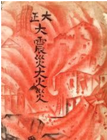
The Documents of the Great Kanto Earthquake