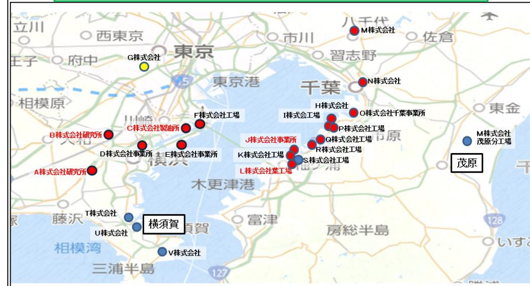
Distribution Map of Toxic Industrial Chemical (TIC)