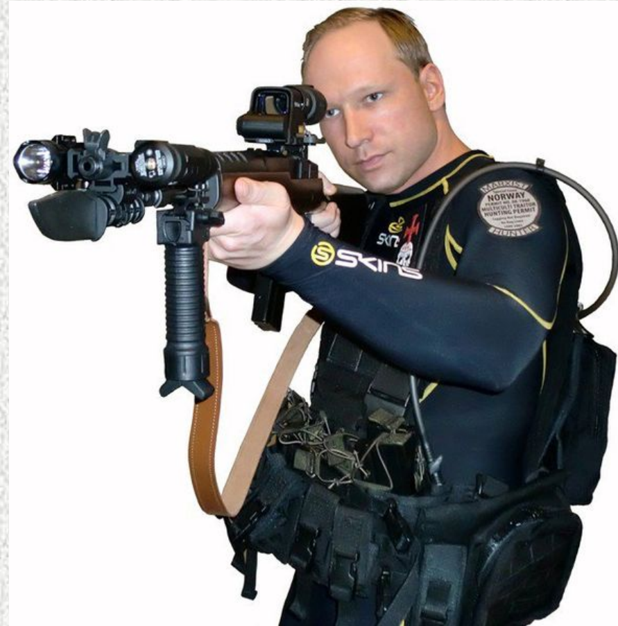
Breivik in "uniform" 7