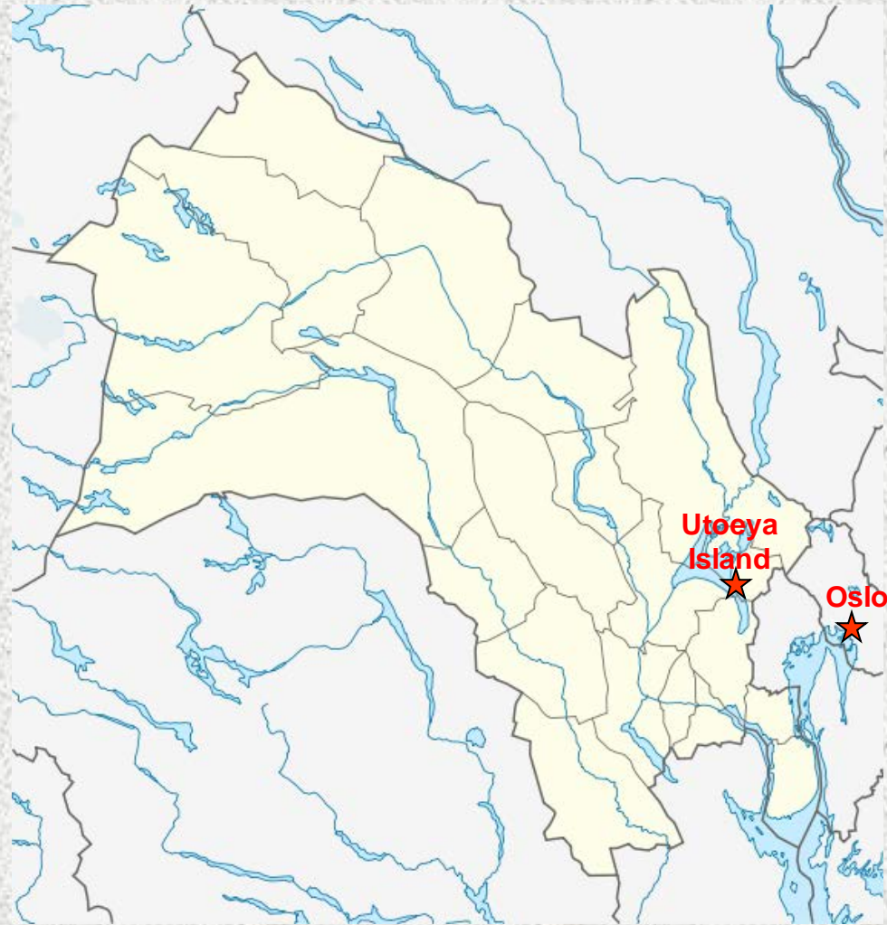
Utoeya Island in relation to Oslo 9