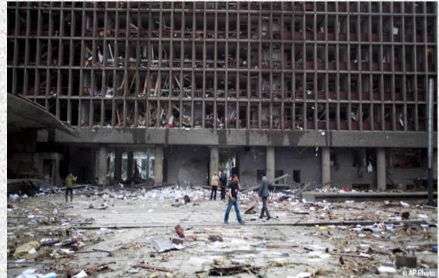
Oslo Bomb Destruction 3