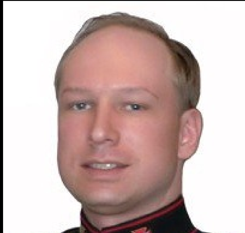
Anders Behring Breivik 1

Publication Date: 30 September 2011 Information Cut-Off Date: 1 September 2011