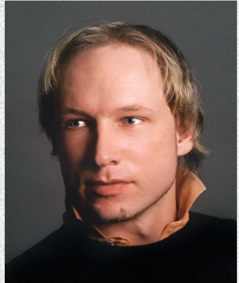
Breivik Self Portrait 13