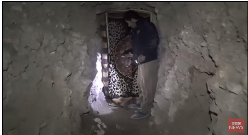
Figure 2. ISIL tunnels in Sinjar (video link)

During the next fifteen months, ISIL emptied the city of most of its inhabitants and prepared battle positions in anticipation of an inevitable major Kurdish attack to retake the city. Kurdish forces entered and captured parts of Sinjar, but were unable to gain complete control. From positions within the city,