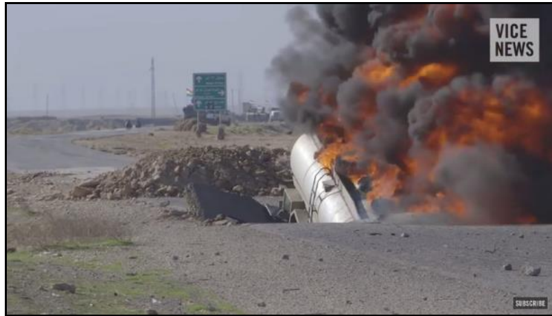
Figure 4. Peshmerga attack from East (video link)

While some Kurdish fighters attacked from the north, others moved from the east and the west of Sinjar to cut off ISIL's supply line along highway 47 between Mosul and Raqqa. Fighters, mostly PKK, attacked from the west while a predominately Peshmerga force attacked from the east. ISIL utilized practiced techniques in attempting to prevent its supply line from being cut and its units surrounded. ISIL used marksmen, snipers, ambushes, IEDs, and suicide bombers along the road and in the city to block movement. The coalition force eventually cleared the road after a few days of slow and cautious movement. Most of the ISIL fighters